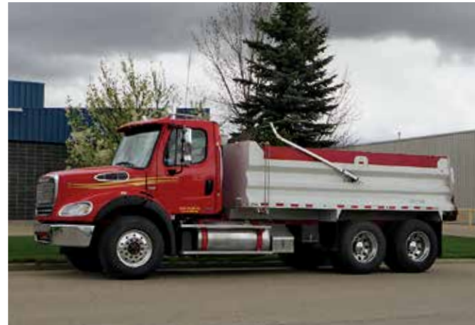
2011 Freightliner M2112