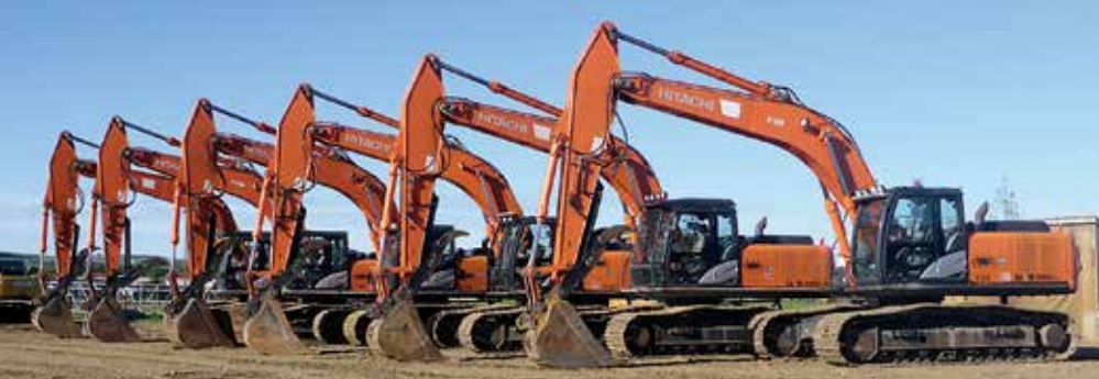
3 of 4 – 2015 & 3 of 5 – 2013 Hitachi ZX290LC-5N