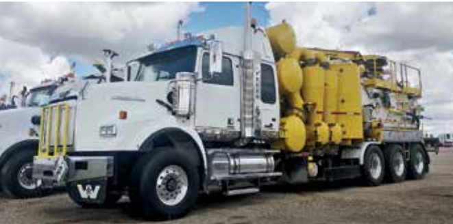
2013 Western Star 4900SA Hydro Vac