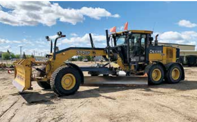
1 of 2 – 2013 John Deere 772GP AWD