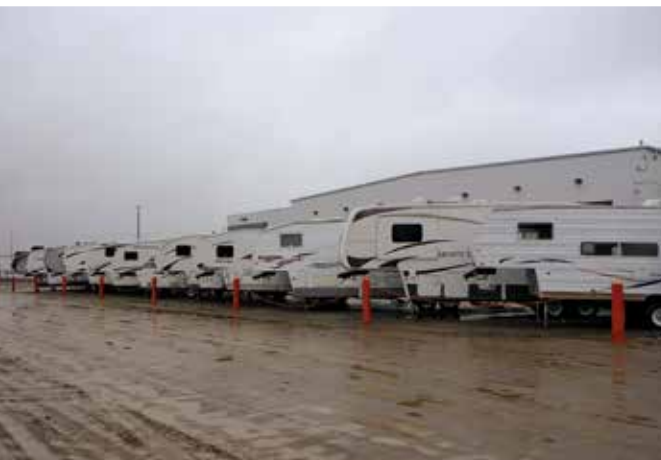
11 of 25 – Travel Trailers