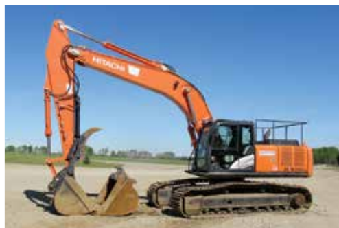
1 of 3 – 2014 Hitachi ZX290LC-5N