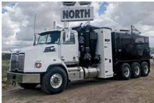
Unused – 2019 Western Star 4700 Chinook Hydro Vac