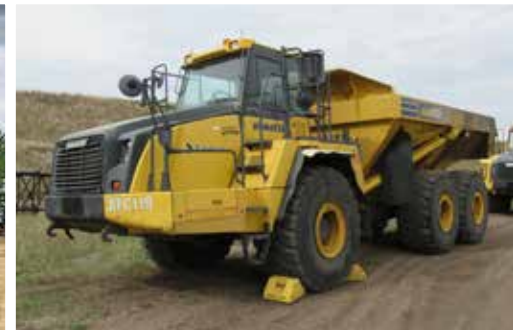
1 of 6 – Komatsu HM400-3 6x6