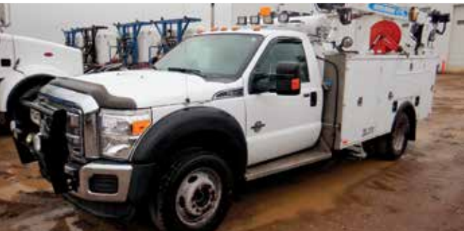
2015 Ford F550 XLT 4x4