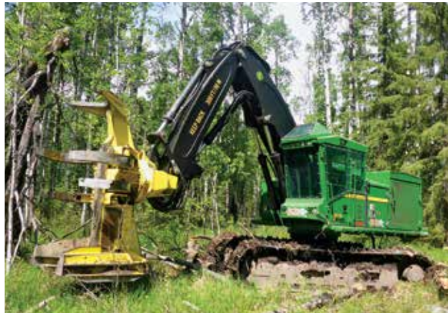
2014 John Deere 903K