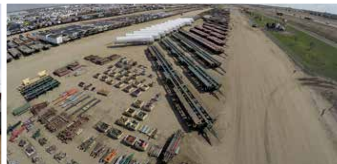
Modular Trailers & Accessories