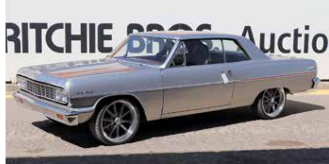
1964 Chevrolet Malibu SS