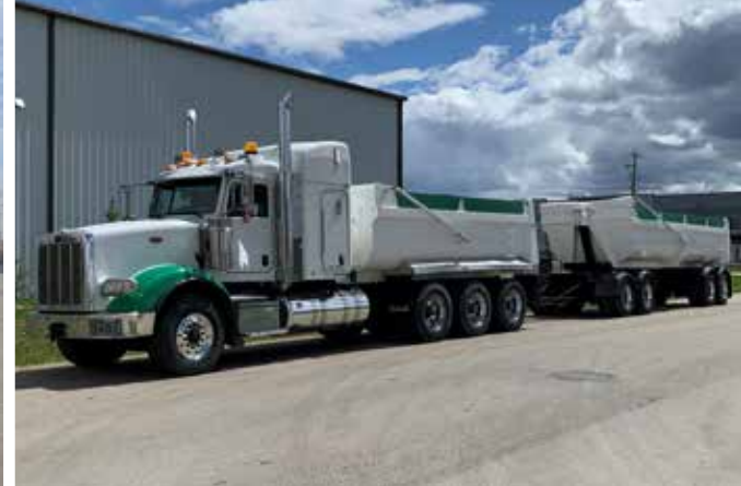
2014 Peterbilt 367 & 2014 Arnes