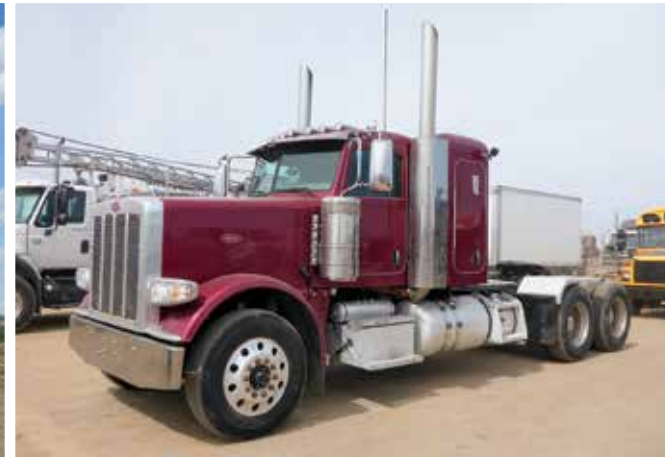
2013 Peterbilt 388