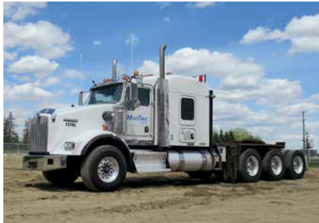
2013 Kenworth T800