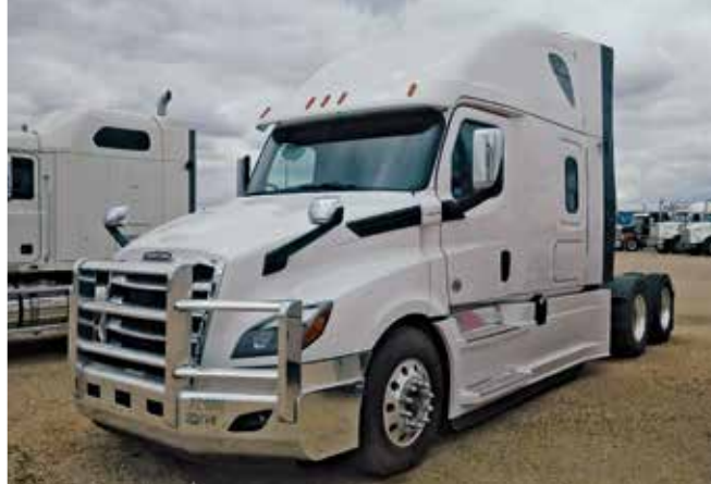
2019 Freightliner Cascadia