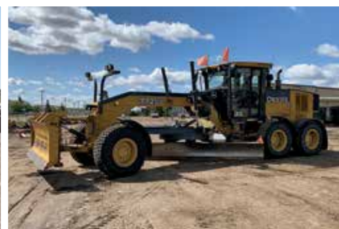
1 of 2 – 2013 John Deere 772GP AWD