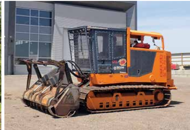
2010 CMI 250 Hurricane