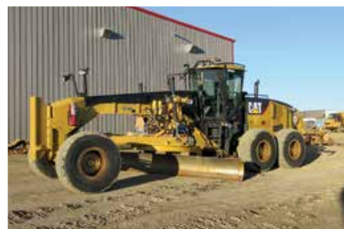
2011 Caterpillar 14M VHP Plus