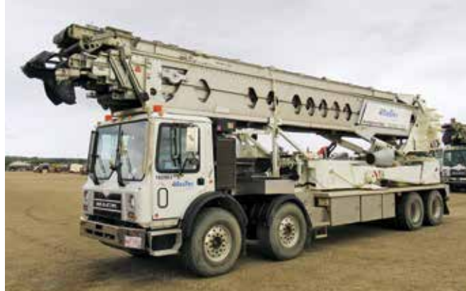
2013 Mack w/Putzmeister TB110