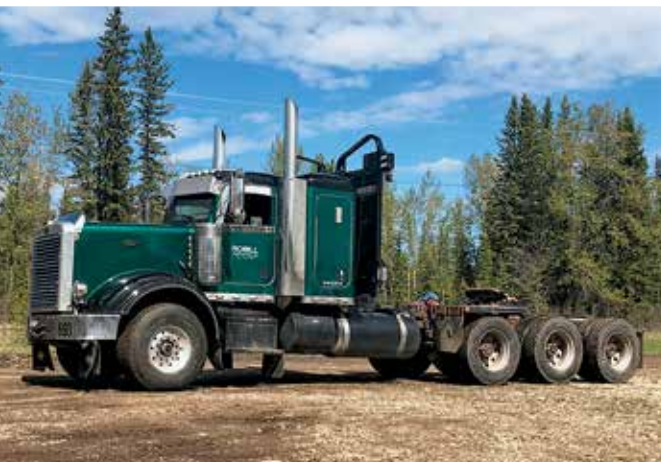
2015 Peterbilt 367