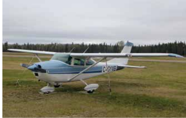
1969 182M Cessna Selling by photo, located at Whitecourt Airport, AB