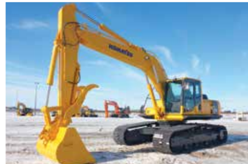
2011 Komatsu PC270LC-8