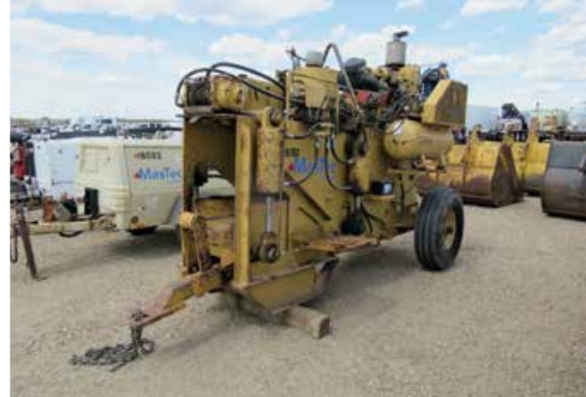
DMI PB Pipe Bender