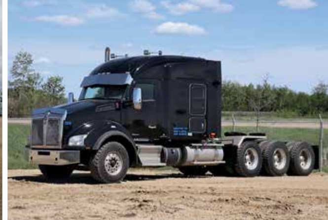
2018 Kenworth T880