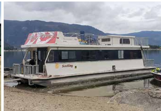
1986 Three Buoys – Selling by photo, located at Sicamous, BC