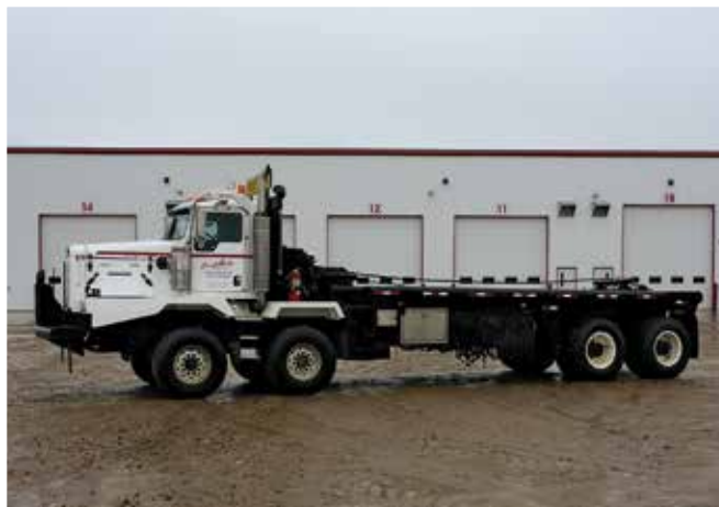
1 of 2 – Kenworth C500