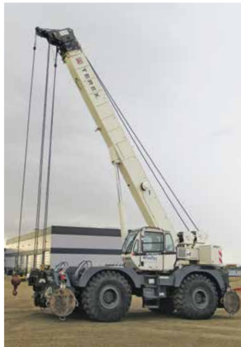
2012 Terex RT670-1