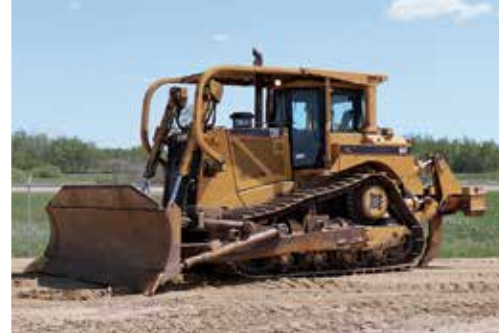
1 of 2 – Caterpillar D8T