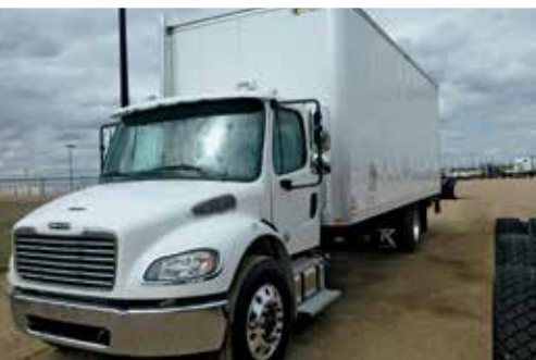
2017 Freightliner M2106 Delivery