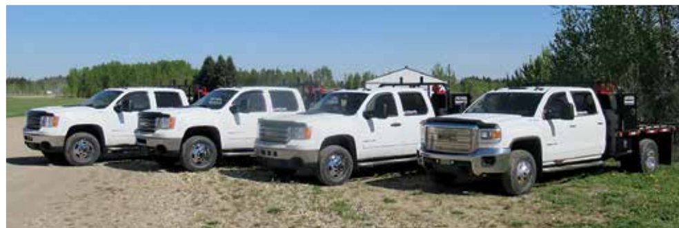
2016, 1 of 2 - 2015 & 2 of 3 - 2014 GMC 3500HD 4x4