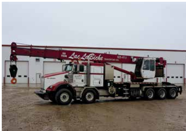
2012 Kenworth T800 w/Manitex 50 Ton