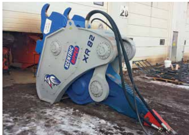
2018 Xcentric Ripper XR82