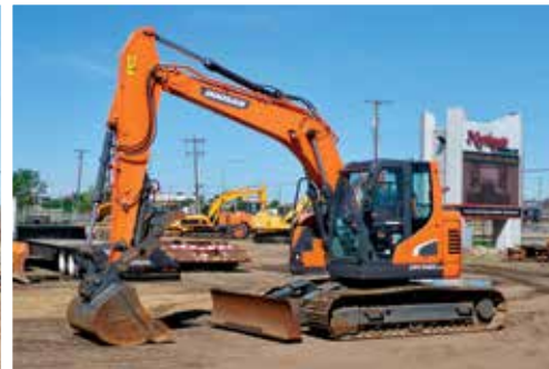
2016 Doosan DX140LCR-5