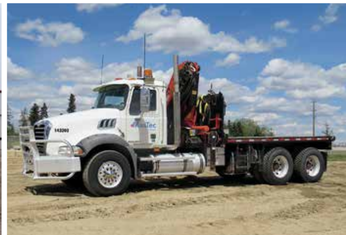
Mack GU813 w/Palfinger PK2000