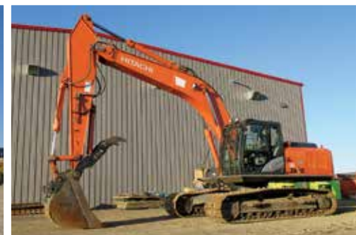
2014 Hitachi ZX250LC-5N