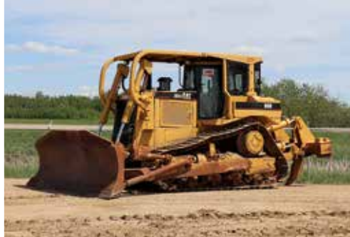
Caterpillar D8R Series II