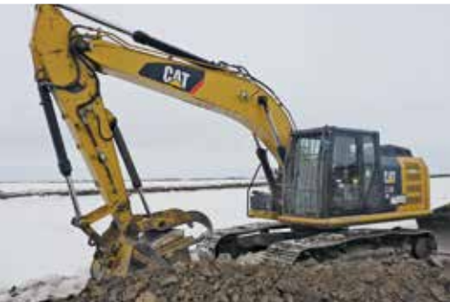
2012 Caterpillar 320EL