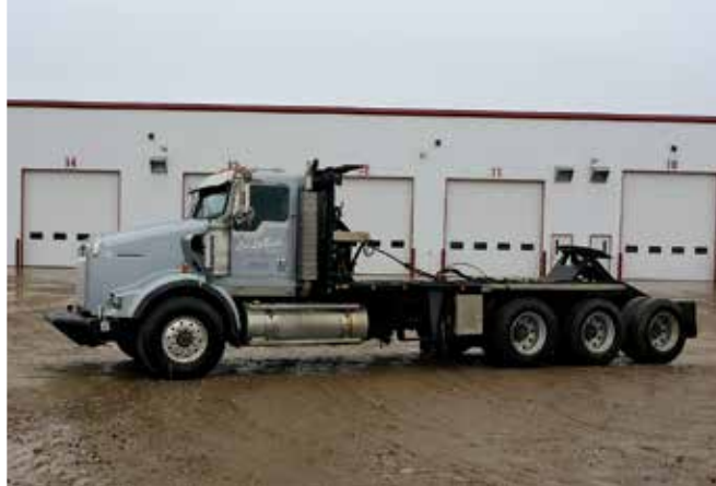
Kenworth T800 Winch