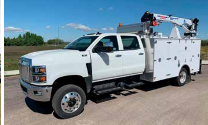
Unused – 2019 International CV515 4x4