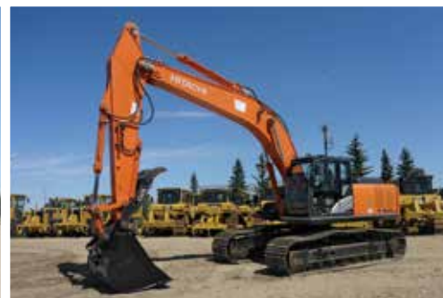
2013 Hitachi ZX290LC-5