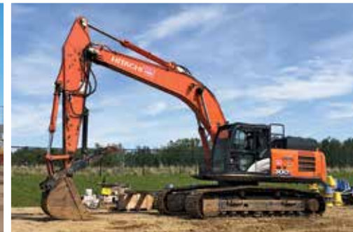
2018 Hitachi ZX300LC-6N