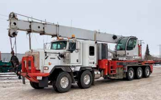
2014 Kenworth C500 w/National NBT45TM