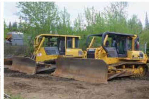
2 – Komatsu D85EX-15