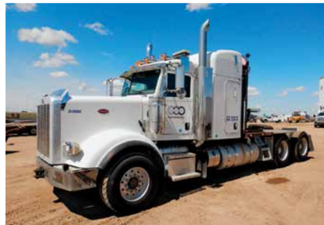
2014 Peterbilt 367 Winch