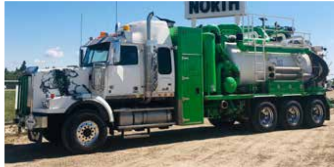
2015 Western Star 4900SA Hydro Vac