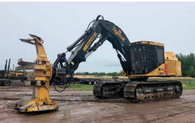
2016 Tigercat 870C