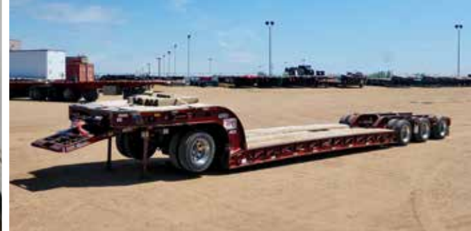
2013 Aspen 1+3 Double Drop Combo