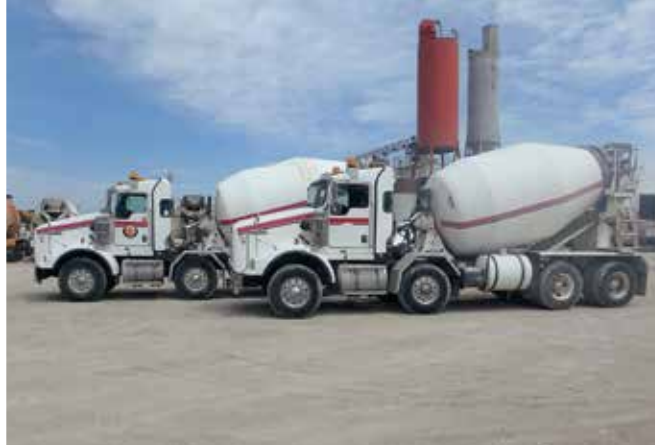
2 – 2014 Kenworth T800