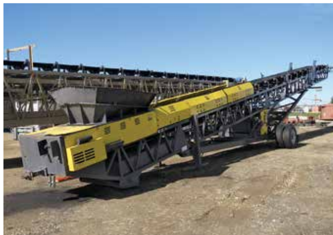
2018 Vale Industries 3680S-DH