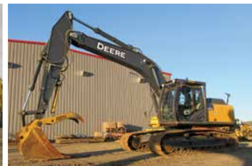
2017 John Deere 290G LC