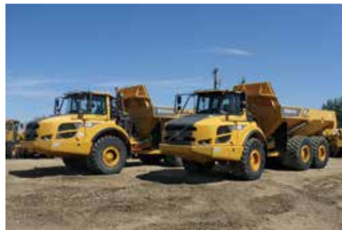
2 – 2014 Volvo A30F 6x6