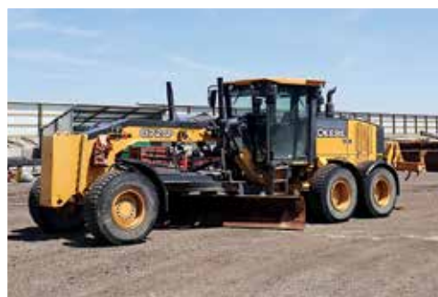
2012 John Deere 872GP AWD