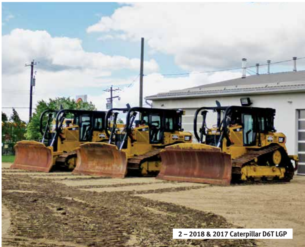
2 – 2018 & 2017 Caterpillar D6T LGP