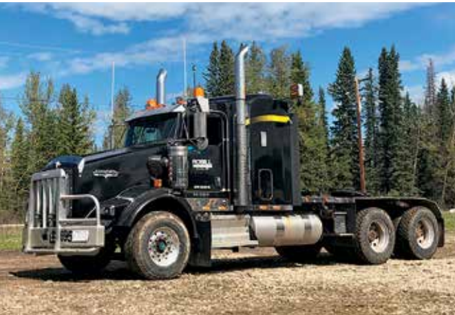
1 of 3 - 2014 Kenworth T800