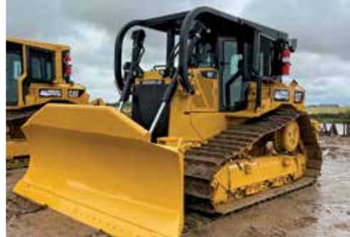
2013 Caterpillar D6T LGP