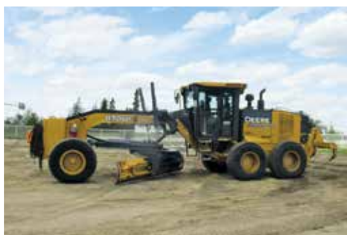
2013 John Deere 870GP