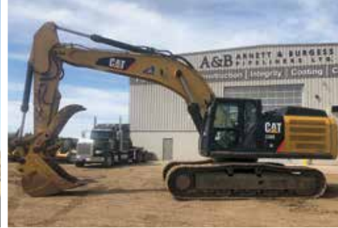
1 of 2 – Caterpillar 336EL