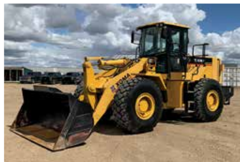
2015 XGMA XG856-III