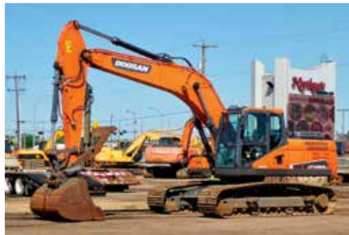
2015 Doosan DX225LC-5