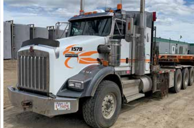
2012 Kenworth T800 Texas Bed Winch