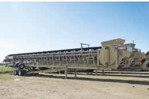
Unused – 2019 KPI 33-36150 Super Stacker & Unused – 2019 KPI 33-36130 Super Stacker