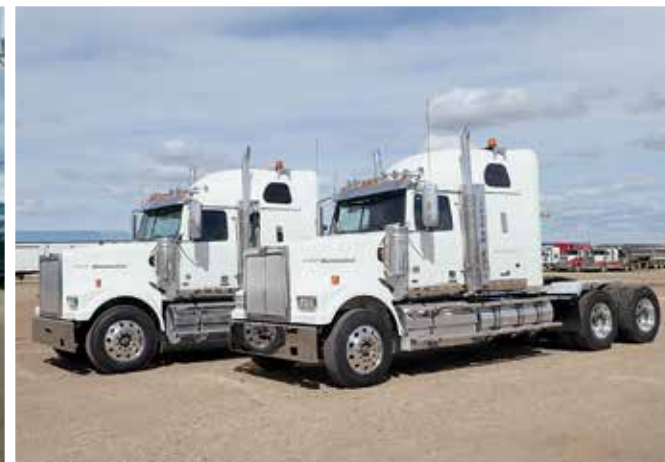
2 of 3 - 2015 Western Star 4900FA