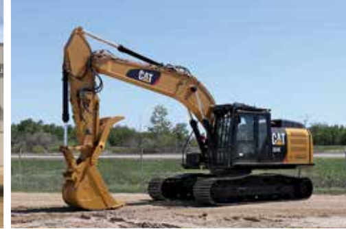
2013 Caterpillar 324EL