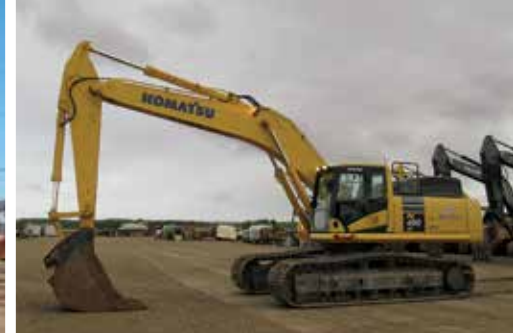
2014 Komatsu PC490LC-10