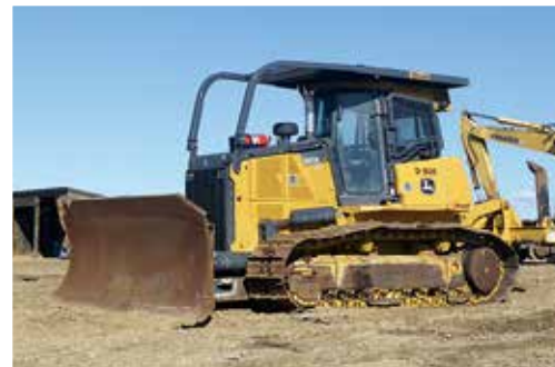
1 of 2 – 2015 John Deere 850K WLT