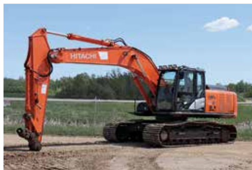
2013 Hitachi ZX210LC-5N