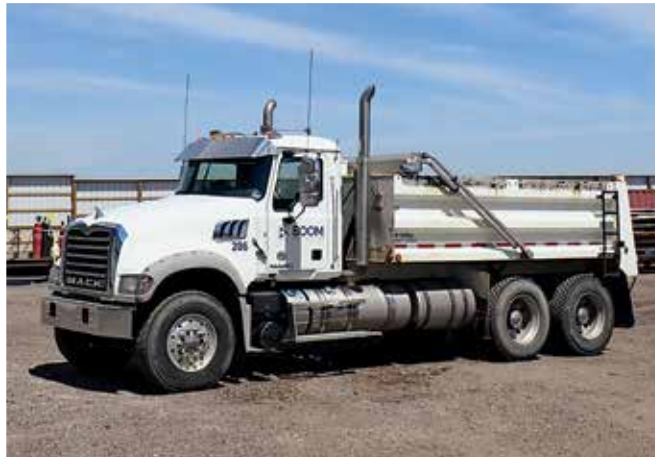
2014 Mack GU713 Granite