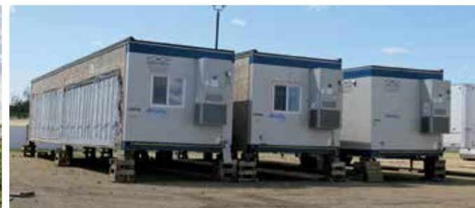
1 of 2 – 2014 Double Diamond 60 x 12 Ft 3 Unit Frameless Office Selling by photo, located at Blackfalds, AB