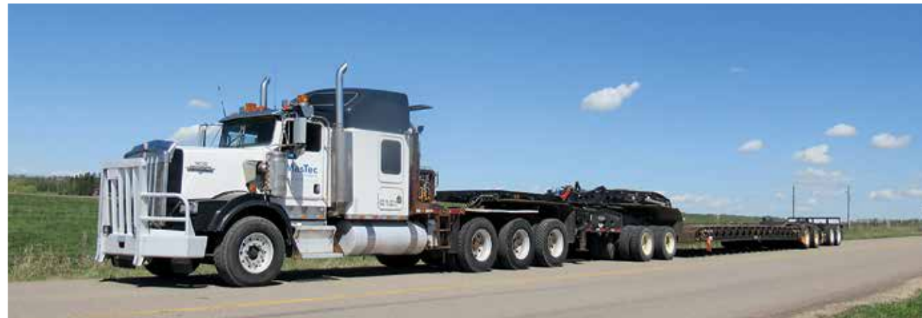
Kenworth T800 Winch, 2015 Peerless LB65, 2015 Peerless JP45 & Peerless TAT-20-2ASS