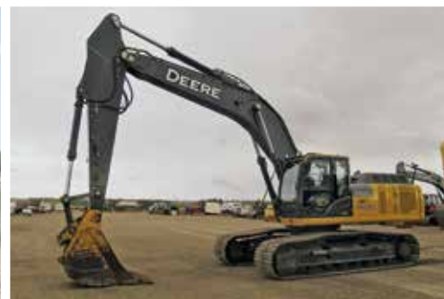
2015 John Deere 350G LC