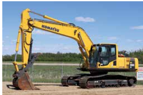
2017 Komatsu PC200LC-8