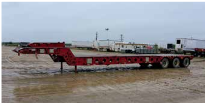
2013 Gerrys Scissorsneck