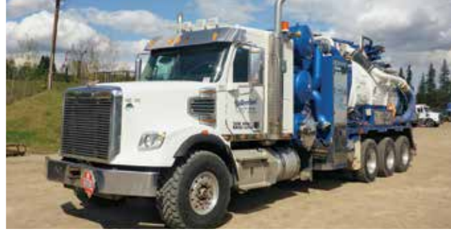
2014 Freightliner Coronado SD Hydro Vac