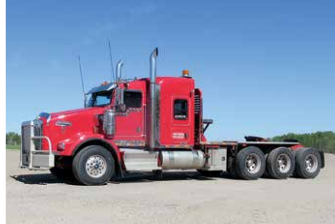
2013 Kenworth T800 Winch