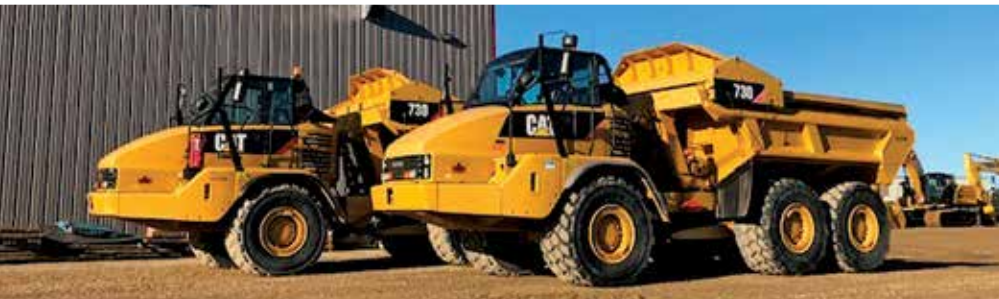
2014 & 2013 Caterpillar 730EJ Ejector 6x6