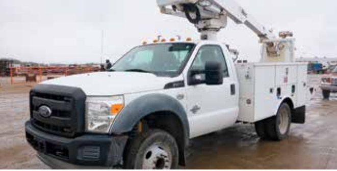
2010 Ford F350 XL w/Altec AT235