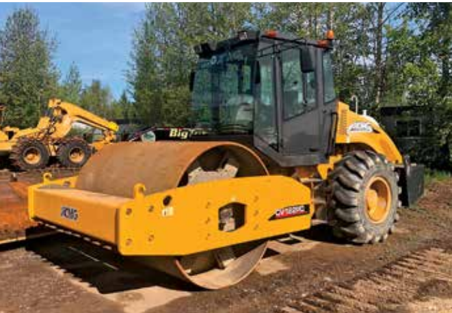
2013 HCMG CV122PD