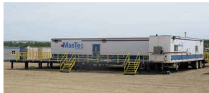
Dura Ramp 4 Unit Warehouse & Loading Dock Selling by photo, located at Blackfalds, AB