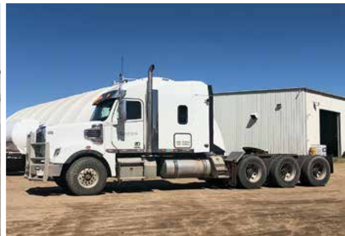
2013 Freightliner Coronado SD122