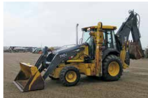
2011 John Deere 710J