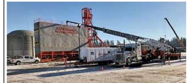
True Grit 1700 Frac Sand Plant