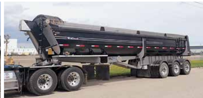
2018 Midland MG37SK3400X