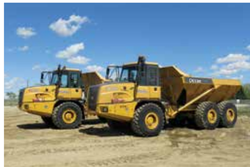
2 of 4 – 2012 John Deere 300D Series II 6x6