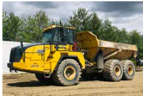
1 of 5 – 2013 Komatsu HM300-3 6x6