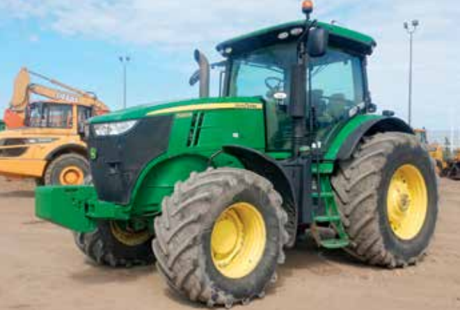
2013 John Deere 7200R