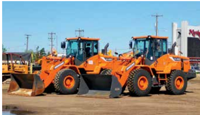
Unused – 2016 Doosan DL200-5 & 2016 Doosan DL200-5 – Low meter hours