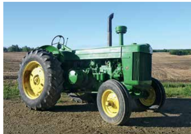
1953 John Deere R 2WD Wide Front