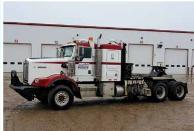
Kenworth C500 Winch