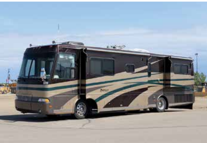
Beaver Patriot 38 Ft