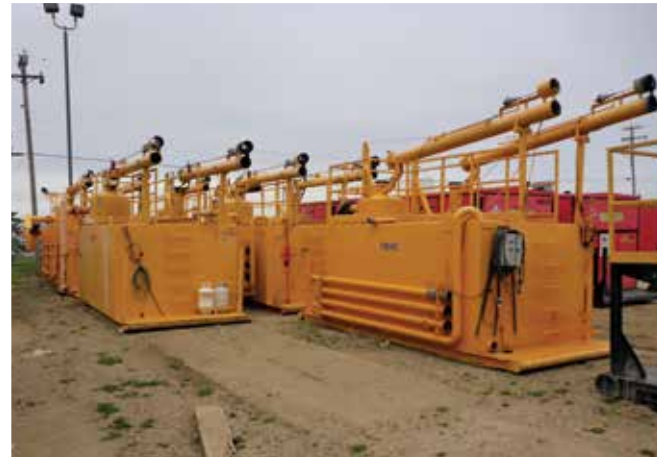
3 – Flocc Tanks