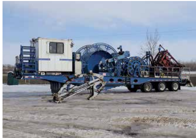
Hydra Rig Class 3 Coil Tubing Unit