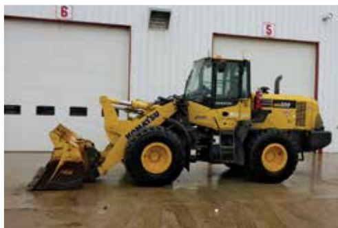
2014 Komatsu WA320-7