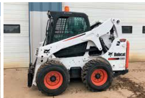
2010 Bobcat S650