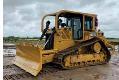
2012 Caterpillar D6T LGP