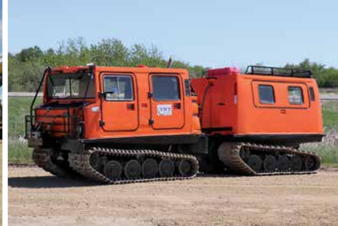
1 of 2 – Hagglund BV206D