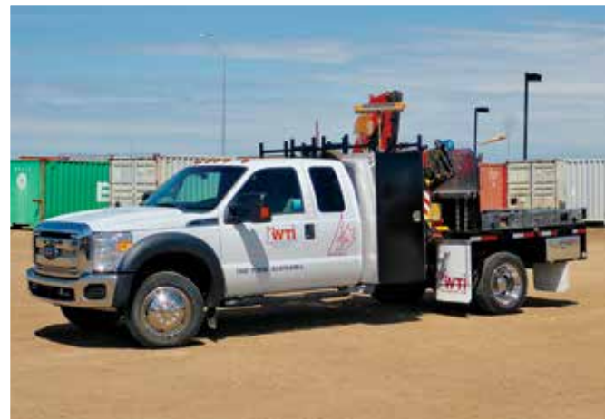
2015 Ford F550 w/Fassi F65A