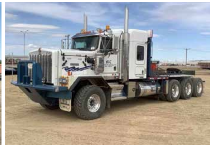
2015 Kenworth C500 Winch