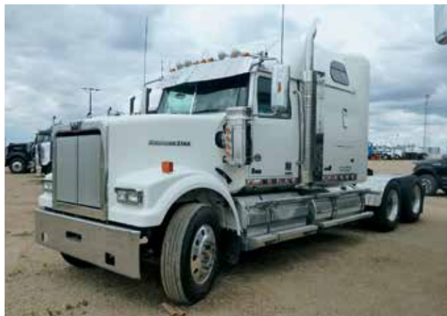
2018 Western Star 4900FA