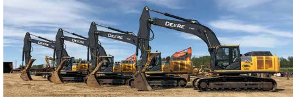
2 – 2014 & 2 of 6 – 2012 John Deere 290G LC