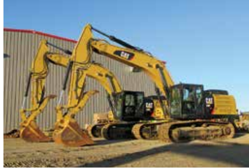
2018 & 2017 Caterpillar 336FL