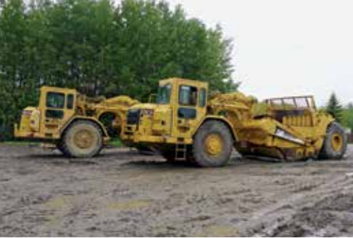
2 – Caterpillar 621G