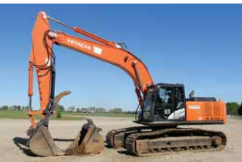
1 of 4 – 2015 Hitachi ZX290LC-5N