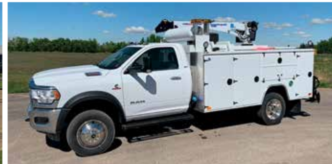
Unused - 2019 Ram 5500 4x4