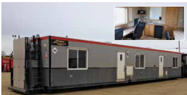
2012 Teton 60 x 12 Ft Command Center