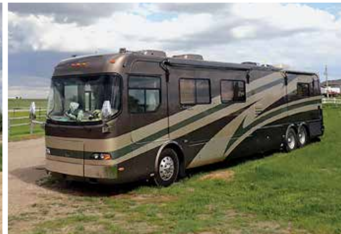
Roadmaster Holiday Rambler Navigator PBQT 46 Ft