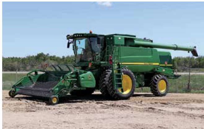
2013 John Deere T670

See complete auction and equipment information on our website