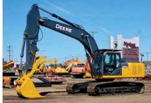
1 of 2 – 2013 John Deere 250G LC