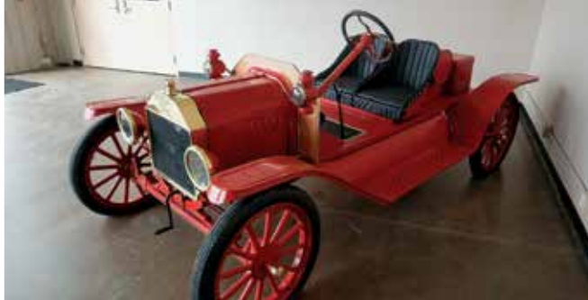
1914 Ford Model T Brass Speedster