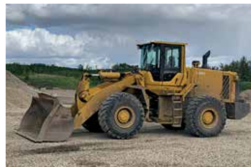
2017 Foton Lovol 956H