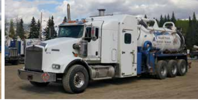
1 of 2 - 2012 Kenworth T800 Combo