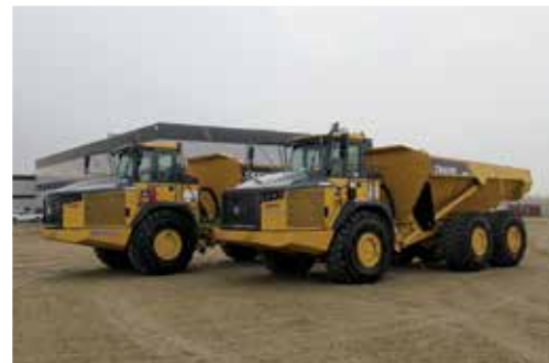
2 – 2013 John Deere 410E 6x6