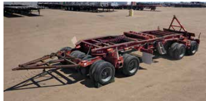
Aspen 32 Wheel