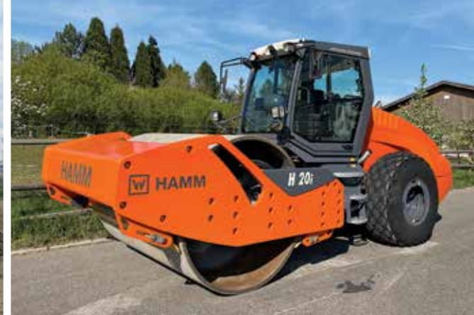
2016 Hamm H20i