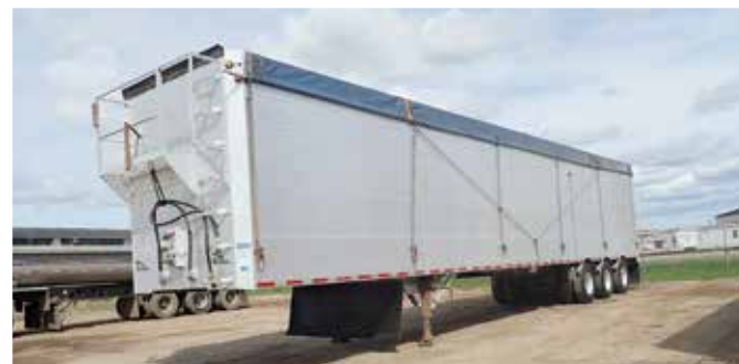
2012 ITI DDS 53 Ft Walking Floor