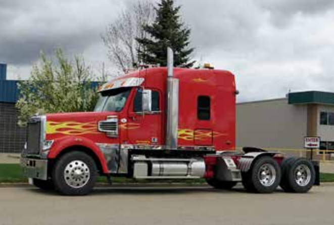
2011 Freightliner Coronado 132