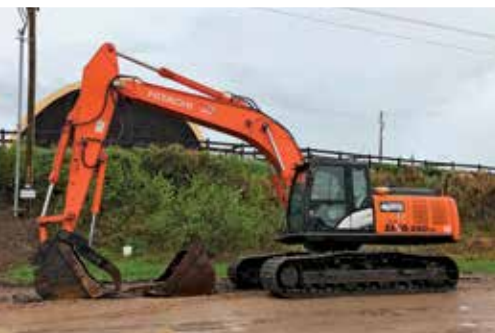
2013 Hitachi ZX250LC-5N