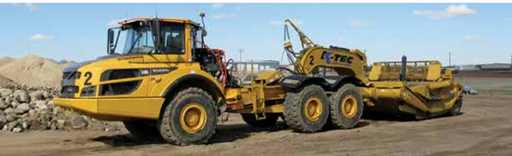
1 of 2 – 2017 Volvo A30G 6x6 Scrapper Conversion w/2015 K-Tec 1228