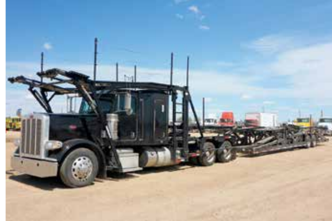
2015 Peterbilt 389 w/2016 Cottrell CX09LS3 43 Ft 6 Car