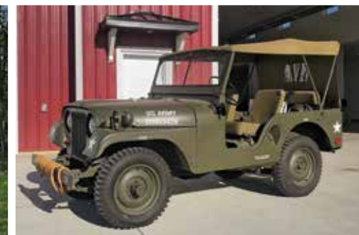
1953 Willys Jeepster Military 4x4