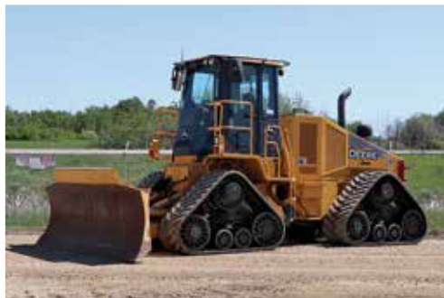
2014 John Deere 764HSD