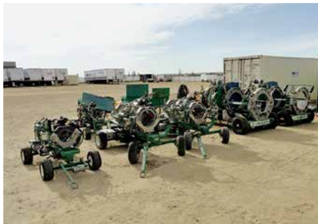
Qty of McElroy Fusion Machines