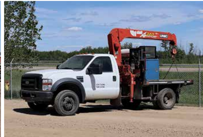
Ford F550 XL 4x4 w/Unic URA343-A2