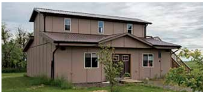
2015 Custombuilt 1728 Sq Ft Commercial Selling by photo, located North of Stettler, AB