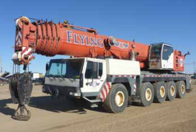
Liebherr LTM1200 10x8x6