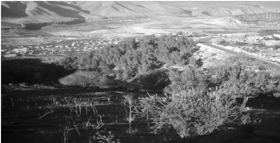
Fig. 3 Closer view of the hot spring (Al-Hemma).

The Byzantine part of the city is dominant from the octagonal church at the side of the Cardo Street which is astonishing in its style and the dark basalt stone. What does it mean by presenting the significant and distinctive parts of the city are the emphasis of their original potential values from the historic point of view.