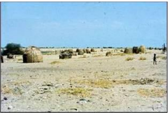
Photos 38 and 39: A Turkana Chief (left) and Turkana Village (right)