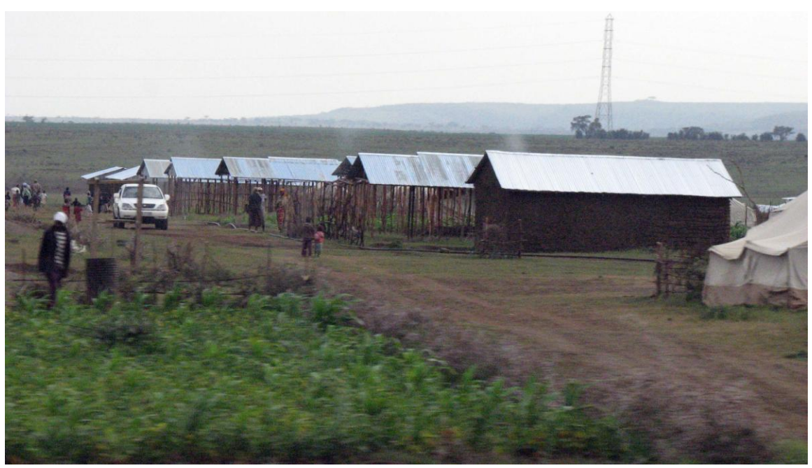
Photo 36: A more permanent displaced persons camp, Longonot

These developments led to the signing of an agreement on February 28, 2008, by Kibaki and Odinga leading to the formation of a coalition government. According to the agreement, Odinga would become Kenya's second prime Minister while Kibaki remained the president. It was agreed that the president would appoint cabinet ministers from both Party of National Unity and Orange Democratic Movement camps depending on the number of elected members a party had in parliament. The coalition government was also to have a vice-president and two deputy Prime Ministers. It was also agreed that the coalition government would remain in place until the end of the current Parliament or if either of the parties withdraws before that time (a five year period). However, with the current debates and pressure to introduce constitutional changes, Kenya is likely to see yet another shift in its political structures and governance.