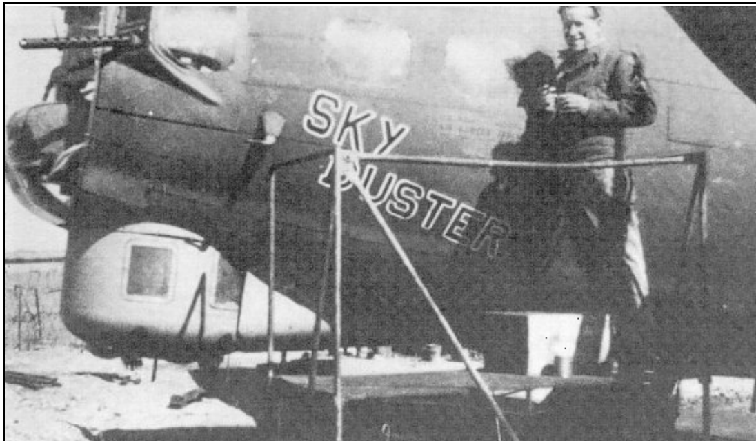
B-17G #42-31386 Sky Duster 359BS (BN-W)