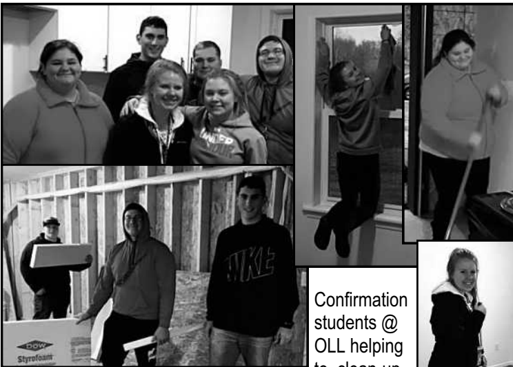
Confirmation students @ OLL helping to clean-up

Tuesday, November 13th from 12:30 pm to 6:30 pm at Our Lady of the Lakes Your donation could save a life... or three!