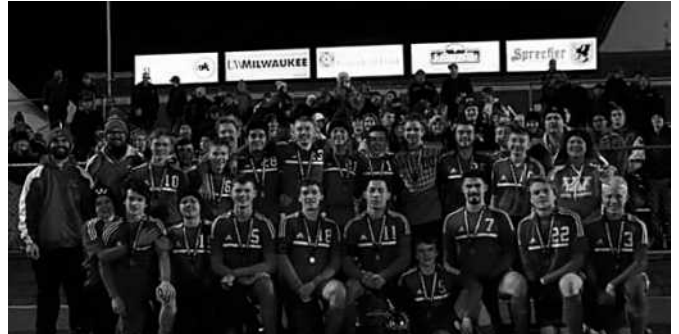
Congratulations to Amery Warriors Soccer Team on placing second at State.

a new home for Habitat for Humanity House this past last week. They are all working together to help out our community in so many ways. Thank you for being a wonderful inspiration to all of us.