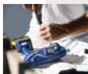
1) Remove the cover with a screwdriver