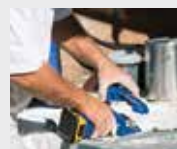
2) Remove the old pump from the sprayer