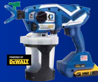
ULTRAMAX™ CORDLESS AIRLESS HANDHELD

SPRAYS WATER AND MINERAL SPIRITS-BASED MATERIALS ONLY (NO FLAMMABLE MATERIALS)