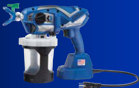
ULTRA® CORDED AIRLESS HANDHELD