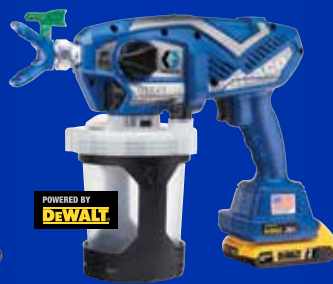
ULTRA® CORDLESS AIRLESS HANDHELD