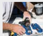
3) Place new pump into sprayer