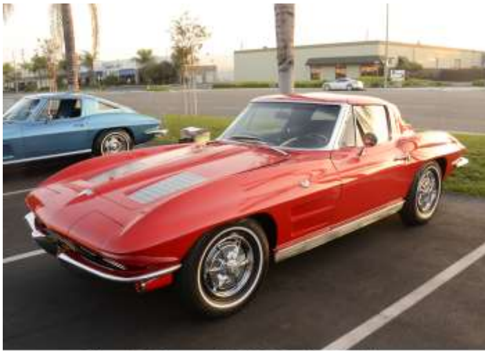
Tim Osborn, 1963 2nd Flight