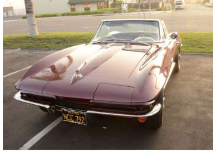
Tony Samožen, 1965 Top Flight