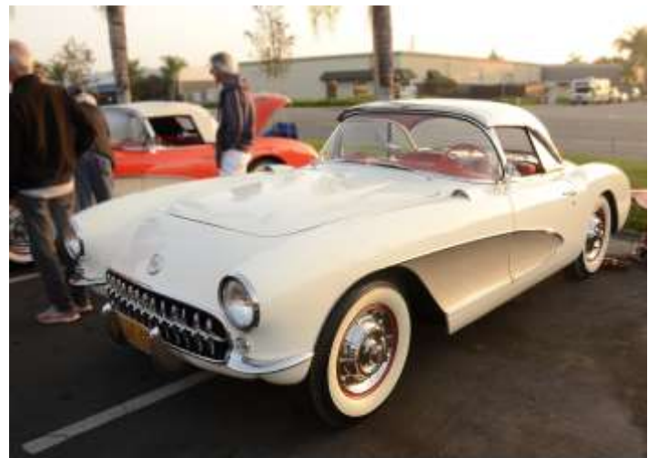
Jerry Louer, 1957 Top Flight