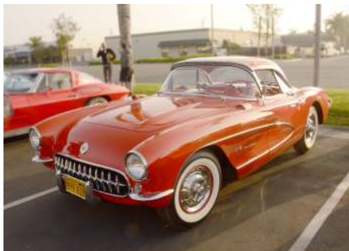
Dennis Pagliano 1957 Top Flight