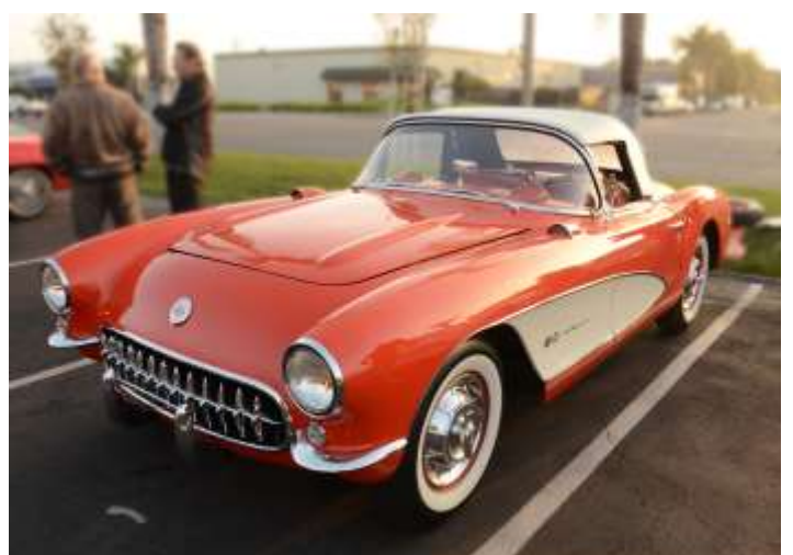
Harold Rodgers, 1957 Top Flight