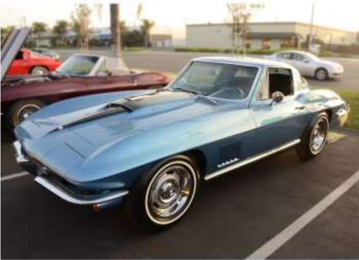
Hector Guzman, 1967 Top Flight