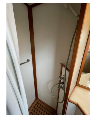
Master Head with Separate Shower Stall