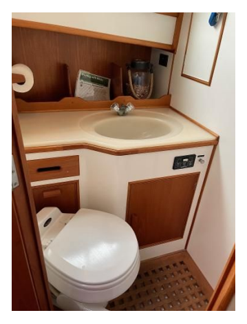
Forward V-Berth/Day Head