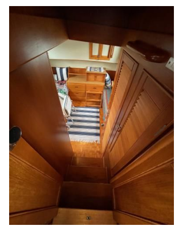
Stairwell to Aft Master Stateroom with On-Suite Head