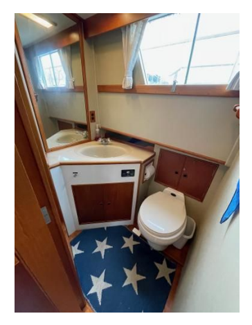
Master On-Suite Head