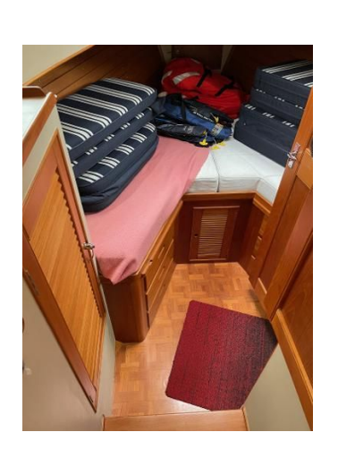
V-Berth with Fly Bridge Cushions & Life Jackets