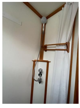
Forward Head Shower