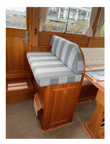
Custom Salon Helm Seat