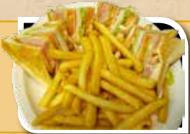
Ham & Bacon Club 11.95