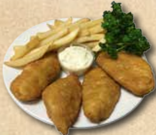
FISH N' CHIPS 4pc. cod fish, buttered bread Golden fries, tartar sauce. Hot Bread. 11.95