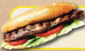
Steak Sandwich with Mayo, Lettuce & Tomatoes 12.95