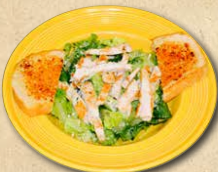
Caesar Salad Romaine Lettuce tossed with Caesar Dressing & Parmesan Cheese with Choice of Steak or Chicken Breast 10.95