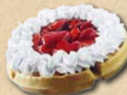
Belgium Strawberry Waffle 10.95