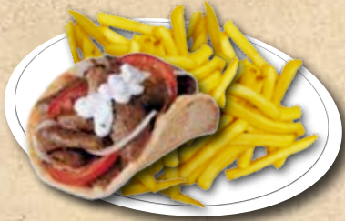
GYRO and French Fries LAMB • STEAK • CHICKEN BREAST Delicious, savory meat, served on home- style Pita Bread, topped with original recipe Grecian Dip. 11.95