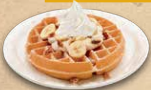
Banana & Pecan Belgium Waffle Topped with Whipped Cream 11.95

Strawberries • Blueberries • Bananas • Peaches • Pecans