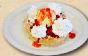
Belgium Heavenly Waffle with Vanilla Ice Cream Topped with Strawberries & Whipped Cream 11.95