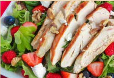
Chicken Berry Salad: Spring Mix tossed with Vinaigrette Dressing Topped with Chicken Breast, Fresh Berries, Sweet Pecans & Feta Cheese 10.95