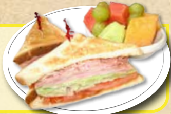
Cold Ham & Cheese Sandwich 10.45