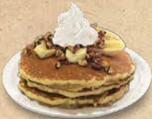
Banana & Pecan Topped with Whipped Cream 10.95