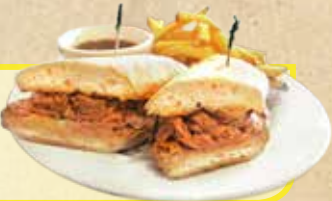
French Beef Dip with Swiss Cheese 11.95

Pastrami Mustard, Pickles & Swiss Cheese ..... 11.95 BBQ Beef or BBQ Ham ..... 11.95 Carnitas Cheese with Lettuce, Tomato & Mayo ..... 11.95