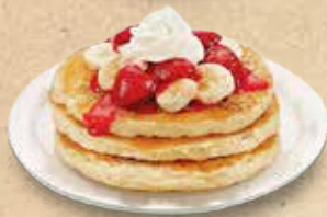
Strawberry & Banana Topped with Whipped Cream 10.95