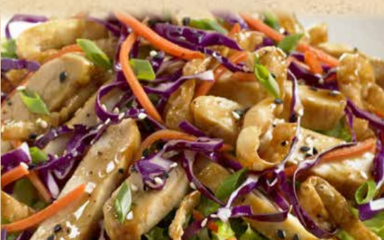
Asian Chicken Salad: Spring Mix Tossed With Sesame Seed Dressing Topped With Grilled Chicken Breast, Wonton Strips & Green Onions 10.95