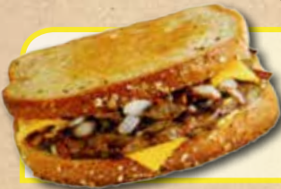
Patty Melt with Grilled Onions on Rye Bread 10.95

Grilled Cheese on White Bread ..... 8.95 Grilled Ham Cheese on Sourdough ..... 10.95 Tuna Melt on Sourdough ..... 10.95 Chicken Melt on Sourdough with Grilled Onions, Swiss Cheese & Mushrooms . 11.45 Turkey Melt with Bacon & Swiss Cheese on Sourdough Bread..... 11.45 Roast Beef Melt on Sourdough with 1,000 Island, American Cheese & Ortega Chile 11.45 Pastrami Melt with Mustard & Swiss Cheese on Sourdough Bread ..... 11.45 Corned Beef Sandwich with Swiss Cheese on Rye Bread ..... 11.45