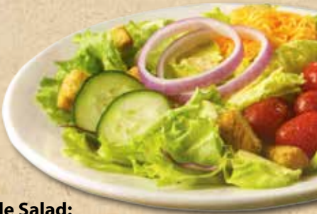
Small Side Salad: Lettuce, Tomato, Red Onions & Croutons 5.95 Add Cheese .50¢ extra