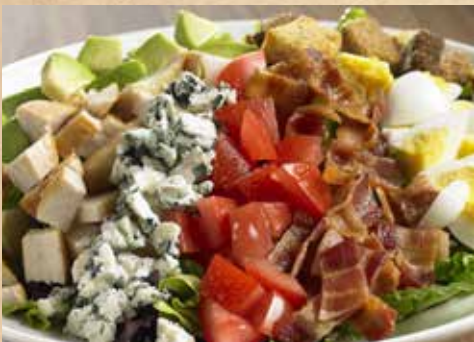
Cobb Salad w/ Chicken Breast, Avocado, Egg, Tomato, Bacon, Croutons & Bleu Cheese Crumbles 10.95