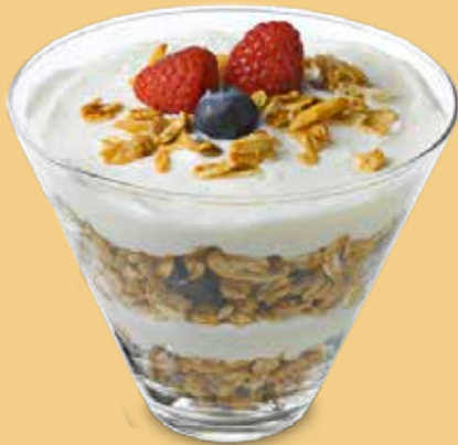
Low Fat Yogurt, Granola & Fresh Berries. 9.95