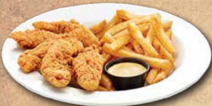
CHICKEN TENDERS (4 PCS) and French Fries Hot Bread. 11.95