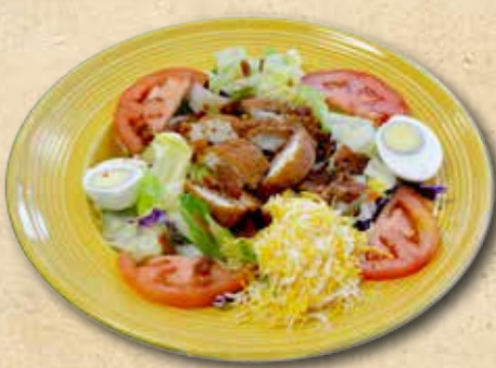
Crispy Chicken Salad: with Chicken tenders, Tomatoes, Hard Boiled Egg, Bacon & Cheese 10.95