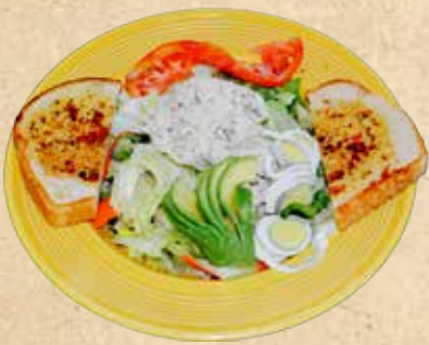
Tuna Salad w/ Avocado & Boiled Egg 10.95