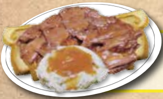
HOT ROAST BEEF SANDWICH: Open Face Served with Mashed Potatoes & Gravy 11.95