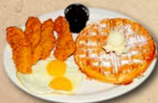
Belgium Waffle & Chicken 1/2 Fried Chicken or 4 pc Chicken Tenders & Two Eggs (NO CHOICE FROM BOX) 14.95