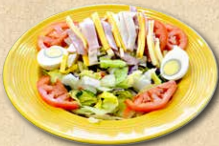
Chef Salad Turkey, Ham, Tomato, Hard Boiled Egg & Cheese 10.95