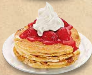
Cream Cheese & Strawberry Topped with Whipped Cream 10.95