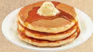
Stack Of Pancakes (3) 8.95