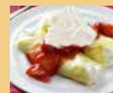
Strawberry & Cream Two Crepes With Sweet Cream Cheese Topped With Glazed Strawberries & Whipped Cream 9.95