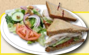
Cold Turkey Sandwich 10.45

Cold Tuna ..... 10.45 BLT with Avocado ..... 11.45