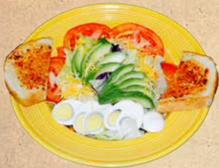
Avocado Salad w/ Boiled Egg 9.95

Ranch, Bleu Cheese, Thousand Island, Oil & Vinegar, Italian, Honey Mustard, Caesar (Additional Charge for Extra Dressing)