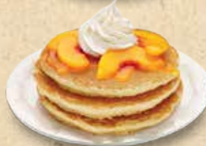
Peach Pancakes Topped with Whipped Cream 9.95