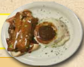
HOT MEAT LOAF SANDWICH: Open Face Served with Mashed Potatoes & Gravy 11.95

All items below served with one choice: French Fries • Potato Salad • Soup • Salad • Fresh Fruit • Cottage Cheese Substitute Onion Rings or Zucchini $1.00 Extra.