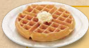
Belgium Waffle ..... 9.95