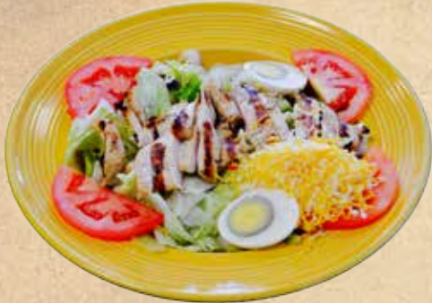
Grilled Chicken Salad Grilled Chicken, Tomatoes, Hard Boiled Egg, Red Onions & Jack Cheese 10.95