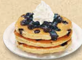
Blueberry Pancakes Topped with Whipped Cream 9.95