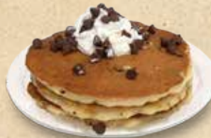
Chocolate Chip Pancakes Topped with Whipped Cream 9.95