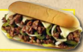
Cheese Steak Beef, Onions, Bell Peppers, Ortega Chile, American & Swiss Cheese 12.95