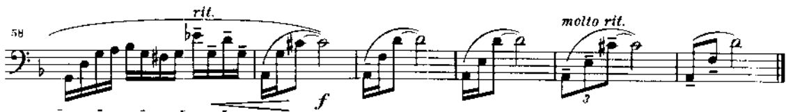
Fig. 9--Suite No. 2: Prelude, measures 58-63

including: Figure 9, ascending broken chords; Figure 10, a variation on the chords reflecting the pattern that occurs in the previous two measures; and Figure 11, the original three-note chords played in a sixteenth note broken chord pattern simulating crossing strings on the 'cello.