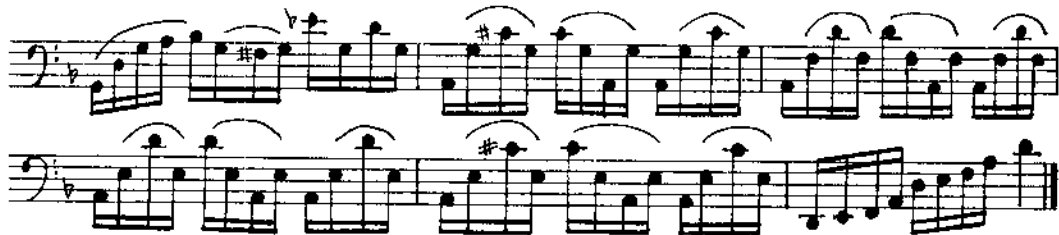
Fig. 11--Suite No. 2: Prelude, measures 58-63