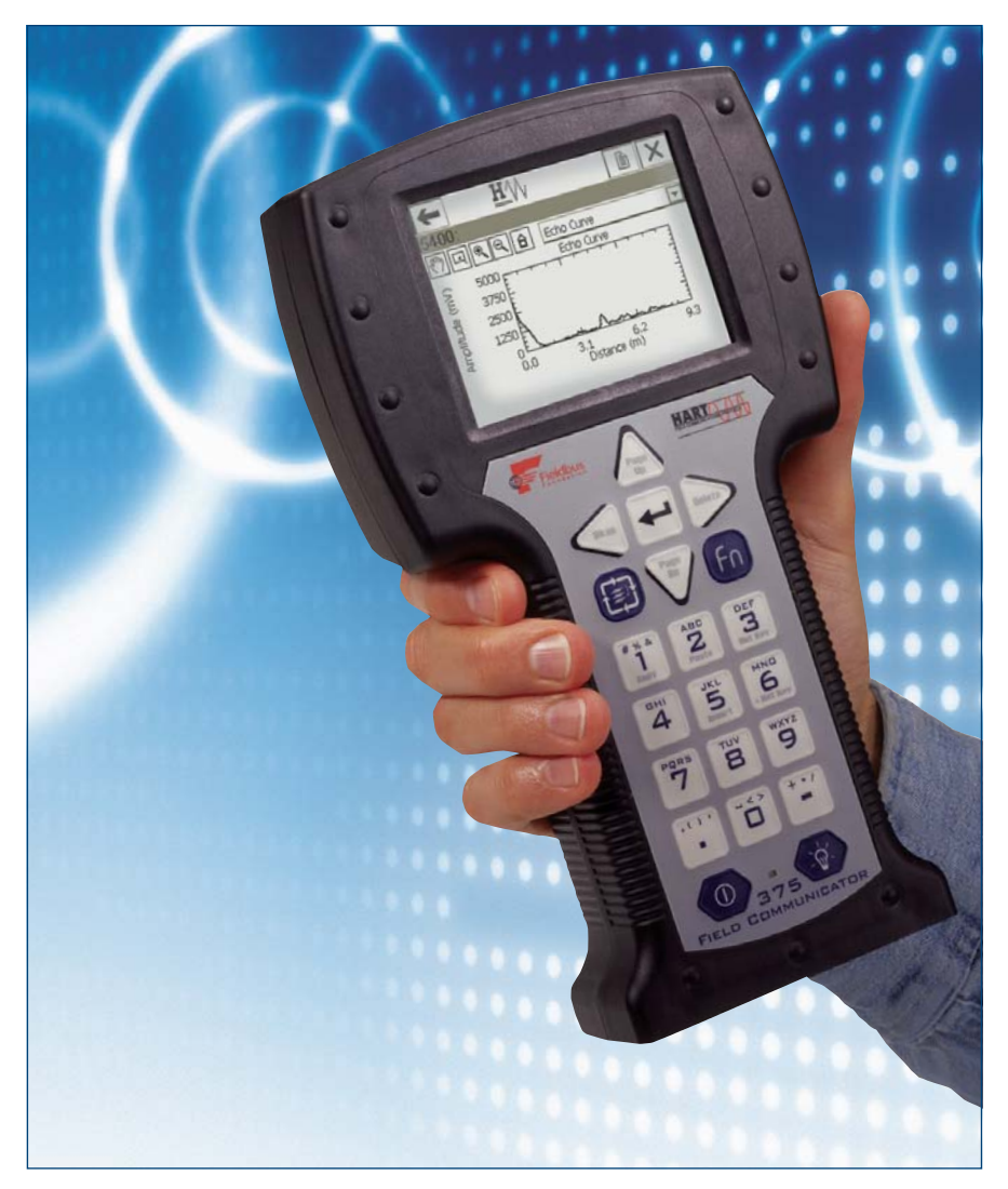
The 375 Field Communicator is designed to support all HART and all FOUNDATION fieldbus devices from all vendors.