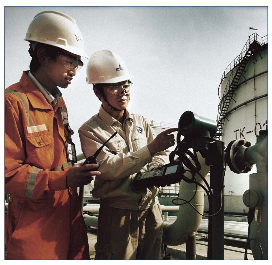
Designed not only for use on the bench, the 375 Field Communicator also enables you to do those tasks that just have to be done in the field.