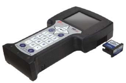
The Configuration Expansion Module safely stores hundreds of device configurations.

Together, the 375 Field Communicator and AMS Device Manager enable you to efficiently manage all of your devices, the assets that are the foundation of your process.