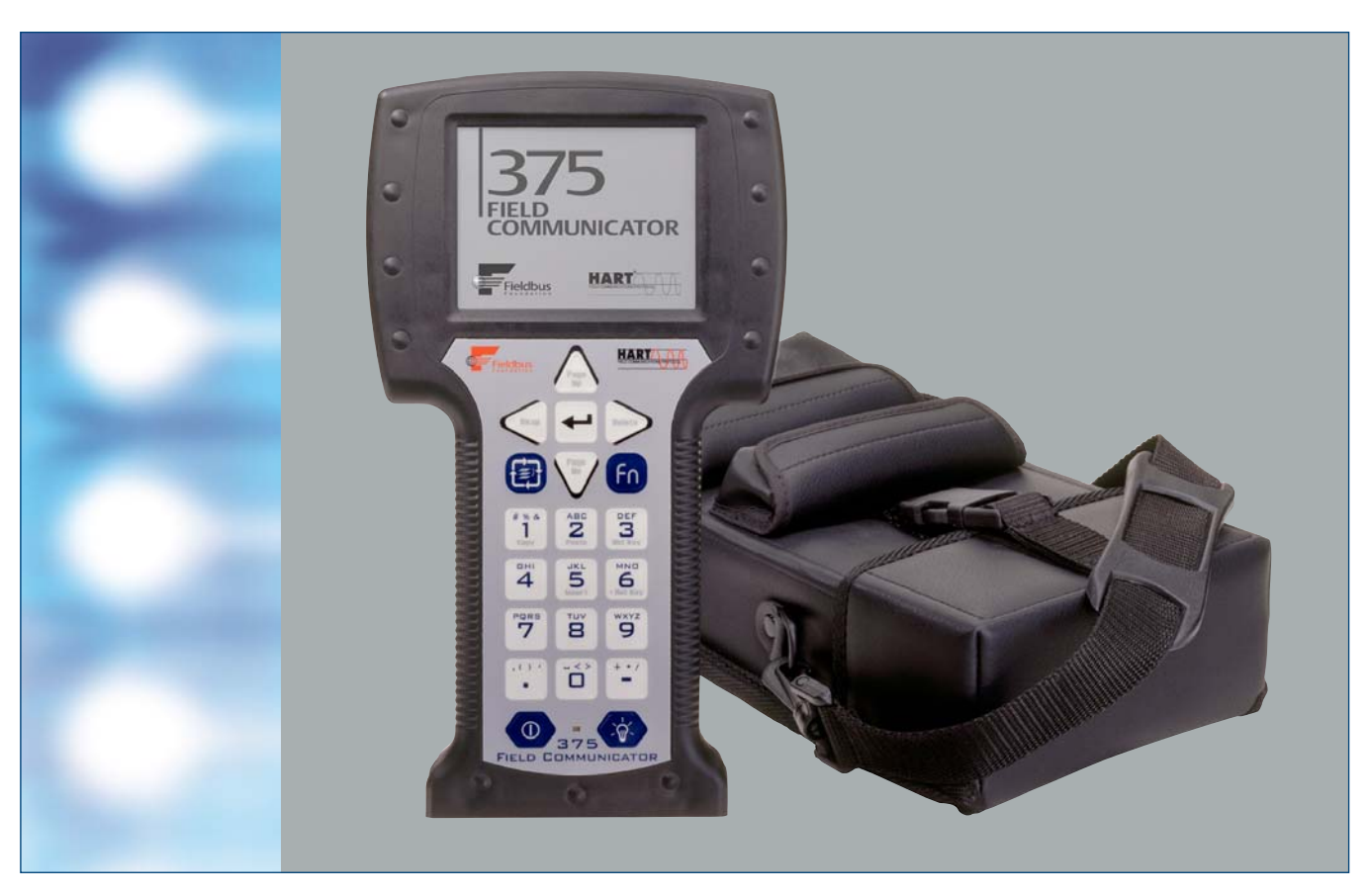
The 375 Field Communicator, with its handy carrying case, provides a single tool for configuring and diagnosing HART and FOUNDATION fieldbus devices.