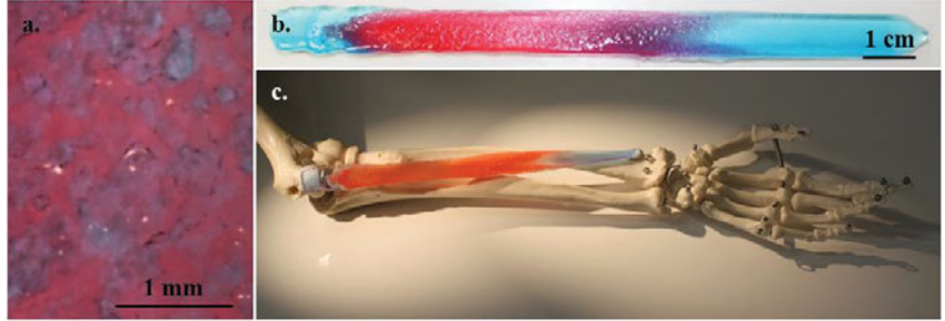
Figure 2 (a.) Macroscope image of a 3D printed particulate reinforced Alg/PAAm ICE gel composite ribbon with an Emax volume fraction of 40 %. (b.) Photograph of an artificial tendon printed with Alg/PAAm ICE gel and Emax gradient structures. (c.) Photograph of a 3D printed artificial tendon attached to a skeleton.

A novel extrusion based deposition system was used to print particulate reinforced hydrogels. The deposition system was designed with two digitally controlled syringe pumps that pushed the ink from two syringe barrels though a Y-adaptor into a single stream which flowed through a static mixer. The mixer ensured blending of the two inks before they were pushed out the extrusion nozzle. The Alg/PAAm ICE gel and Emax inks are immiscible and phase separate when mixed together and so UV light was attached to the 3D printer so that the blended inks could be cured as soon as they were extruded to limit the phase separation. Figure 2a. is a macrosope image that shows the two phase structure of one these printed materials. Changing the extrusion rates of the two syringe pumps allowed for composites to be printed with various volume fractions of Emax. Mechanical characterisation showed that composites with low volume fractions of Emax (<50 %) behave like particulate reinforced composites. Custom software allowed for the extrusion rates of the two pumps to be ramped during the printing process to create gradients of material composition across the extruded ribbon. Figure 2b. is a photograph of an artificial tendon containing two composition gradients that form a transition of modulus from one end to the other. [6] Figure 2c. is a picture of the artificial tendon attached to a skeleton.