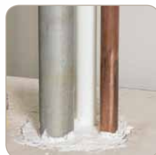
Firestops service penetrations passing through fire-rated floor or wall assemblies.*