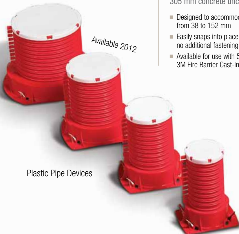
Plastic Pipe Devices