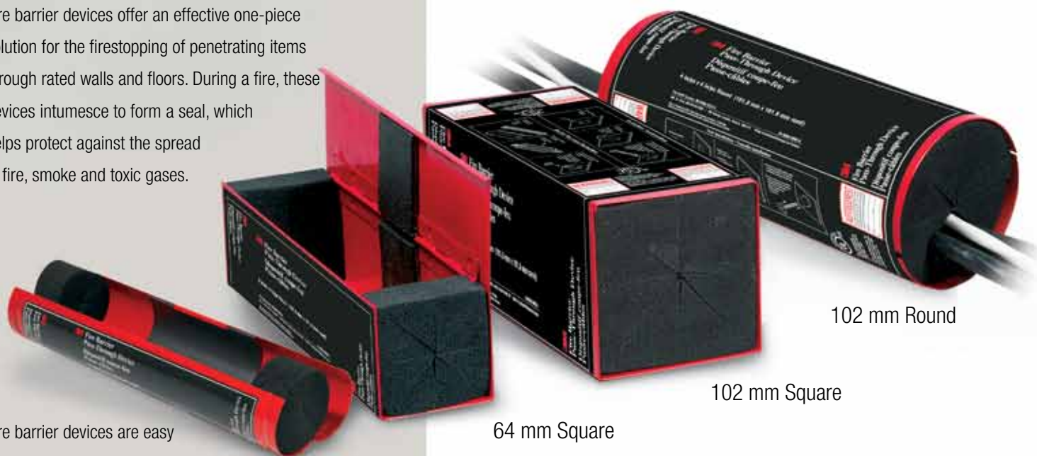
51 mm Round

3M offers pass-through options for walls and floors, as well as, cast-in place options for poured concrete floors. 3M Fire Barrier Devices offer a simple, and in a majority of cases caulk-free, code compliant alternative to complicated caulk systems. Plus, some have the added benefit of retrofit firestop capabilities, which means fewer hassles after buildings are occupied.