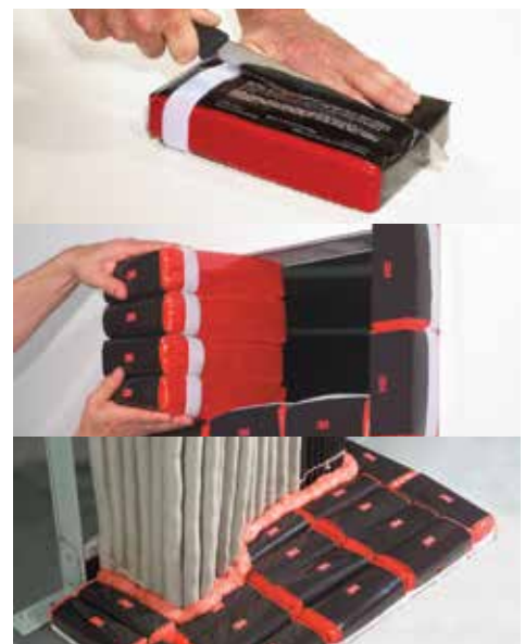
Multiple pillow sizes and ability to field-cut allow for a secure fit in most openings (seal cut edges with polypropylene box sealing tape).