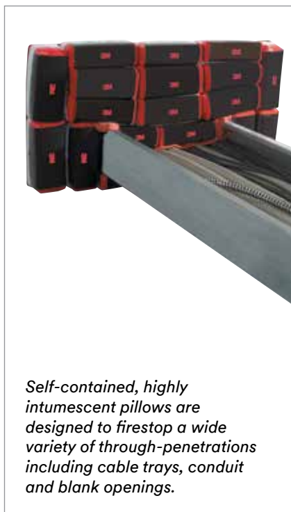
Self-contained, highly intumescent pillows are designed to firestop a wide variety of through-penetrations including cable trays, conduit and blank openings.