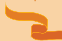
Red Ribbon (for hat and scarf)