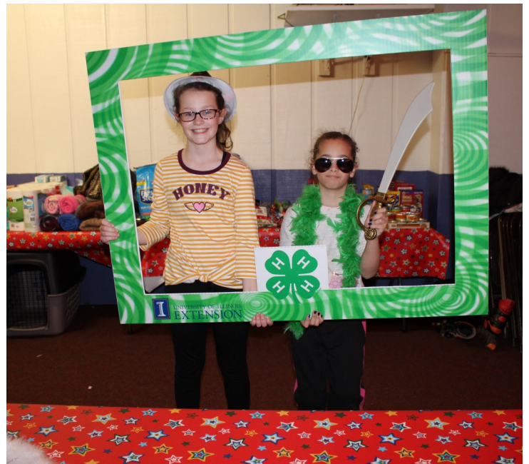
4-H members having fun at the skating party