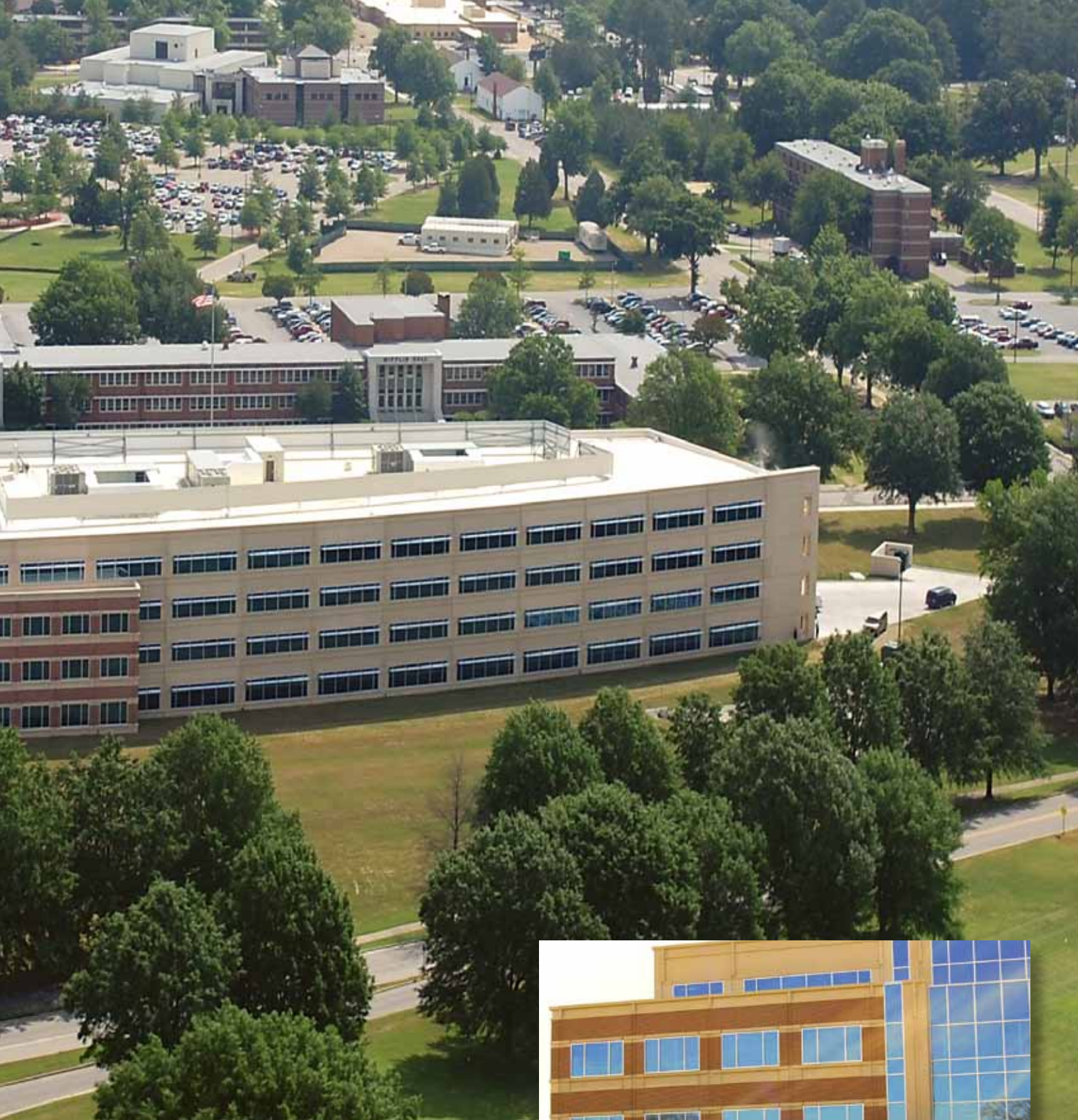
A 218,579-square-foot facility was built to house the Sustainment Center of Excellence headquarters (above, building in center foreground; at right, the headquarters entrance). The facility is located adjacent to the Quartermaster and Women's Army Museums. The new Ordnance Museum is planned for construction in the same vicinity.