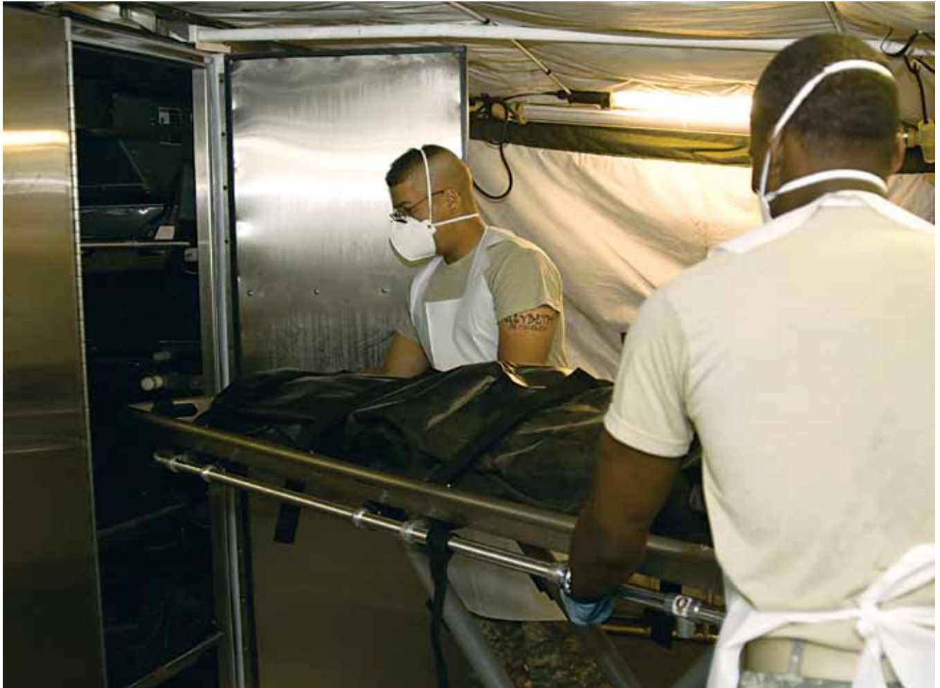
Soldiers place remains in a mobile integrated remains collection system. The Army Quartermaster Center and School is now the host to the Joint Mortuary Affairs Center.

Army, Marine Corps, Navy, and Air Force food service personnel in culinary skills, both basic and advanced. Construction is underway to increase the size of Fort Lee's culinary training facilities to accommodate all of the offices and training laboratories required for this consolidation.