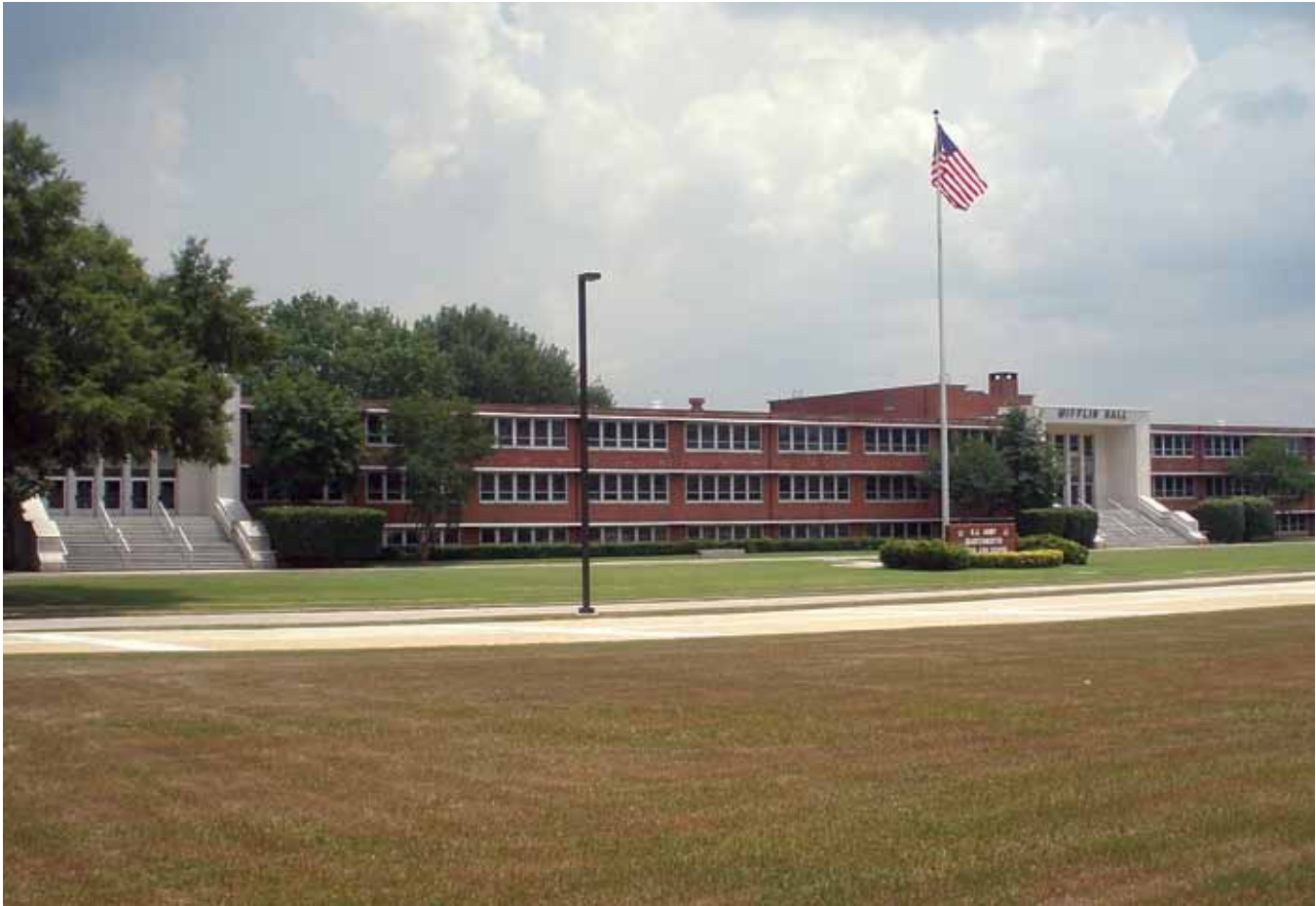
Mifflin Hall served as the headquarters for the Quartermaster School commandant from 1961 to 2009. Named for the first Quartermaster General, Major General Thomas Mifflin (1744–1800), it is located adjacent to the new Sustainment Center of Excellence headquarters building. The future of Mifflin Hall is under review.

will also be tasked with achieving effective outcome-based training that replicates likely challenging battlefield conditions. His final charge will be streamlining the throughput of students within the training base while establishing and maintaining standards.