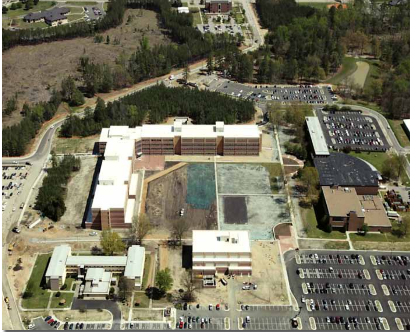
The Army Logistics University (ALU) campus contains the new ALU facility (center), the Simulation Training Center (center foreground), and the existing Army Logistics Management College building (right). The 350,000-square-foot ALU building houses the Logistics Leader College, the Logistics Noncommissioned Officer Academy, and the Army Logistics Library. A 1,000-room hotel is projected for construction in 2012.

Numerous other projects are currently under construction. These include a new shoppette and an expanded gas station that will double the number of gas pumps available, increase the number of car care bays, and have a Popeye's chicken restaurant. Fort Lee also has plans for additional expansion in 2013, including new swimming pools, two new gyms (one on the new Ordnance school campus and one on the ALU campus), two chapels, and a two-company fire station. Renovations of the two existing gyms and the Kenner Army Health Clinic are also planned.