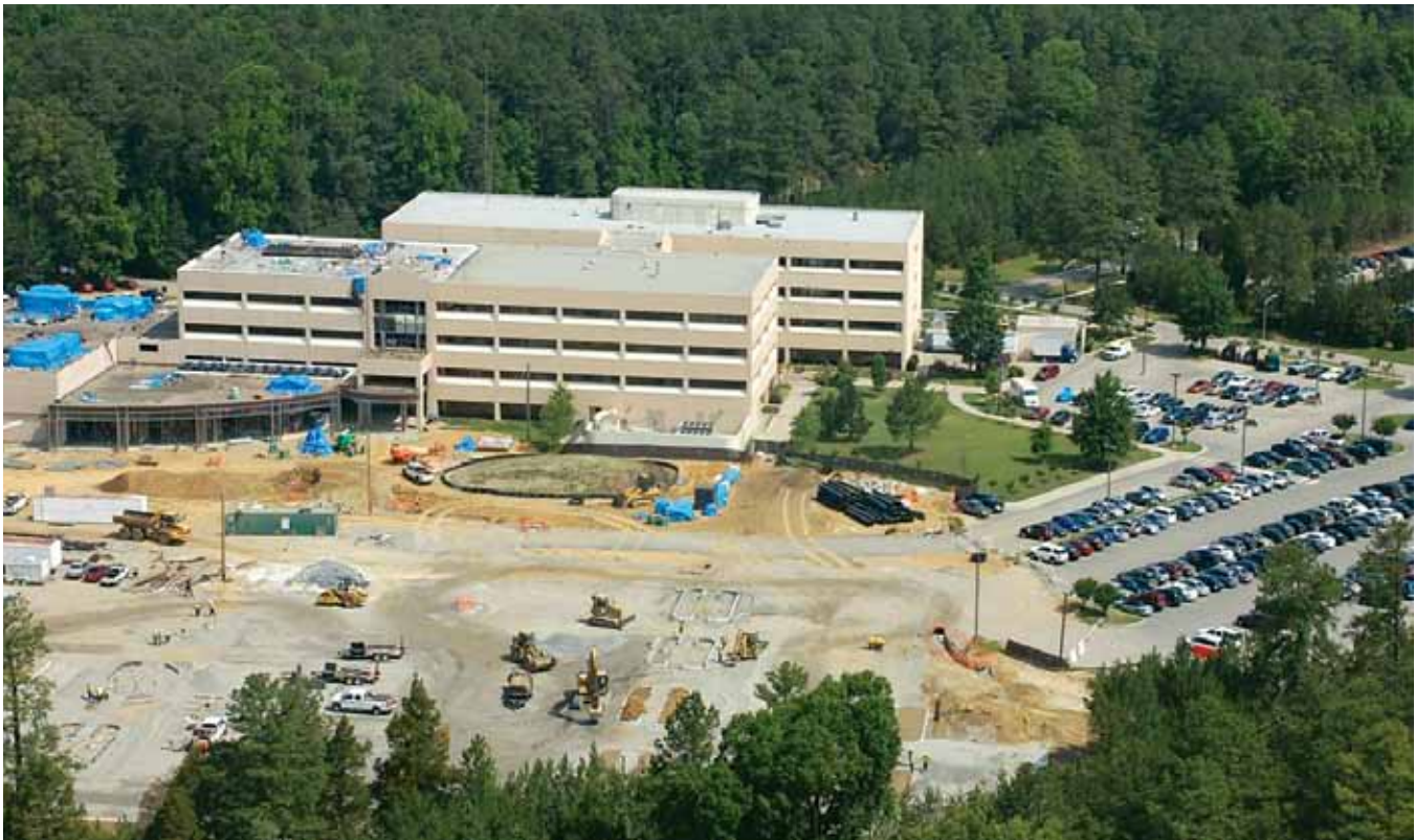
A new addition to the Defense Commissary Agency headquarters at Fort Lee provides 75,800 square feet that includes office space, a cafeteria, multipurpose rooms, and a warehouse. The addition will help accommodate over 200 employees who will move to Fort Lee from San Antonio, Texas, and Virginia Beach and Hopewell, Virginia.

and Navy BRAC-related moves, is in the early stages of construction near the new Soldier Support Center.