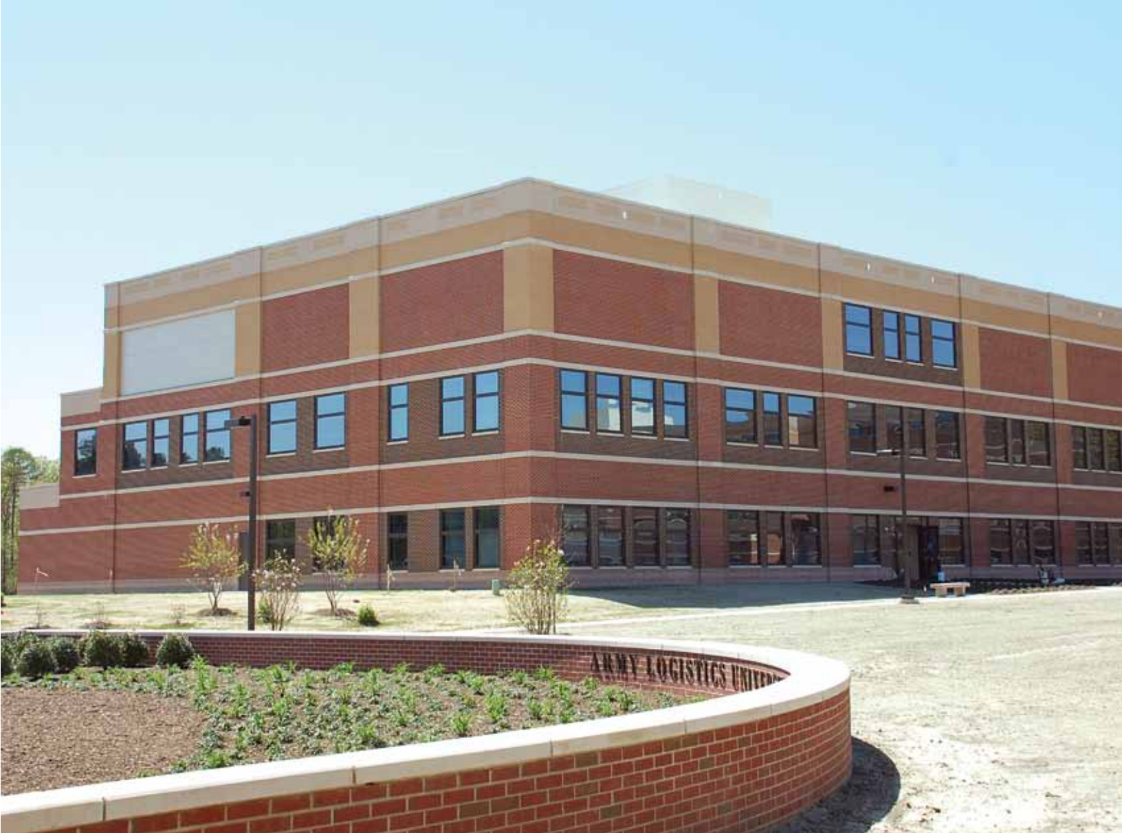
The Simulation Training Center at Fort Lee, Virginia, is located on the new Army Logistics University campus.

focuses on applying critical planning and analysis processes to improve the students' ability to successfully plan and execute sustainment distribution operations.