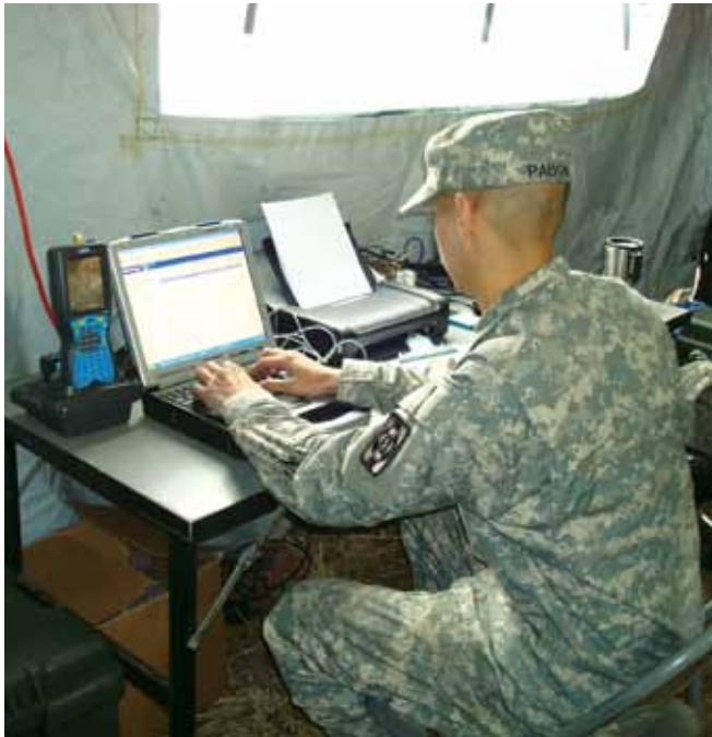
Above: A Soldier from the 240th Quartermaster Battalion, 49th Quartermaster Group, uses the Tactical Fuels Manager Defense system to account for fuel used by units during Southbound Trooper 2009. Below: Soldiers also use the tactical automated tank gauge to measure the amount of fuel inside collapsible fabric tanks.

Sustainment units inactivating include the 186th Quartermaster Company, 600th Quartermaster Company, 612th Quartermaster Company, and 44th Medical Command at Fort Bragg; the 196th Quartermaster Detachment and 106th Transportation, Headquarters and Headquarters Detachment at Fort Campbell, Kentucky; and the 557th Maintenance Company at Fort Irwin.