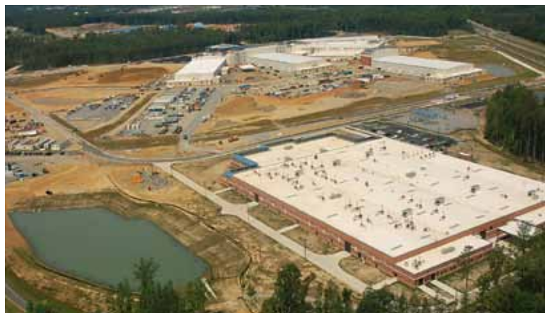
The 16th Ordnance Battalion has begun training at the Tactical Support Equipment Directorate’s new building, lower right, at the Ordnance School campus at Fort Lee, Virginia.

The departments that train the 16th Ordnance Battalion Soldiers, the Tactical Support Equipment Department and the Weapons Metal Service Department, are not moving concurrently. This prompted the battalion to establish split-based operations at Aberdeen Proving Ground and Fort Lee, which will continue for approxi-