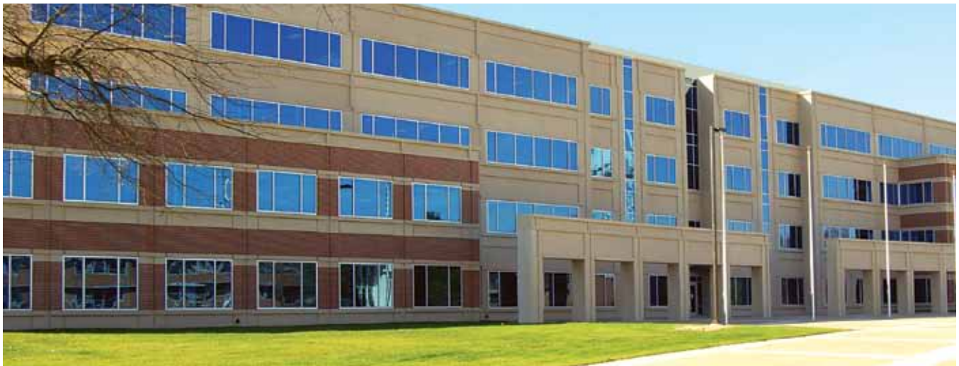
The new Sustainment Center of Excellence headquarters building was dedicated in January 2009.