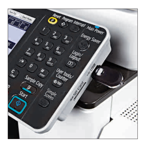
Insert a USB/SD card and print documents directly from the Savin MP 4002/MP 5002 for incredible convenience at any time.