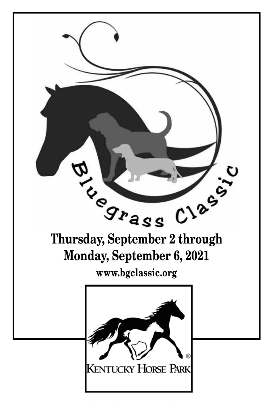
4089 Iron Works Pkwy., Lexington, KY 40511