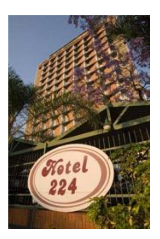
Protea Hotel Hatfield (about 5 km from the conference venue) Rates between R1220 (€81) (single) and R1420 (€95) (double)