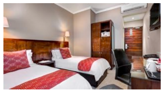
Courtyard Hotel, Hatfield (about 5 km from the conference venue) Rates between R1950 (€130) (single) and R2130 (€142) (double)