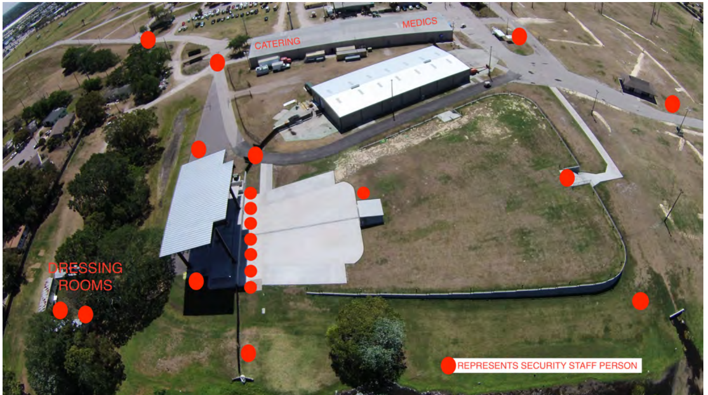
STANDARD SHOW SECURITY LOCATION TEMPLATE

Barricade In-House: Stage Sonco- 120 Feet