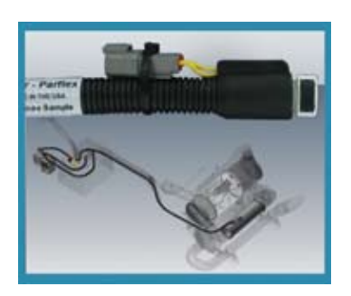
Consistent Thaw, Multiple Customization Options

SCR Electrically Heated Assemblies - Designed for heat and conveying DEF (Diesel Exhaust Fluid) throughout the SCR system. Available in Suction/ Throttle Line or PA Pressure Line designs. Both hoses create consistent thaw and are more reliable than traditional coolant heated hoses. Unlike the competition's electrically heated hose, Parflex SCR hose locks-in the electral heating wires, provides better protection to the entire hose and with the heated fittings, provides uniform heating through-out the assembly. 600 psi. Size 6mm. -40°F up to 248°F depending on style. Multiple customization options available. For details, view BUL. 4660-SCR.