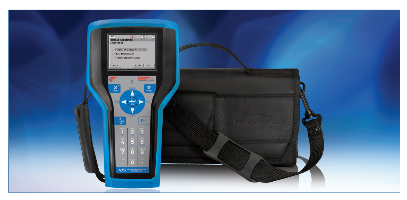
The 475 Field Communicator, with its handy carrying case, provides a single tool for configuring and diagnosing HART and FOUNDATION Fieldbus devices.