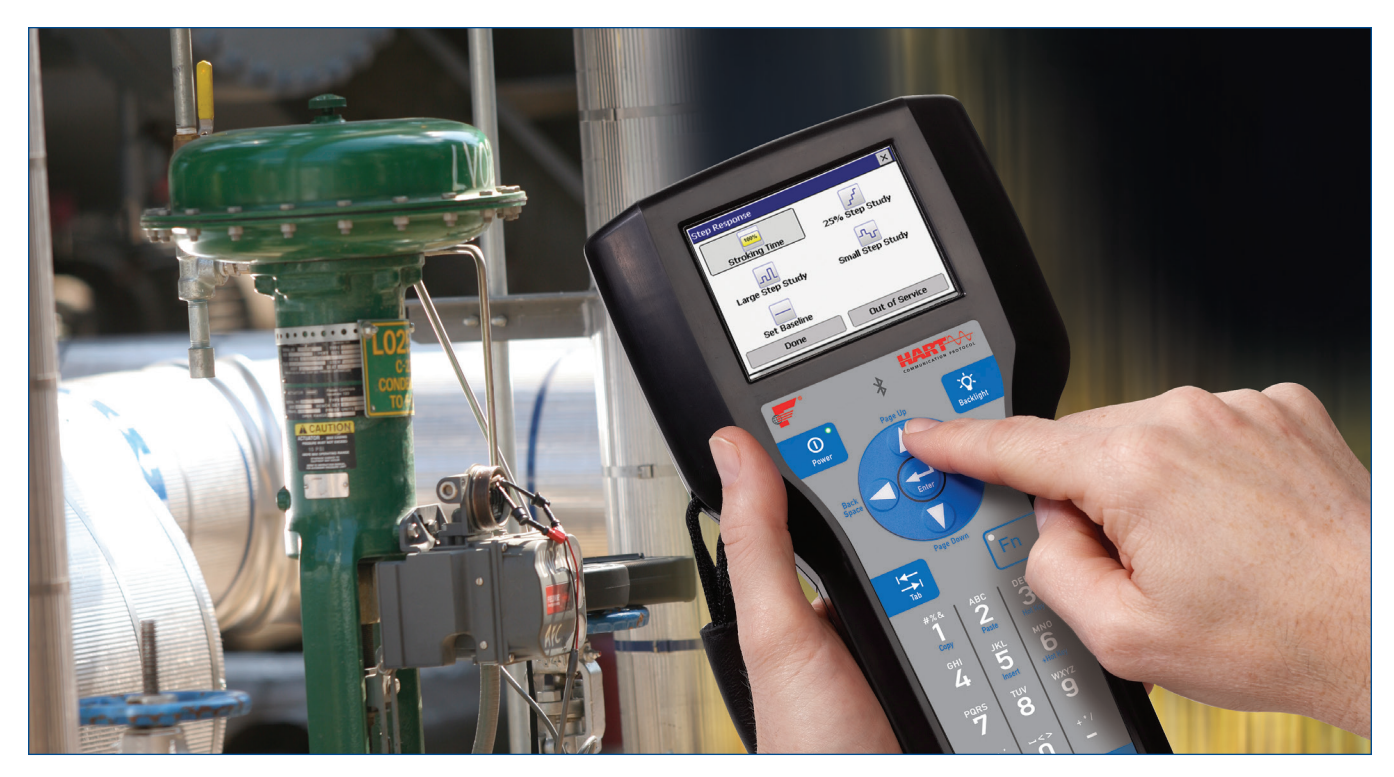
Gain advanced diagnostics in the field through ValveLink Mobile and enhanced graphics.

The touch screen display and large physical navigation buttons provide for efficient use both on the bench and in the field. The icon-based user interface allows you to navigate quickly and efficiently.