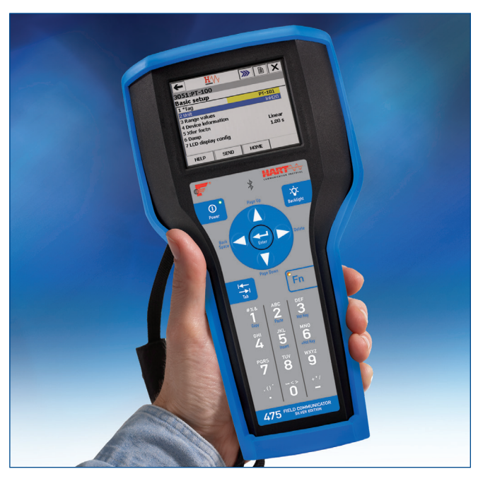
The 475 Field Communicator is designed to support all HART and FOUNDATION Fieldbus devices from all vendors.