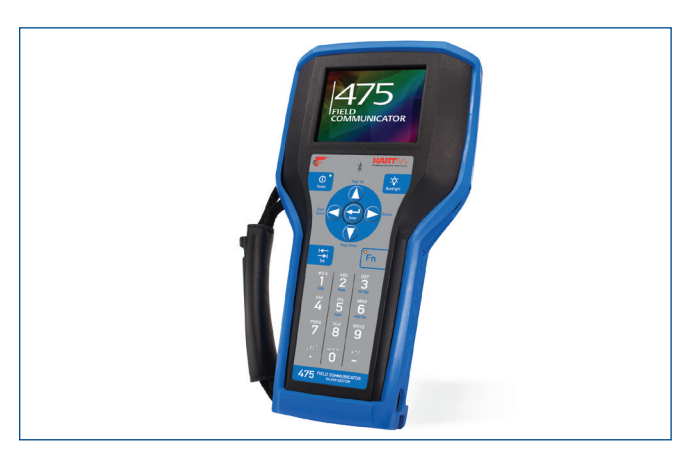
The protective rubber boot provides added protection in the field.

The 475 Field Communicator's Protective Rubber Boot provides added protection in the field and in your toolbox. Both the rubber boot and 475 housing are designed in accordance with Intrinsic Safety standards to limit the build up of static electrical energy.