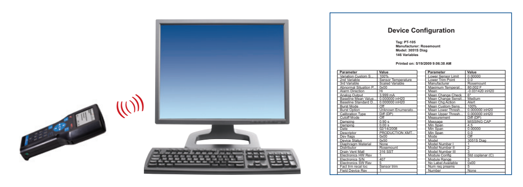
Easily store and print device configurations for analysis and documentation requirements.

Through Easy Upgrade , you always have access to the latest HART and fieldbus drivers. With the 475 Field Communicator, you are guaranteed universal HART and FOUNDATION fieldbus support in a single, intrinsically safe handheld communicator.