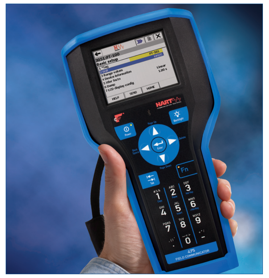
The 475 Field Communicator is designed to support all HART and FOUNDATION fieldbus devices from all vendors.