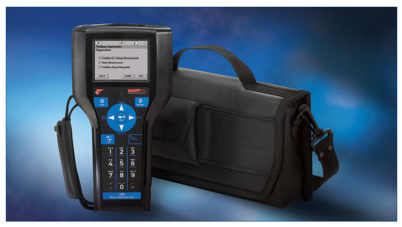
The 475 Field Communicator, with its handy carrying case, provides a single tool for configuring and diagnosing HART and FOUNDATION fieldbus devices.