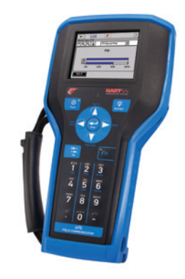
The protective rubber boot provides added protection in the field.

The 475 Field Communicator is designed, manufactured, and tested to very demanding specifications. It is ready to go wherever you need to go to get the job done.