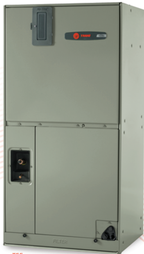
TEE ComfortLink™ II Communicating

Regardless of the climate or season, a Trane air handler provides consistent, reliable performance. Additionally, through an ongoing commitment to innovation with features like ComfortLink™ II communicating capability, we bring you even more ways to further refine and elevate your comfort.