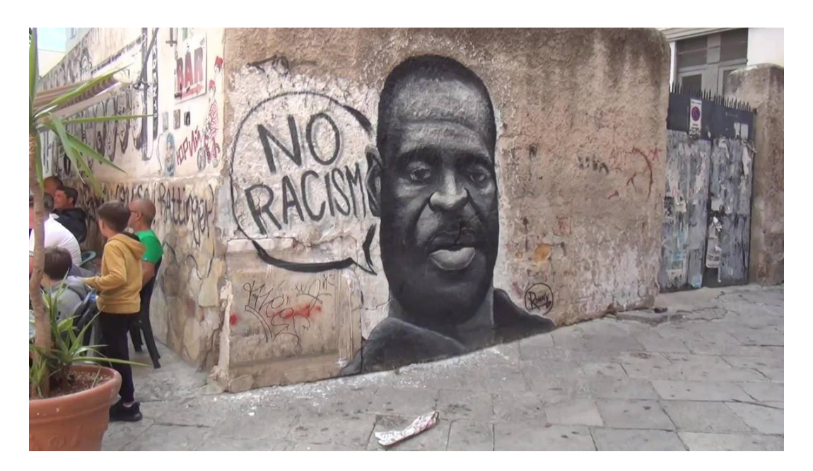
George Floyd mural near Chicago and Lake Street in South Minneapolis (June 2020)

George Floyd mural painted by artists in the Ballero neighbourhood of Palermo, Sicily (June 2020)