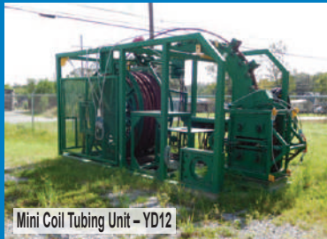
Mini Coil Tubing Unit - YD12