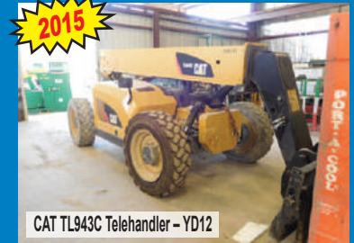
2015 CAT TL943C Telehandler - YD12