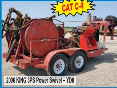
2006 KING 3PS Power Swivel - YD8