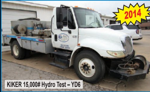
KIKER 15,000# Hydro Test – YD6