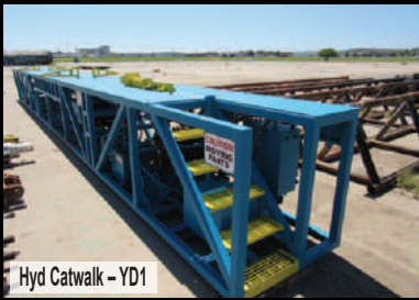
Hyd Catwalk - YD1