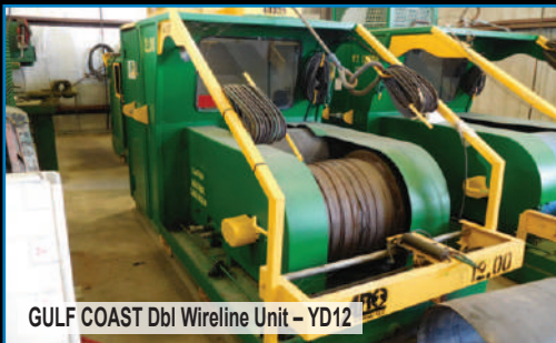
GULF COAST Dbl Wireline Unit – YD12