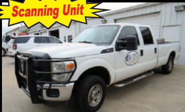
2013 FORD F-250 4WD - YD6