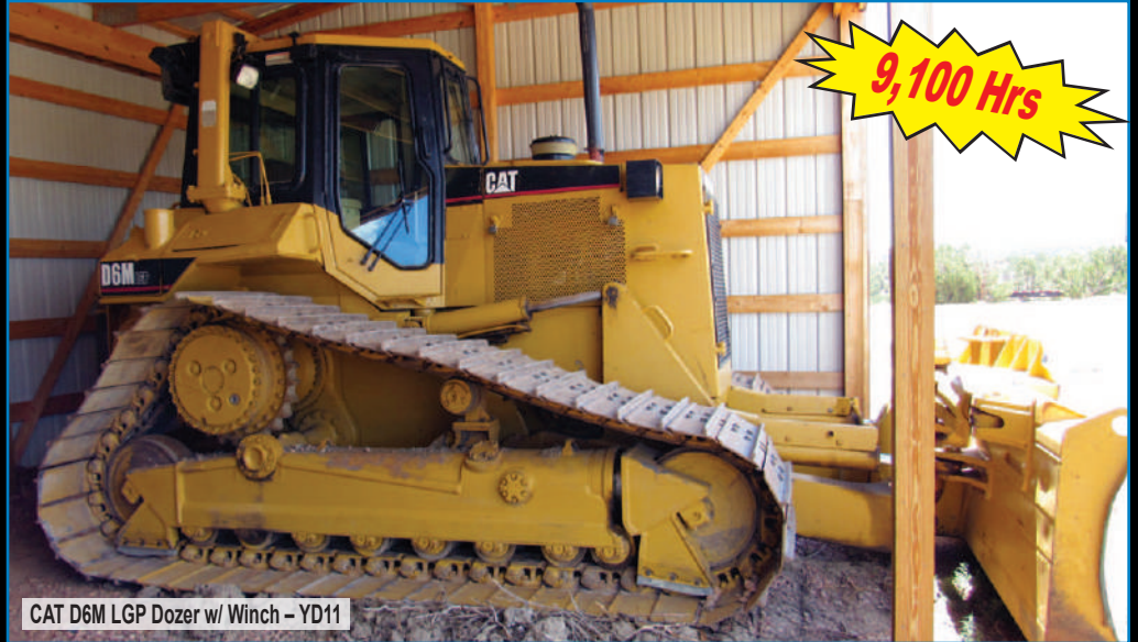
CAT D6M LGP Dozer w/ Winch – YD11