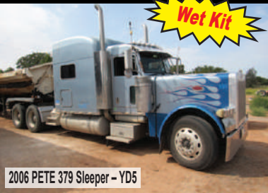
2006 PETE 379 Sleeper - YD5

VOLVO EC-210CL Crawler Shear (7277 Hours) w/ LABOUNTY