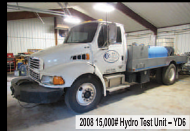
2008 15,000# Hydro Test Unit - YD6