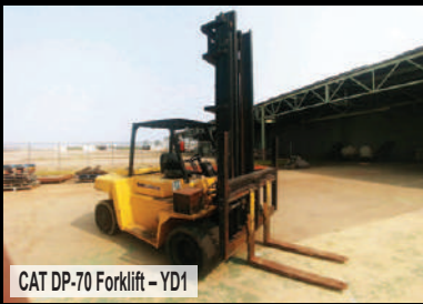
CAT DP-70 Forklift - YD1