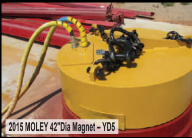
2015 MOLEY 42" Dia Magnet - YD5