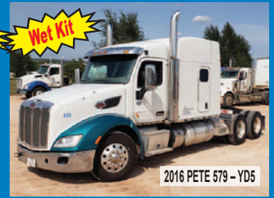
2016 PETE 579 - YD5