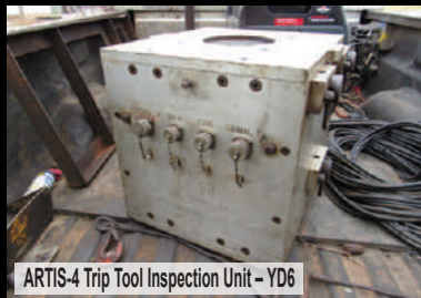
ARTIS-4 Trip Tool Inspection Unit - YD6