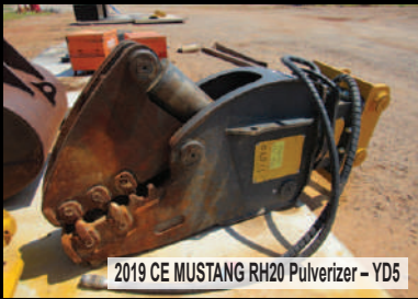
2019 CE MUSTANG RH20 Pulverizer - YD5