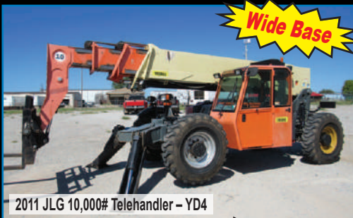
2011 JLG 10,000# Telehandler – YD4