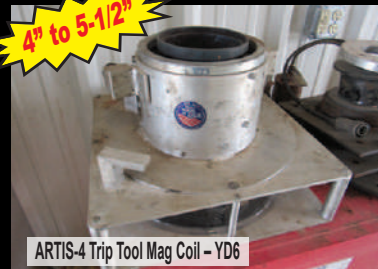
ARTIS-4 Trip Tool Mag Coil - YD6