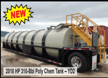
2018 HP 310-Bbl Poly Chem Tank - YD2