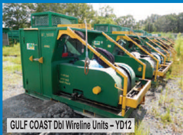
GULF COAST Dbl Wireline Units - YD12

UNIT #5: DEMAY HD-500 Triplex Pump, VOLVO 1642VE Diesel Power Pack, GULF COAST D/D Wireline UNIT w/ Operator's Cabin, ISUZU 173HP Diesel Wireline Power Pack, 133-Bbl Open-Top