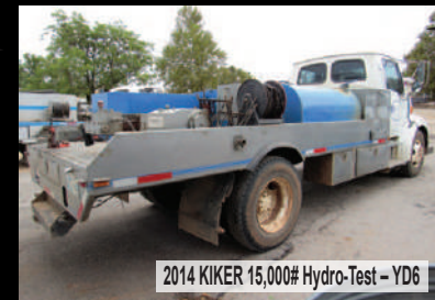
2014 KIKER 15,000# Hydro-Test - YD6