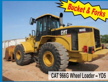
CAT 966G Wheel Loader - YD5