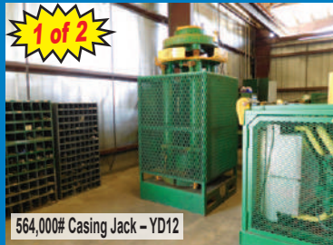
564,000# Casing Jack - YD12