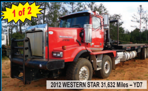
2012 WESTERN STAR 31,632 Miles – YD7