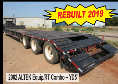
2002 ALTEK Equip/RT Combo - YD5