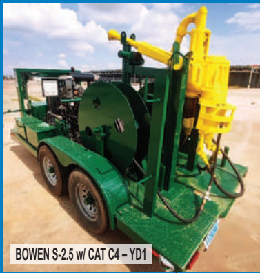
BOWEN S-2.5 w/ CAT C4 - YD1