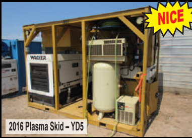
2016 Plasma Skid - YD5