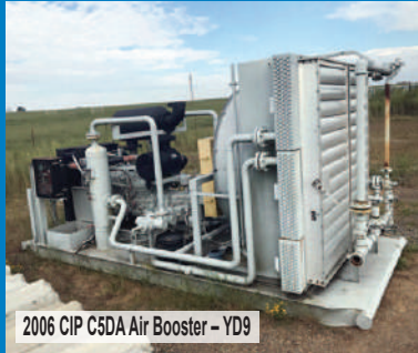
2006 CIP C5DA Air Booster - YD9