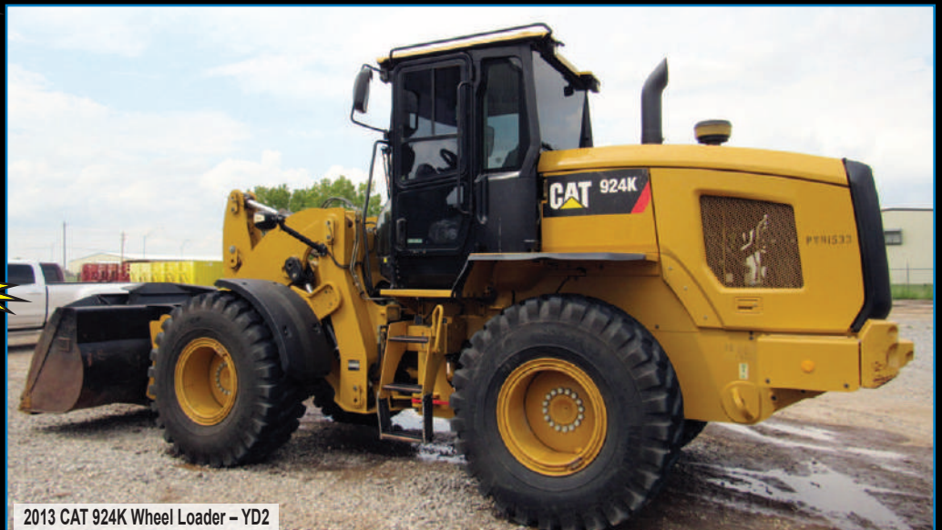
2013 CAT 924K Wheel Loader – YD2

TRUCKS & TRAILERS • CONSTRUCTION & SHOP EQUIPMENT • DEMOLITION, RECLAMATION & ENVIRONMENTAL EQUIPMENT • COMPLETE HYDROSTATIC TUBING TESTING & SCANNING COMPANY • WELL SERVICE PUMPS & SWIVELS • DRILLING COMPRESSORS COMPLETE P&A PACKAGES • CASING JACKS • MINI COIL TUBING UNIT Includes Complete Liquidation of R&L Hydrostatic Testing