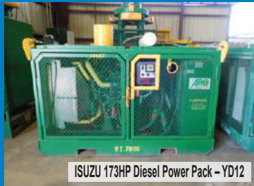
ISUZU 173HP Diesel Power Pack - YD12