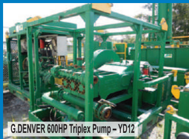
G.DENVER 600HP Triplex Pump - YD12