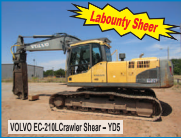
VOLVO EC-210L Crawler Shear - YD5