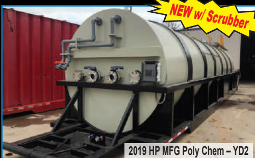
2019 HP MFG Poly Chem – YD2