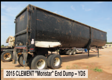
2015 CLEMENT "Monstar" End Dump - YD5