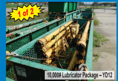
10,000# Lubricator Package - YD12