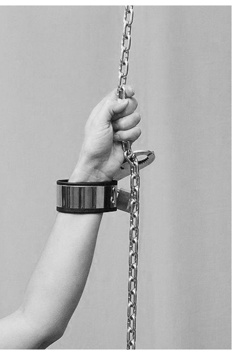
www.bakerdonelson.com © 2013 Baker, Donelson, Bearman, Caldwell & Berkowitz, PC