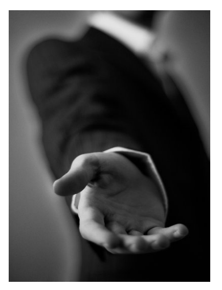
www.bakerdonelson.com © 2013 Baker, Donelson, Bearman, Caldwell & Berkowitz, PC