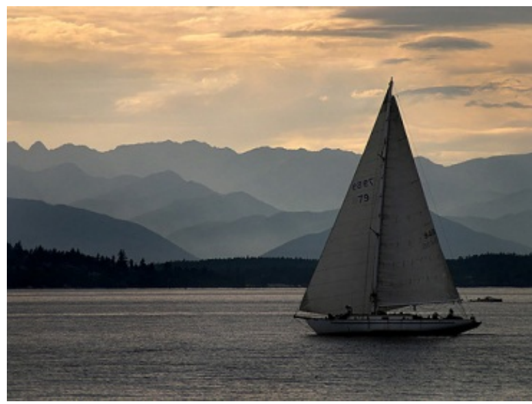
www.bakerdonelson.com © 2013 Baker, Donelson, Bearman, Caldwell & Berkowitz, PC