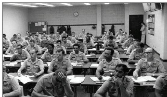
First Army PA Class 1973

In 1976, a group of former Army PAs, stationed at Fort Hood, Texas, started a civilian organization to represent Army PAs. The first recorded meeting for the Society of Army Physician Assistants (SAPA) was held on 24 September, 1976. In 1980, the first SAPA Annual PA Refresher Conference was held in Fayetteville, NC. To this day, the annual conference continues to be held in Fayetteville. The SAPA has an average active membership of around 600.<sup>7</sup>