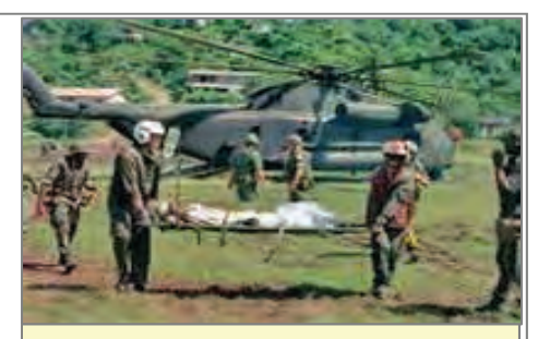
Medical Evacuation Operation Urgent Fury

In 1984, a study found that PAs provided care to 79% of patients seen by primary care physicians at half the cost. The Defense Audit Task Force on Non-Physician Health Care Providers recommended to Congress that all military PAs be commissioned Officers.<sup>2</sup> SAPA became critical in lobbying for this commissioning.<sup>7</sup>