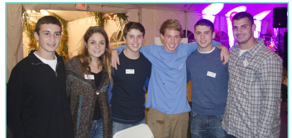
Our volunteers helped us sell close to $40,000 in raffle tickets for the Super 50/50!