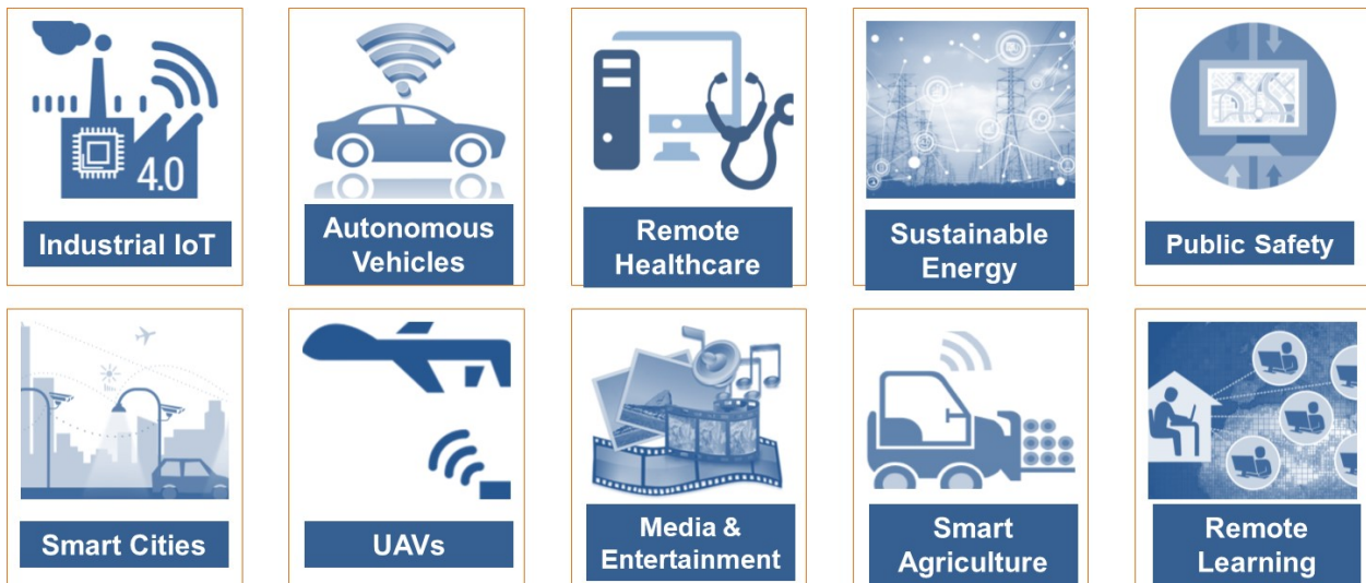
Figure 6.1 Emerging Market Domains Addressed by Future 3GPP Releases

Key areas for consideration will include the target market domains noted in figure 6.1 covering key verticals such as industrial automation, transportation, health care and energy, as well as media/entertainment, public safety and smart cities.