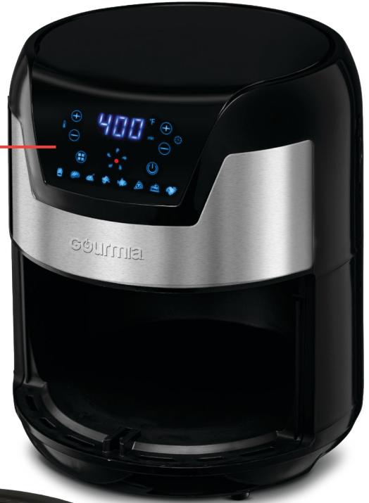
Display / Control Panel