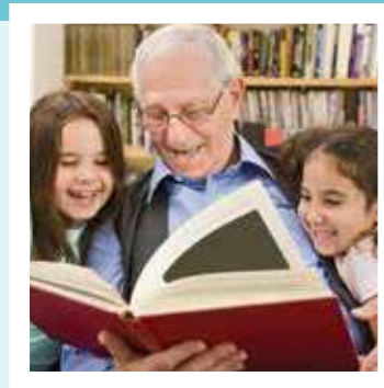
Helping Seniors & Loved Ones Stay At Home

At PiOT, we see the individual within every recovery situation. We understand the whole journey through rehabilitation, both emotional and medical, and we are devoted to guiding you to real improvement. Our commitment to our clients and quality of service means that we always have your best interests at heart.