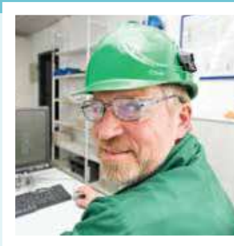
Workplace Assessments & Return to Work Programs