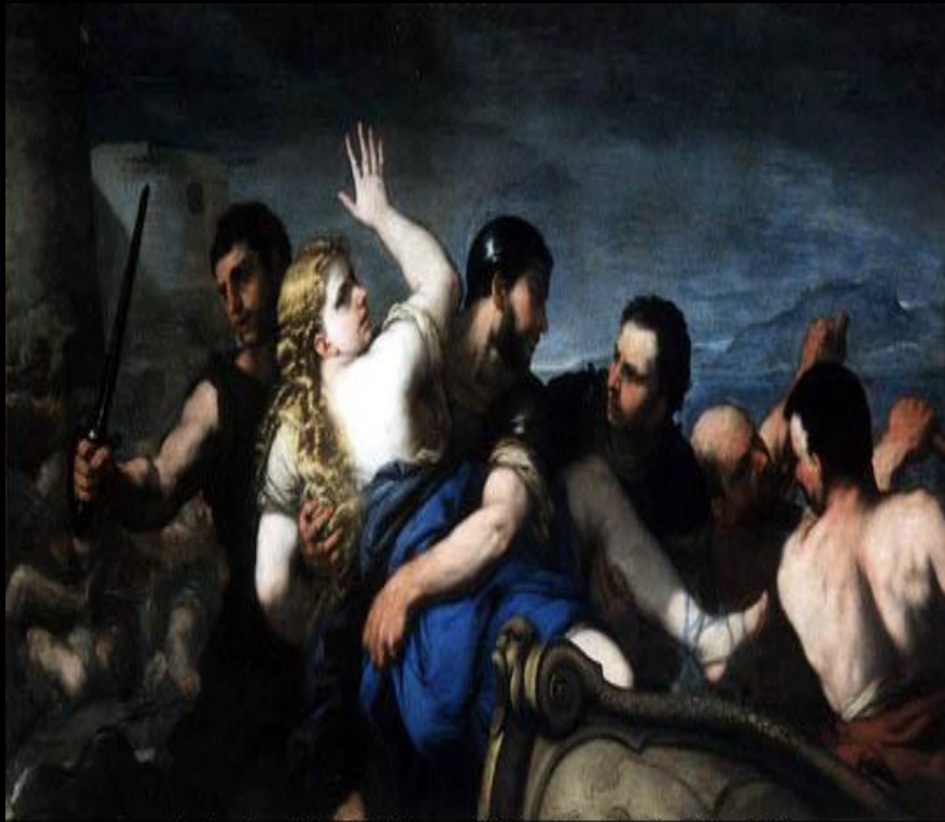
Giordano Luca 1634-1705: Enlèvement d'Hélène.