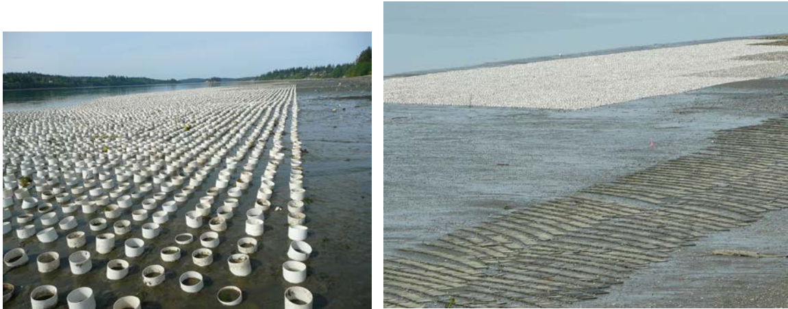
Figure 1 Left: Geoduck PVC tubes stuck into tidebed in Totten Inlet, WA. Right: Aerial shot of PVC tubes and oyster bags in WA.

be found as far away as Hawaii) and by breaking down into microplastics, with grave impacts to wildlife, aesthetics, and food safety.