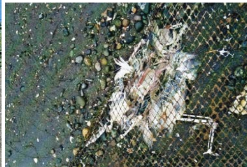
Figure 2: Left: A juvenile bald eagle is caught in an aquaculture net on Harstine Island, WA. Right: Remains of bird caught beneath anti-predator net

This plastic gear also breaks down into microplastics, and act as an additional source of plastic contamination in the ocean. 37 Microplastics absorb toxic pollutants already present in the water, and are being ingested by the very bivalves being cultivated. 38 These microplastics act like a poison pill to aquatic life that consume them, and have been shown to reduce oyster's