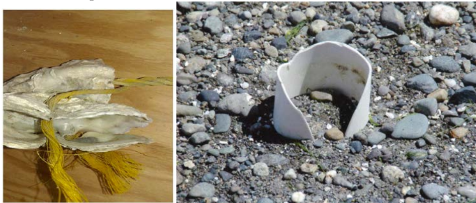
Figure 3 Left: Yellow rope used in long-line culture growing through oyster shell. Right: PVC tube degrading

reproductive ability. 39 The research on microplastics and their impacts to human health is ongoing and revealing some disturbing effects. 40