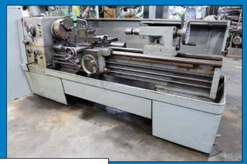
CNC and Toolroom Machinery, Swiss Lathes, Engine Lathes, Hardinge Lathes, Grinders