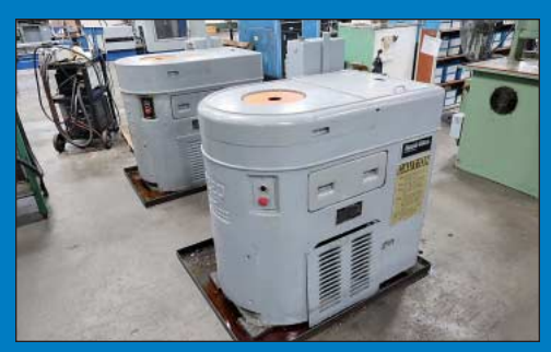
(2) Reed Model A22 3-Die Cylindrical Thread Rollers