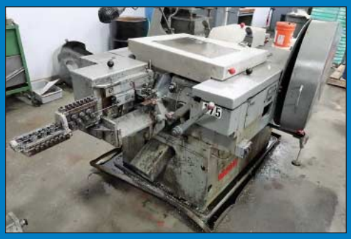
Wafios Model N5 High Speed Nail Machine