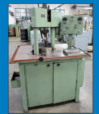
PC Engineering 3-Roll Fillet Roll