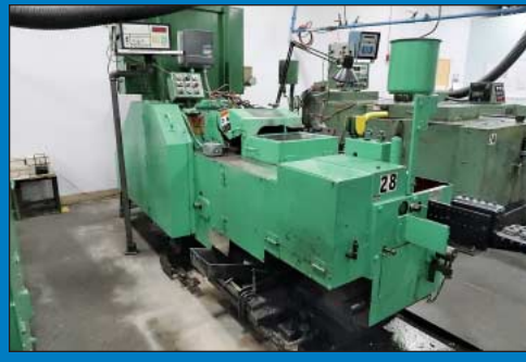
National Model 45 Long Stroke DSSD Cold Header