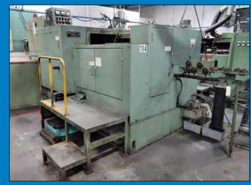
Nakashimada Model TH4-8A 4-Die Cold Header