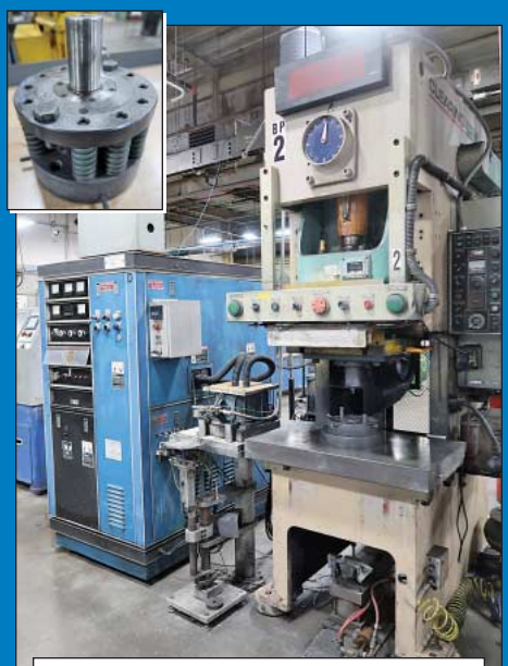
88-Ton & 66-Ton Seyi Clearing Presses Converted to Forge 12-Point Aircraft Engine Bolts

Asahi Okuma Model AOT-6XL High Speed Long Stroke 2-Die 2-Blow Cold Header; s/n 1-102 (1982) 1/4" Cutoff Dimeter, 3" Shank Length, 3-3/4" Cutoff