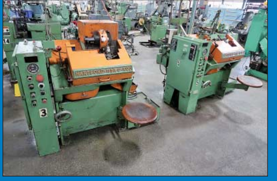
(2) Hartford Model 000-1000 High Speed Flat Die Thread Rollers