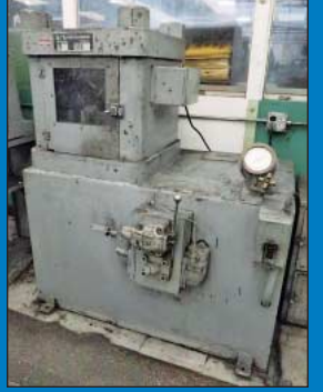
200 Ton Modern Model 1A200 Hydraulic Hobbing Press