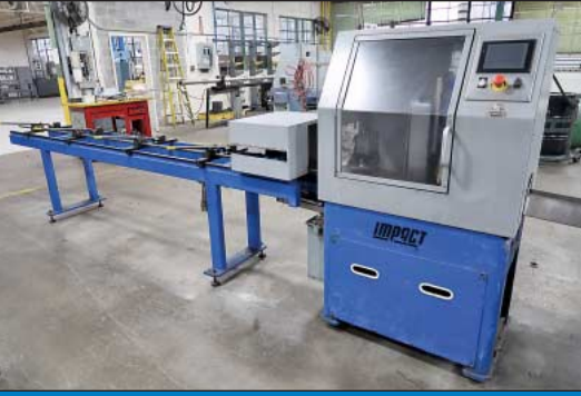
Soling PHF Model ASM-04 Abrasive Cutoff