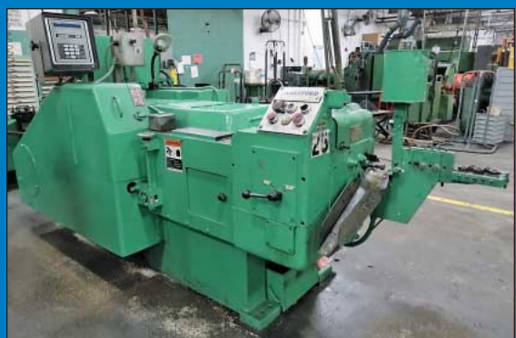
Hartford Model 3-500 High Speed Single Stroke Solid Die Long Stroke Cold Header