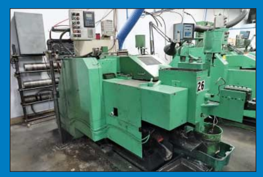
National Model 45 Long Stroke Single Die Tubular Rivet Header