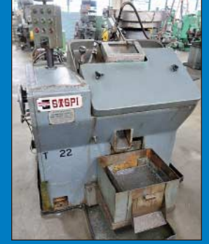
Saspi Model MPA-100 High Speed Shave Pointer