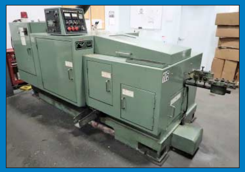
Nakashimada Model NP-60 2-Die 3-Blow Cold Header