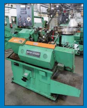
(2) Warren Model WT-1500 High Speed Flat Die Thread Rollers