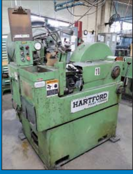
Hartford 5-700 and 6-600 Pinch Pointers