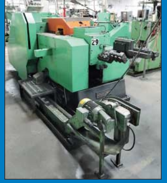
Asahi Okuma Model ORH-80 2-Die 3-Blow Cold Header