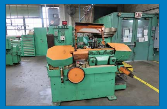
Harford Model 20-225 High Speed Flat Die Thread Roller