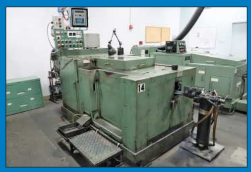
Asahi Okuma Model AOT-6XL High Speed Long Stroke 2-Die 2-Blow Cold Header