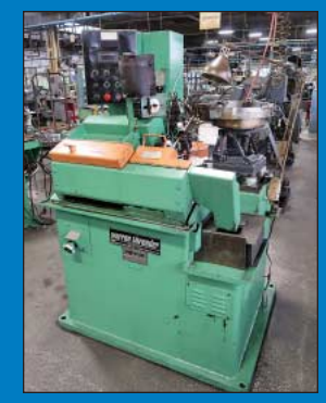
Warren Model WT-500 High Speed Flat Die Thread Roller