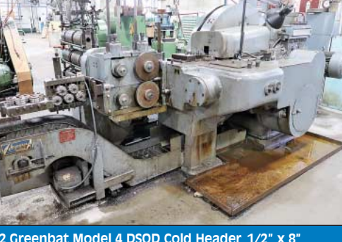
#52 Greenbat Model 4 DSOD Cold Header, 1/2" x 8" Capacity