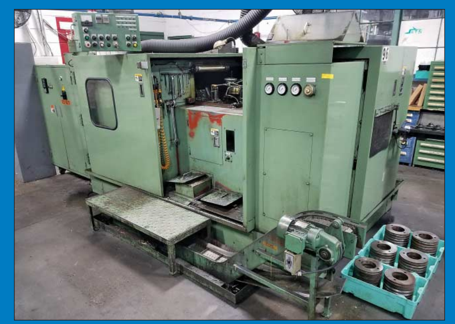
Asahi Sunac Model RH-80 2-Die 3-Blow Cold Header