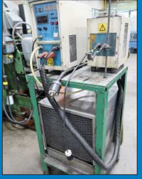
Portable and Stationary Induction Heat Systems