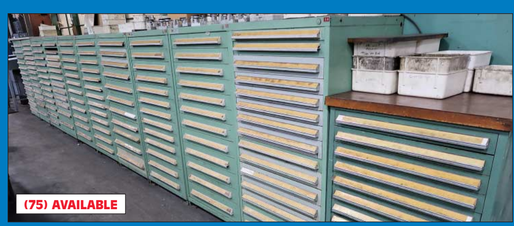
(75+) Vidmar / Lista Multi-Drawer Tooling Cabinets Loaded w/ Header Punches, Threader Dies, Tooling Accessories and Parts

(75+) Vidmar / Lista Multi-Drawer Tooling Cabinets Loaded w/ Header Punches, Threader Dies, Tooling, Accessories and Parts; Large Quantity of Inspection Items and Toolroom Accessories in Vidmars