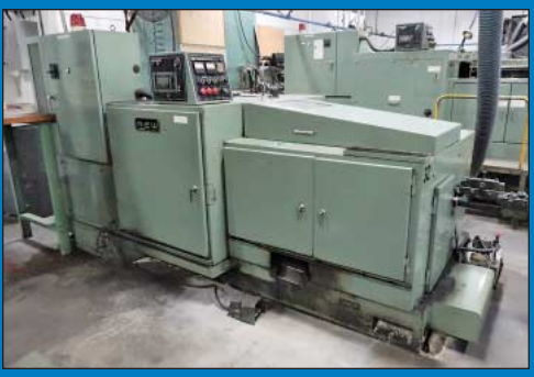
Asahi Okuma Model AOT-6XL High Speed Long Stroke 2-Die 2-Blow Cold Header