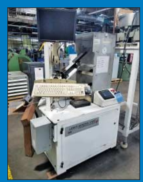
Laser General Model V-100 Versatile Measuring Machine