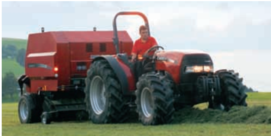
QUANTUM C POWER CURVE

Get going and keep going. Full access to the engine is provided with the hood raised, so daily checks are quick and easy even with front mounted implements fitted. Excellent starting performance in all weather conditions gives you reliability in every season. A large fuel tank keeps you working all day long and is easy to fill from ground level.