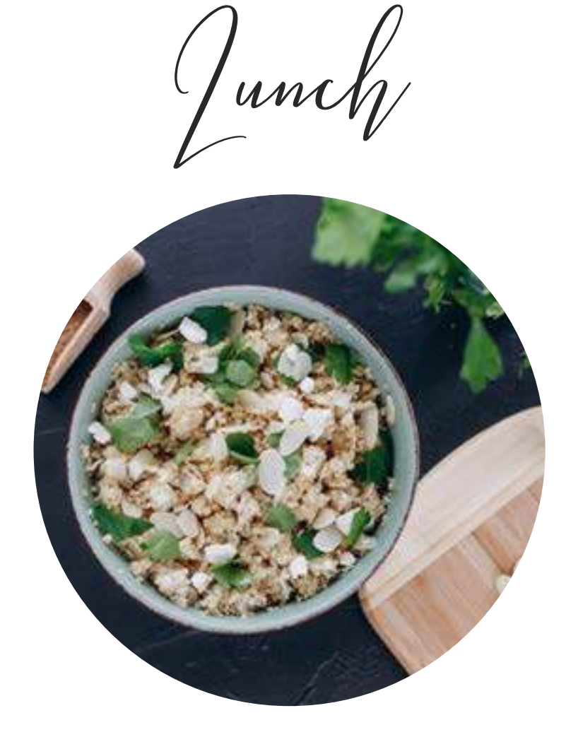
7 Day Plan by Medmunch