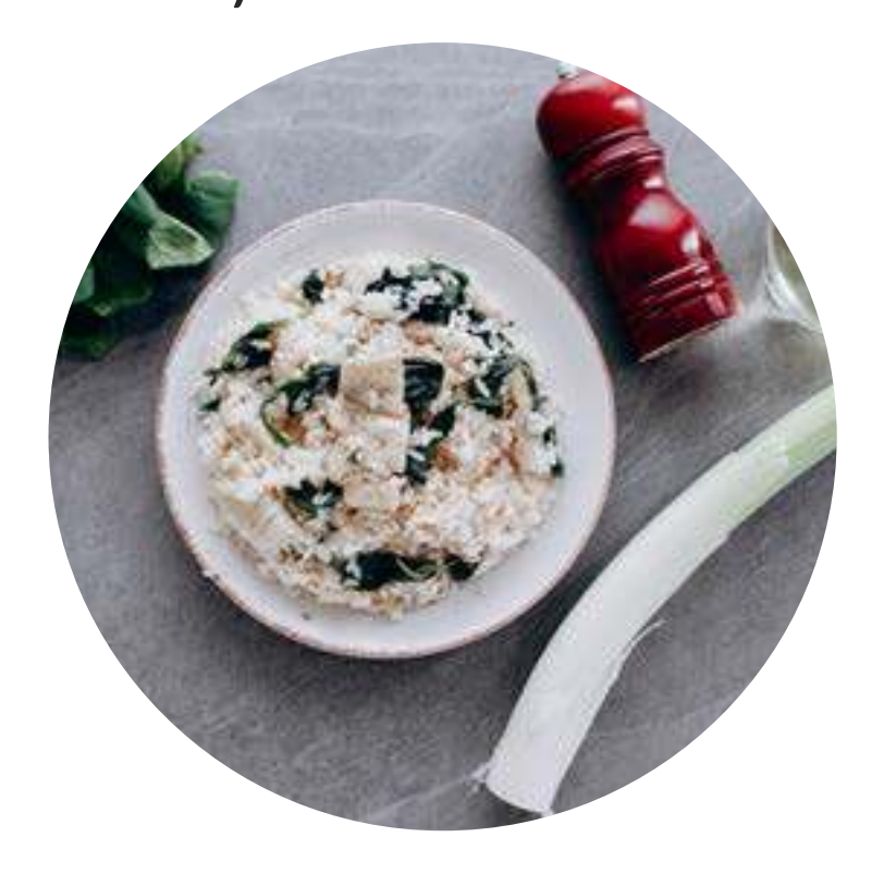
7 Day Plan by Medmunch