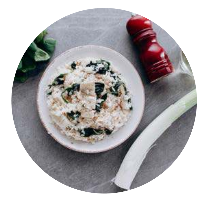
7 Day Plan by Medmunch