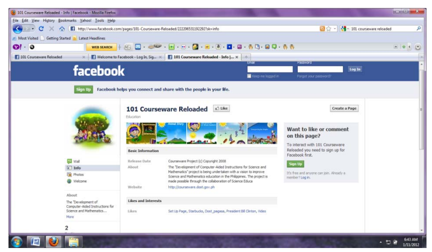
Figure 4. Courseware reloaded on Facebook.

The use of social networking Website has become so extensive in the Philippines that the country has been nicknamed as "The Social Networking Capital of the World" (Digital Media in Philippines from Digital Media Asia, n.d.). According to Alexa Traffic Rank, Facebook is the number one site in Philippines (Digital Media in Philippines from Digital Media Asia, n.d.).