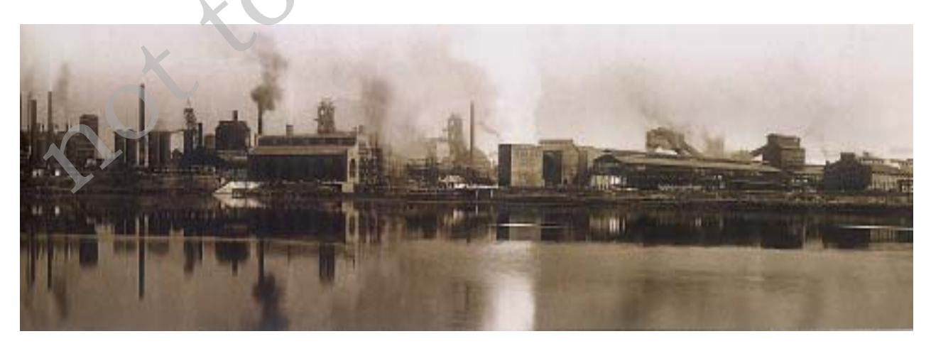
Fig. 14 – The Tata Iron and Steel factory on the banks of the river Subarnarekha, 1940