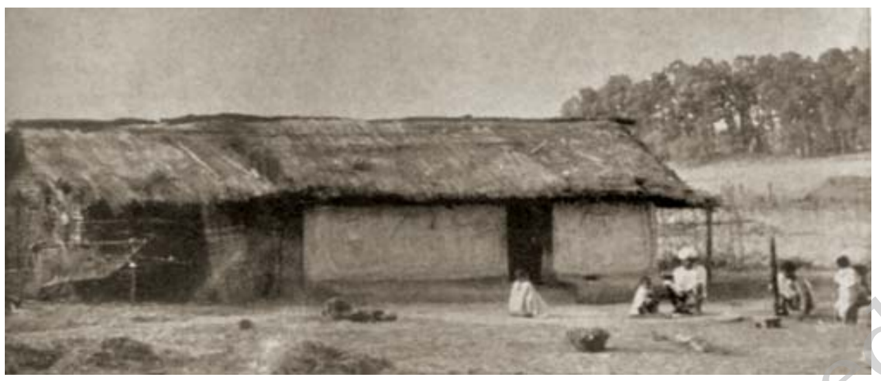
Fig. 13 – A village in Central India where the Agarias – a community of iron smelters – lived. Some communities like the Agarias specialised in the craft of iron smelting. In the late nineteenth century a series of famines devastated the dry tracts of India. In Central India, many of the Agaria iron smelters stopped work, deserted their villages and migrated, looking for some other work to survive the hard times. A large number of them never worked their furnaces again.