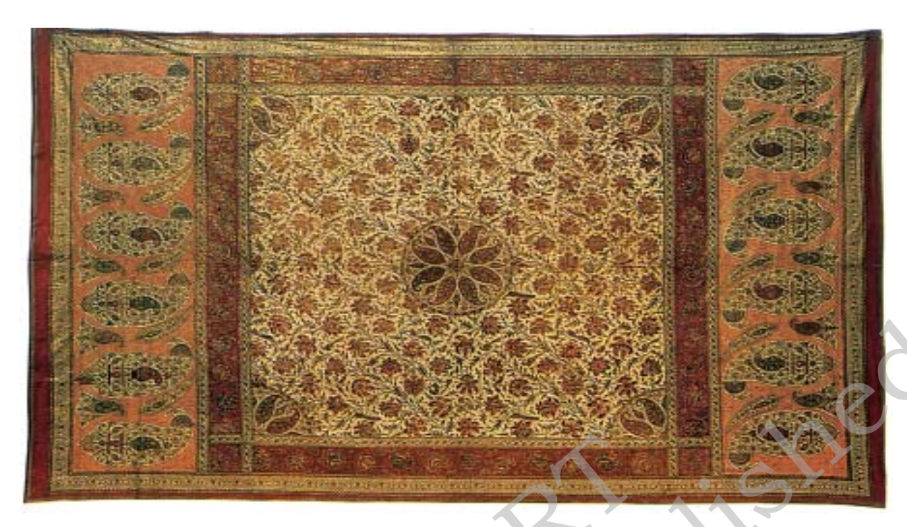
Fig. 5 – Printed design on fine cloth (chintz) produced in Masulipatnam, Andhra Pradesh, mid-nineteenth century

This is a fine example of the type of chintz produced for export to Iran and Europe.