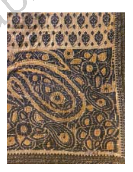
Fig. 4 – Jamdani weave, early twentieth century

Similarly, the word bandanna now refers to any brightly coloured and printed scarf for the neck or head. Originally, the term derived from the word