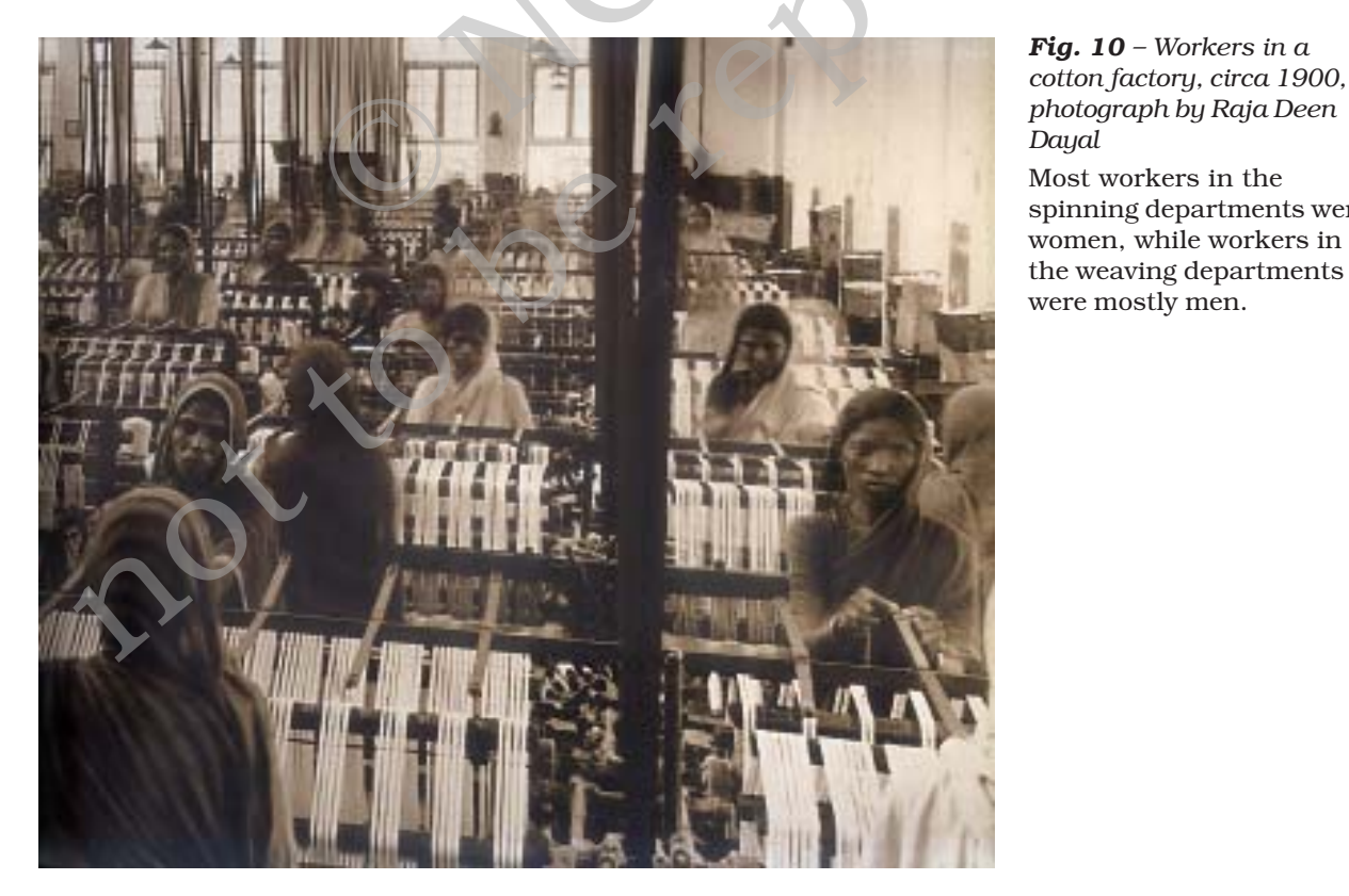
Fig. 10 – Workers in a cotton factory, circa 1900, photograph by Raja Deen Most workers in the spinning departments were women, while workers in

The first cotton mill in India was set up as a spinning mill in Bombay in 1854. From the early nineteenth century, Bombay had grown as an important port for the export of raw cotton from India to England and China. It was close to the vast black soil tract of western India where cotton was grown. When the cotton textile mills came up they could get supplies of raw material with ease.