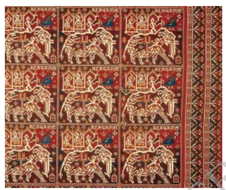
Fig. 2 – Patola weave, mid-nineteenth century Patola was woven in Surat, Ahmedabad and Patan. Highly valued in Indonesia, it became part of the local weaving tradition there.

Let us first look at textile production.