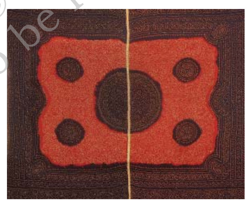
Fig. 6 – Bandanna design, early twentieth century

There were other cloths in the order book that were noted by their place of origin: Kasimbazar, Patna, Calcutta, Orissa, Charpoore. The widespread use of such words shows how popular Indian textiles had become in different parts of the world.