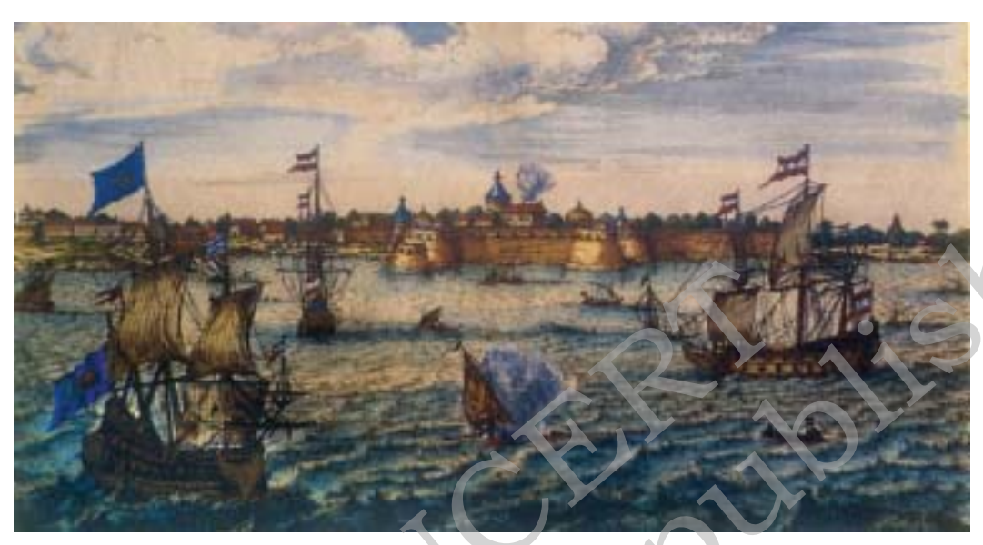
Fig. 1 – Trading ships on the port of Surat in the seventeenth century Surat in Gujarat on the west coast of India was one of the most important ports of the Indian Ocean trade. Dutch and English trading ships began using the port from the early seventeenth century. Its importance declined in the eighteenth century.

This chapter tells the story of the crafts and industries of India during British rule by focusing on two industries, namely, textiles and iron and steel. Both these industries were crucial for the industrial revolution in the modern world. Mechanised production of cotton textiles made Britain the foremost industrial nation in the nineteenth century. And when its iron and steel industry started growing from the 1850s, Britain came to be known as the "workshop of the world".