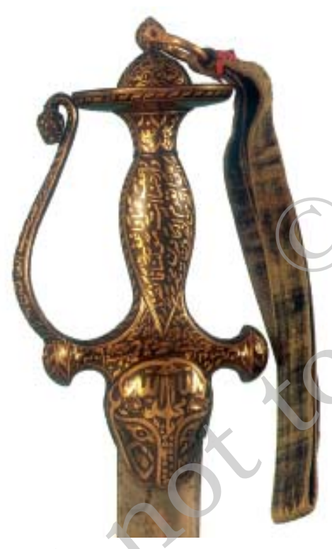
Fig. 11 – Tipu's sword made in the late eighteenth century Written with gold on the steel handle of Tipu's sword were quotations from the Koran with messages about victories in war. Notice the tiger head towards the bottom of the handle.

Smelting – The process of obtaining a metal from rock (or soil) by heating it to a very high temperature, or of melting objects made from metal in order to use the metal to make something new