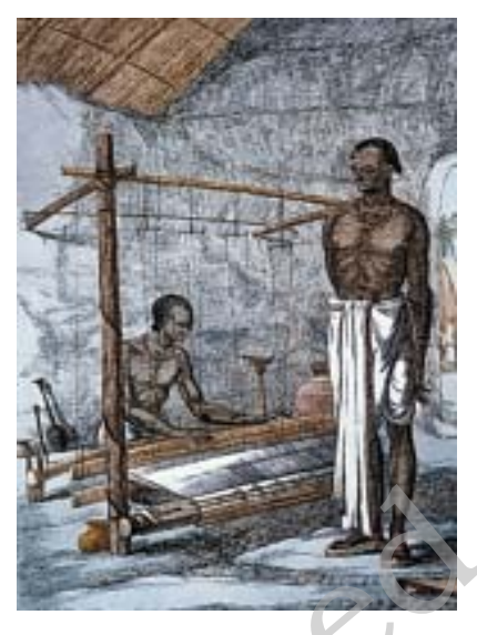
Fig. 9 – A tanti weaver of Bengal, painted by the Belgian painter Solvyns in the 1790s

By the beginning of the nineteenth century, Englishmade cotton textiles successfully ousted Indian goods from their traditional markets in Africa, America and Europe. Thousands of weavers in India were now thrown out of employment. Bengal weavers were the worst hit. English and European companies stopped buying Indian goods and their agents no longer gave out