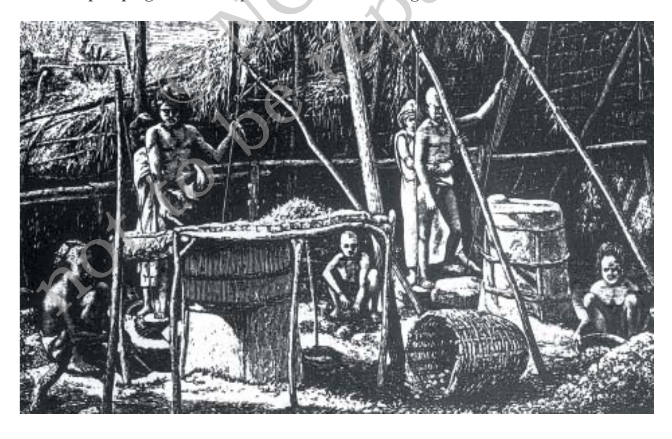
Fig. 12 – Iron smelters of Palamau, Bihar

Bellows – A device or equipment that can pump air