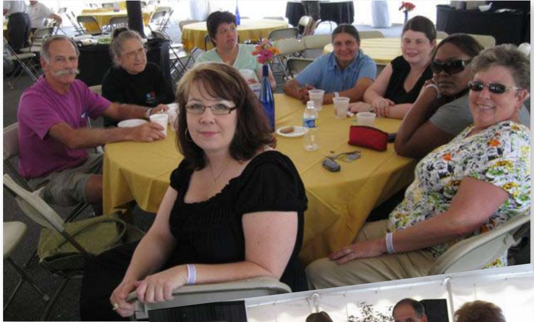
On August 15th, the staff gathered at Dankeplatz during Musikfest for what has become an annual event. The Musikfest Luncheon is a great opportunity for the staff to gather in an informal setting and enjoy a nice lunch in festive surroundings. The staff and commissioners enjoyed the Mexican-themed food and the camaraderie.

My lease tip for this issue involves "Late Charges". Save yourself these charges by remembering that a $15.00 charge is assessed for rent paid after the fifth day of the month. Also, your rent will be considered unpaid when a check is returned at NSF. If you ever have any questions about this topic or any others, contact CHOO at 610-865-8352. ▲