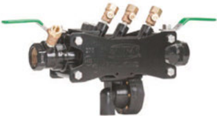
WILKINS #375XL PLASTIC BODY HELPS DETER THEFT