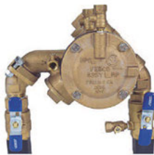
FEBCO #825YA ANGLE PATTERN