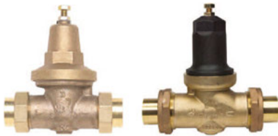
MODEL #70 MODEL #NR3