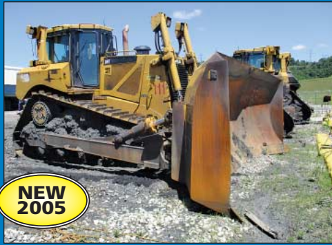
(2) Caterpillar Model D8T Crawler Dozer