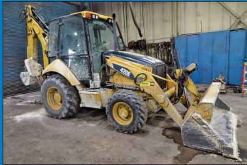
Caterpillar Model 420E 4-Wheel Drive Backhoe / Front End Loader