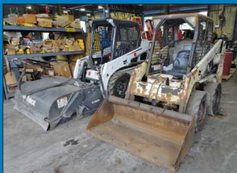
(9) Bobcat S-450 and S-130 Skid Steer Loaders