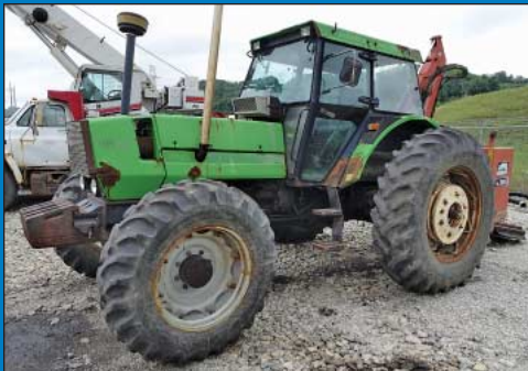
Deutsch Model 1023AS Farm Tractor