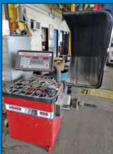
Coats Model 950 Direct Drive Solid State Wheel Balancer