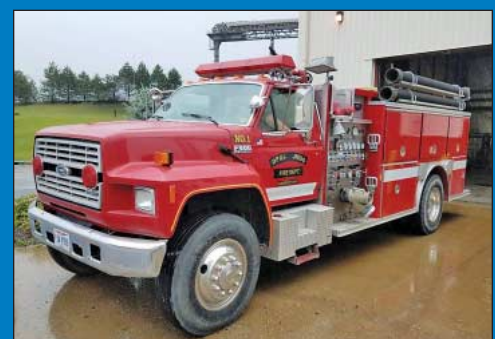
1991 Ford F800 Pumper Truck