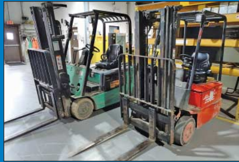
(3) Electric Lift Trucks up to 3,000 LB