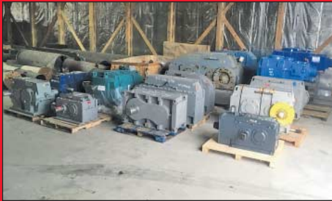
Partial View of Enclosed Gear Drives