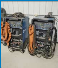
(2) 350 Amp Miller Syncrowave 350LX Tig Welders