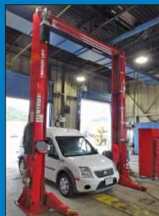
15,000 LB Rotary Lift Model S15IN610 Vertical Type Frame Vehicle Lift