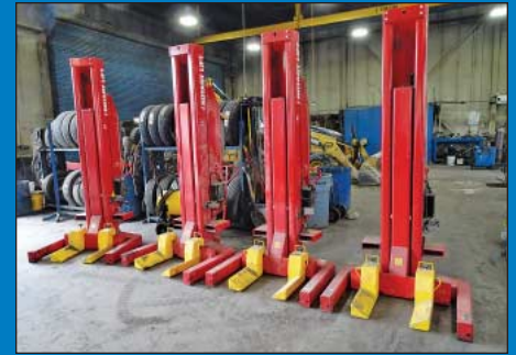
(6) 18,000 LB Rotary Lift Model MCHW618U100 Battery Powered Portable Vehicle Lifts