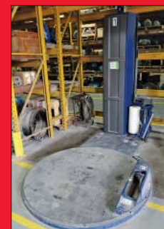
60" Lantech Rotary Stretch Wrapping Machine