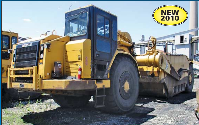
(2) Caterpillar Model 637G Wheel Tractor Scraper Pans