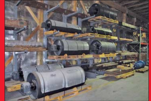
Drives for Conveyor Belts

60" Lantech Rotary Stretch Wrapping Machine