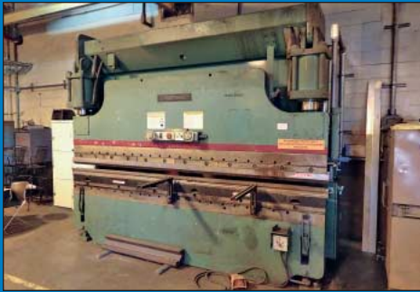
175 Ton X 12' Cincinnati Model 175CBX 10' Hydraulic Press Brake