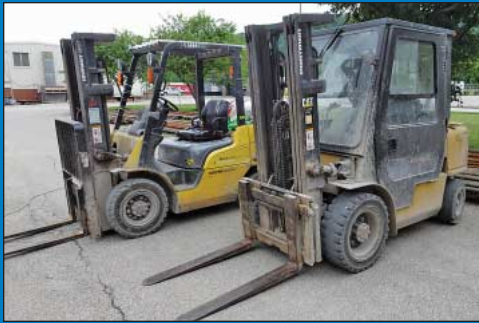
(7) LP Gas and Diesel Lift Trucks up to 15,000 LB