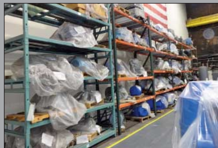
Large Quantity of New and Rebuilt Motors up to 10,727 HP