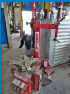
Coats Model 5035 RIM Clamp Tire Changer