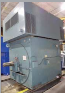
4,500 HP Motor