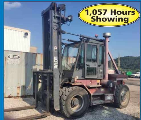
20,000 LB Taylor Model TX220S Pneumatic Tire Lift Truck