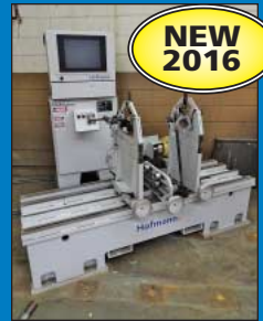
American Hoffman Model PCH-19.1 CNC Balancing Machining