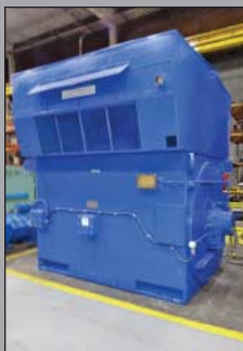
(2) 10,727 HP Motors