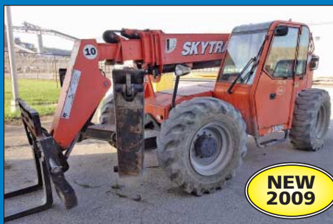
10,000 LB JLG Model 10054 4-Wheel Drive "Skytrak" Telehandler