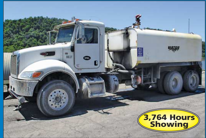
2012 Peterbilt Tandem Axle Water Truck

Compressor; S/N 75243, 726 Hours, (4) 4,500 PSI Tanks, Breathing Air Systems Model BA5550 CO Monitor