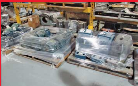
Large Quantity of Pillow Blocks