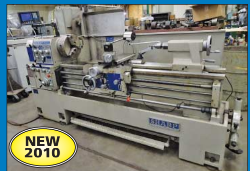
18" X 60" Sharp Model 1860L Geared Head Toolroom Engine Lathe