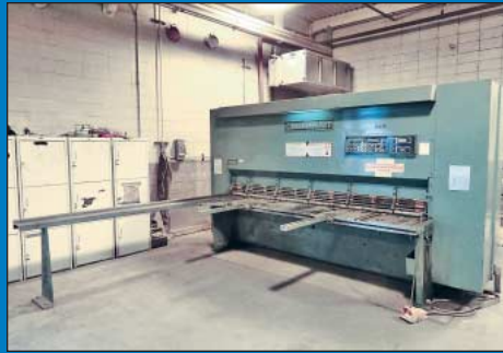
1/2" X 10' Cincinnati Model 500 Hydraulic Power Squaring Shear