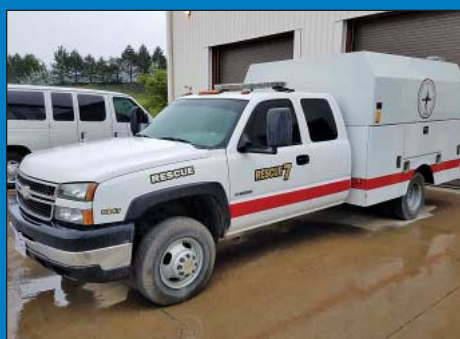
2008 Chevy 3500 Close Entry and Vertical Rescue Truck