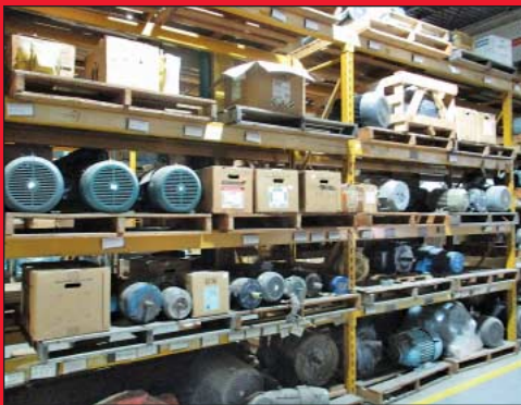
Large Quantity of Spare Motors