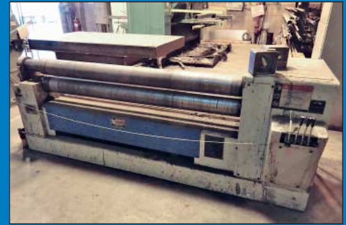
7/32" X 72" WDM Hydraulic Initial Punch Power Plate Bending Rolls

(3) 10" x 16" Wellsaw Model 1016 Horizontal Metal Cutting Band Saws; S/N 2651, 1884 and 5282