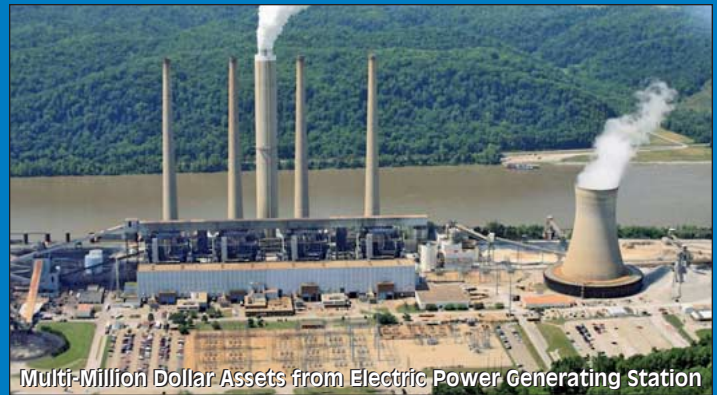
Multi-Million Dollar Assets from Electric Power Generating Station

Contact Information 2020 Dunlap St. Cincinnati, Ohio 45214 Phone 513-241-9701 Fax 513-241-6760 www.cia-auction.com