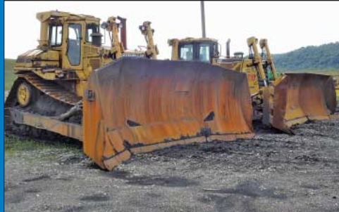
Caterpillar Model D9N Crawler Dozer