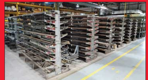
(11) Sections Double Sided Cantilever Racks with Flat Stock, Bar and Round Stock, All Thread Rod, Pipe Heat Exchanger, Sheet Stock