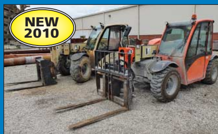
(4) 5,000 LB JLG Four-Wheel Drive Telehandlers

(3) Bobcat Model S450 Skid Steer Loader; S/N AUVB11464, Hard Tires, 66 Hours Showing