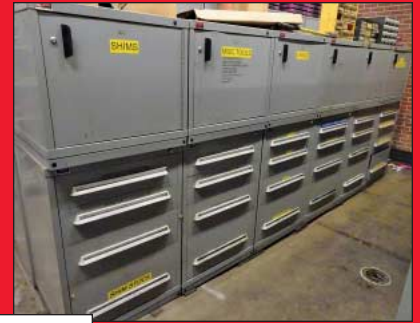
Large Quantity Small Repair Parts Including Electrical, Relays, and More

and Valve Parts, Power Transmission Parts, Electric Wire, Circuit Breakers and Relays, Conduit Fittings, Hose, Microprocessor Parts, Thermocouples, Gaskets, Flange, Pipe Fittings