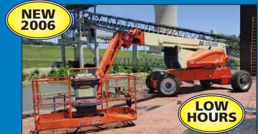
125' JLG Model 1250AP Boom Manlift

Bauer Compressor Model M11V-E3460V Breathing Air Station