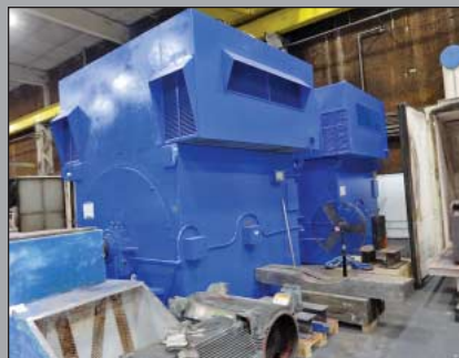
(2) 8,700 HP Motors