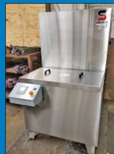
Blackstone-NEY Stainless Steel Ultra-Sonic Parts Washer Model AS-3000