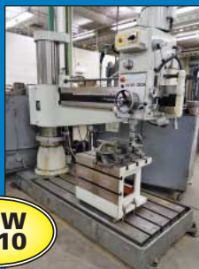
63" X 13" Column Victor Model 1363H Radial Arm Drill