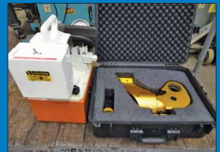
(2) TrosionX Model 10MD Hydraulic Portable Torque Wrenches with Hydraulic Power Packs