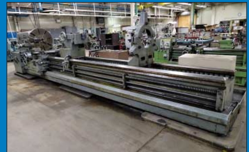
40" X 192" Monarch Model 3220-28-192 Geared Head Toolroom Engine Lathe