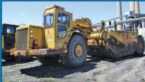
Caterpillar Model 637D Wheel Tractor Scraper Pan