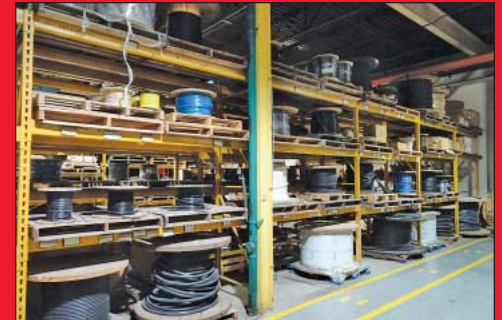
Large Quantity of Electrical Wire