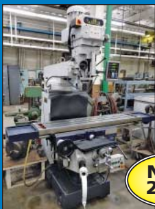
5 HP Willis Model 5000VS Dovetail Ram Variable Speed Vertical Milling Machine