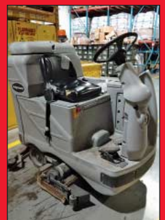
Advance Model 3820C Electric Sit Down Rider Type Electric Floor