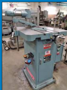
DC Morrison No. 2 Keyseater