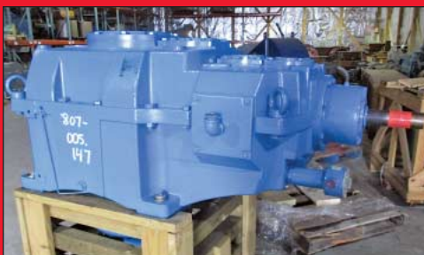
Large Gear Drive