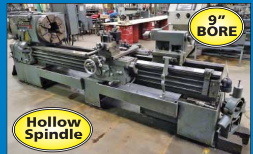
24" X 92" Leblond Model 24" Regal 9" Hollow Spindle Geared Head Toolroom Engine Lathe