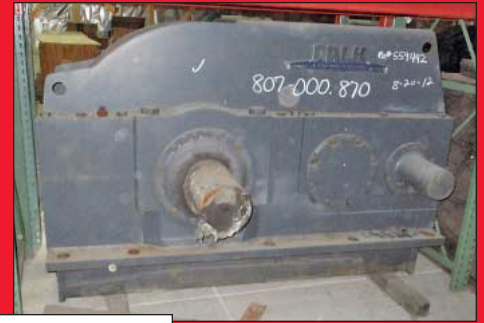
Large Quantity of Enclosed Gear Drives By Foute-Jones, Falk, Browning and Other