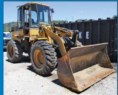
Caterpillar Model 918F 4-Wheel Drive Rubber Tire Loader

(2) 8" X 20' Conex Storage Boxes Caterpillar Model H65D Hammer Attachment; S/N FTS01019