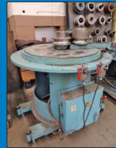
Pedrick Model B-10 Hydraulic Pipe and Tube Bender

Shop Equipment Consisting of: (4) Mag Base Drills, Milwaukee Hammer Drills, Cordless Tools, 13-3/4" to 20" Pipe Clamp Shell Beveller, Enerpac Hydraulic Unit, Climax Keyway Cutters and Flange Facers, Wachs Bevelers, Wachs Guillotine Saws, Work Benches with Vises, Steel Horses, Portable Carts, C-Clamps, Stencil Machine, 10 Ton H-Frame Press, 2-Door Steel Storage Cabinets, Beverly Hand Shears, Portable Dump Hoppers, Flammable Cabinets, Acetylene Torch Set with Cart, Air Hose Reels, Porta Powers, Portable tool Boxes, Electric Hand Tools, Clamshell Beveler, Bearing Heaters, (3) 48" Proto Portable Tool Boxes, And Many Other Related Items