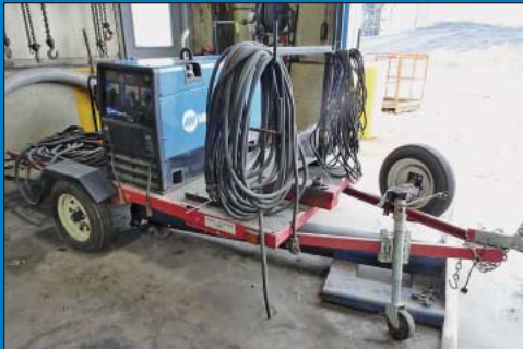
Maintenance Cart with Miller Bobcat 250 Welder, 11,000 Watt Generator (Gas Powered) and 3-1/2" Gas Powered Water Pump