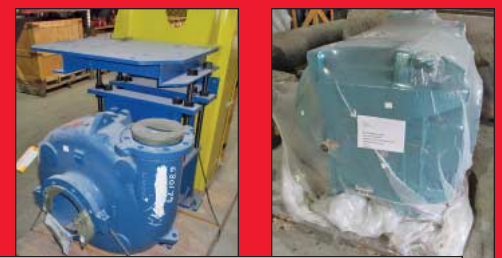
Large Quantity of Power Plant Maintenance and Repair Parts