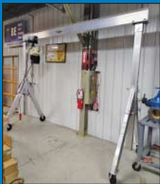
2 Ton Portable Gantry with Coffing Hoist