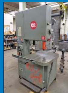
24" Grob Model 4V-24 Vertical Metal Cutting Band Saw