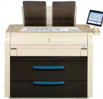
KIP 7570 network print system with integrated top stacking print tray

KIP cloud connectivity enables productive printing access anytime, anywhere. The KIP 7570 network print system makes working smarter easy for small or large workgroups. The Perfect View adjustable KIP smart multi-touchscreen offers intuitive printing directly from a variety of network resources, cloud connections, removable media, local mailboxes and historical queue; you don't have to leave the printer to perform important tasks. Easily upgrade the KIP 7570 to a multi-function print system.