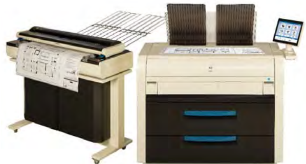
KIP 7590 MFP system with KIP 2300 CCD production scanner

Optimize production with confidence. The KIP 7590 delivers intelligent productivity that expands enterprise workflow capabilities and efficiency. The modular footprint design includes a KIP 2300 CCD scanner that sets a uniquely high standard for color scanning speed, face up/face down/thick media document feeding versatility and digital imaging quality.