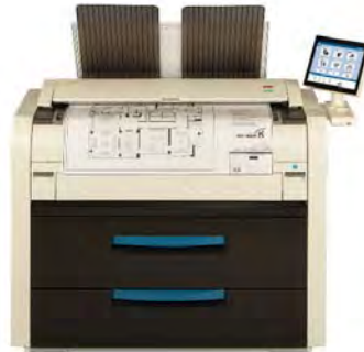
KIP 7580 multi-function system with integrated CIS scanner & top stacking print tray