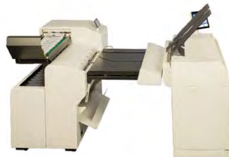
KIP 7570 print system & optional KIPFold 2800 online fan & cross folder