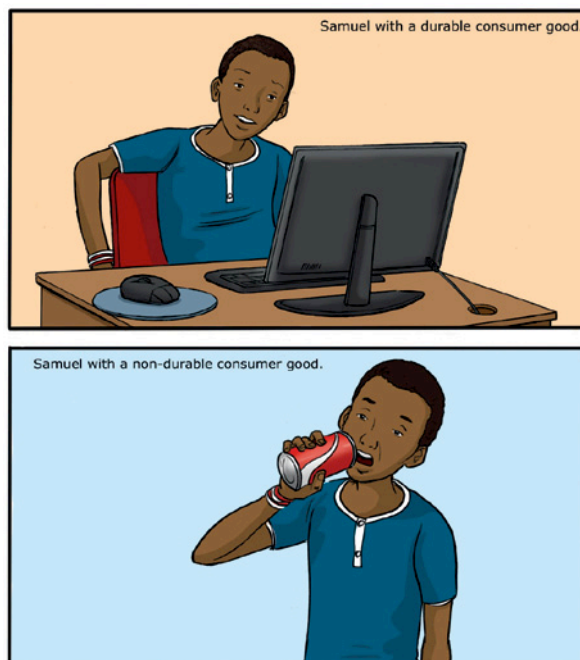
Figure 1.5 Consumer goods