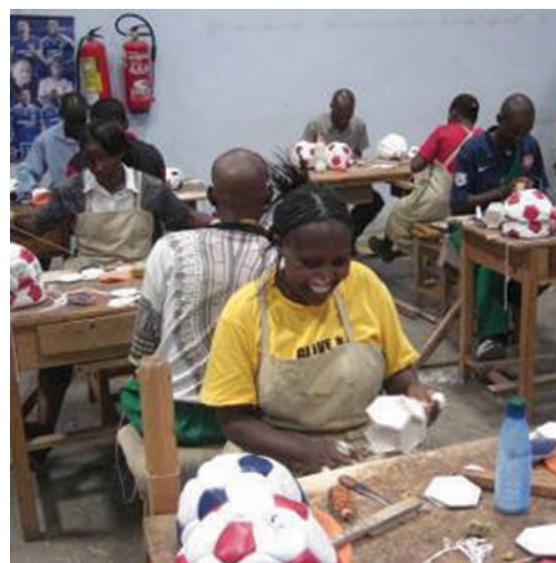
Making a football