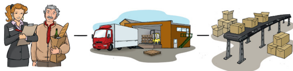
Figure 1.4 The purpose of business activity

We have already learned that businesses take scarce resources – factors of production – and use these to produce the goods and services demanded by consumers. Without the activity of business there would be no products and services.