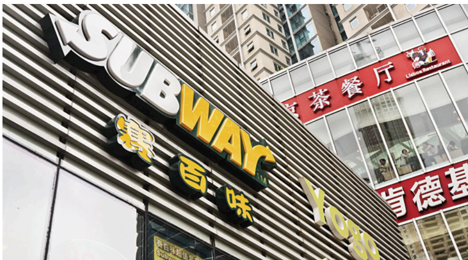
A Subway outlet in Asia

Have you ever wondered why Coca-Cola, Sony, and other well-known companies spend huge sums of money on advertising and other promotional activities? They do this to build and then maintain their brand. The products produced by each of these companies all have close substitutes – that means you can buy other brands of drink and electronic goods. However, these companies are able to charge a higher price than their competitors, even though the costs of production are likely to be quite similar. Branding increases added value because people want or feel they should buy the item from this particular company.