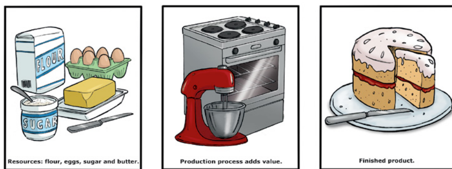
Figure 1.7 Adding value

Whatever good or service a business produces, it will try to add value at every stage of the production process. It does this by taking raw materials and turning them into a good or service which it sells to customers at a price greater than the cost of the raw materials used in their production. Added value is one of the most important objectives of business. Figure 1.7 shows how value is added in the production of a cake.