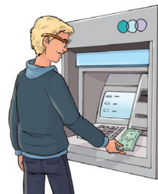
Figure 1.6 Consumer service

Consumer services are products which are also sold to the public, but they cannot be seen or touched (intangible), for example insurance, banking and bus journeys. You can see and touch the buildings where insurance and banking services take place and you can obviously see and touch a bus, but you are not buying these items, you are using a service which they provide and this service cannot be seen or touched.