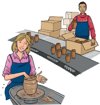
Figure 1.3 A single worker and the production process

factors of production are not wasted on the production of goods and services that consumers do not need or want.