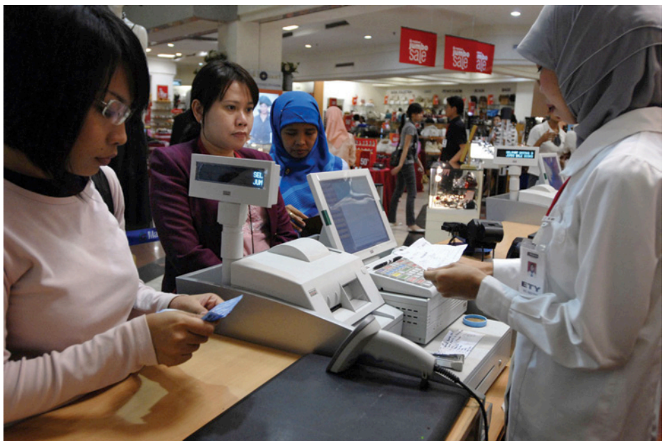
Customers in a shop

Wants are different. They are any goods or services which people would like to have. They are not essential for living. Mobile phones, cars and holidays are good examples.