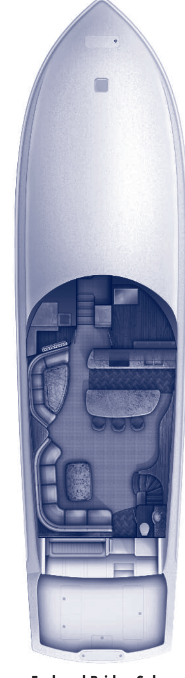
Enclosed Bridge Salon