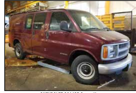
CHEVROLET G31405 Cargo Van