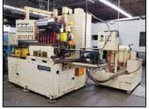
THIELENHAUS SF125-H8A Microfinish Hone