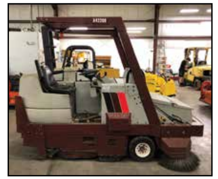
MINUTEMAN TSS-82 Powerboss Floor Sweeper