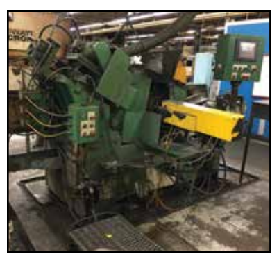
CINCINNATI CNC Centerless Grinder