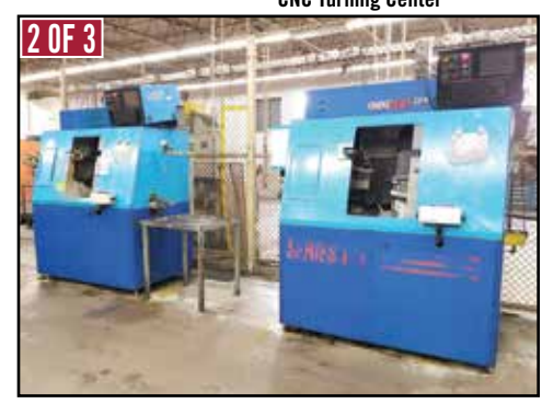
(3) OMNITURN GT-75 3-Axis CNC Lathes