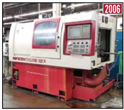
GANESH Cyclone 32CS 3-Axis Swiss Type CNC Lathe