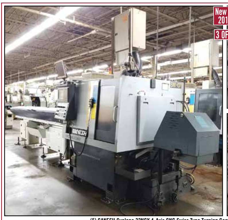
(5) GANESH Cyclone 32NCY 4-Axis CNC Swiss Type Turning Centers