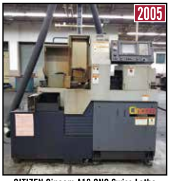
CITIZEN Cincom A16 CNC Swiss Lathe