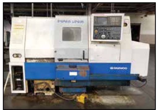
DAEWOO Puma 200MSC CNC Turning Center