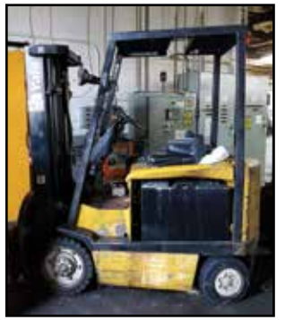
YALE 4,000-lb. Forklift