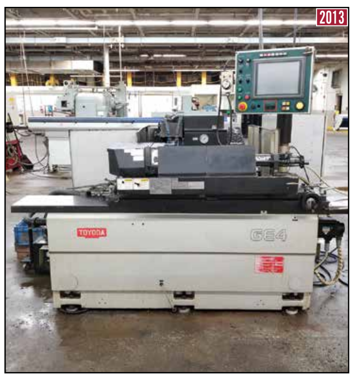
TOYODA GE4P-50CNC Hydraulic Universal Cylindrical OD CNC Grinder