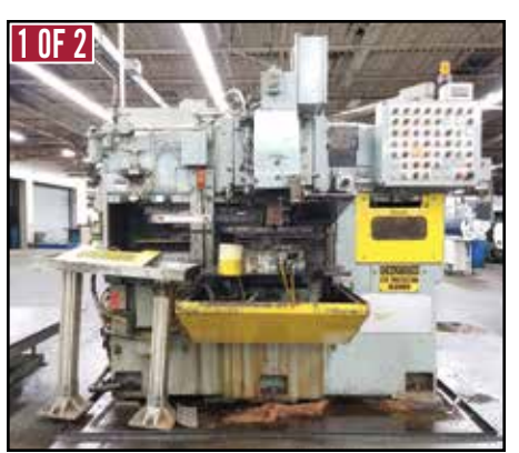
(2) ANDERSON COOK 350S & 330S Hydraulic Spline Rollers