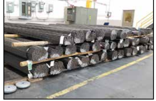
(90+) Bundles of 12'+/- x 1/2"-2" Dia. Bar Stock