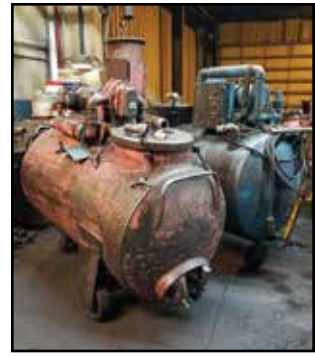
(2) 500-Gallon Sump Sucker Pump Systems