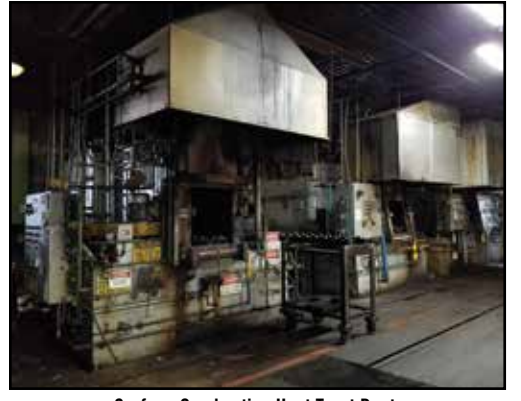
Surface Combustion Heat Treat Dept, w/(7) ALLCASE & FORCE-AIRE Power Convection Furnaces