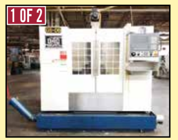
(2) 2012 OHIO BROACH CNC Vertical Shapers / Broaches