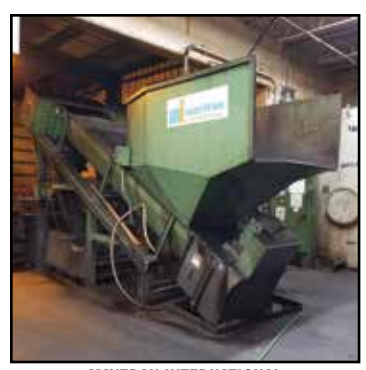
MAYFRAN INTERNATIONAL Chip Processing System