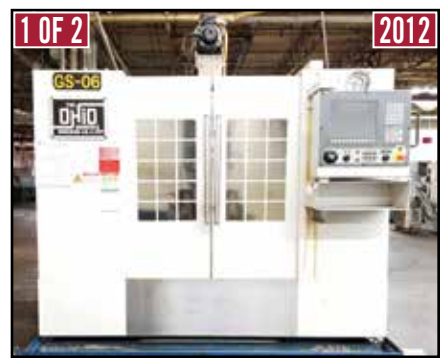
(2) OHIO BROACH CNC Vertical Shapers / Broaches