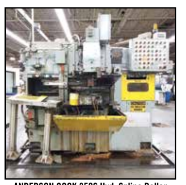
ANDERSON COOK 350S Hyd. Spline Roller