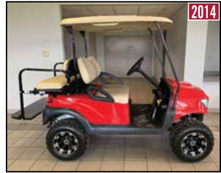
CLUB CAR Precedent Electric Golf Cart