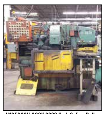
ANDERSON COOK 330S Hyd. Spline Roller