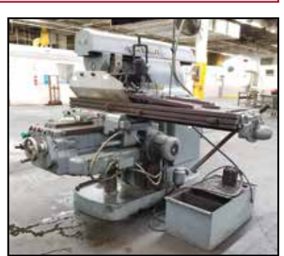
CINCINNATI 415-15 DT Horizontal Mill