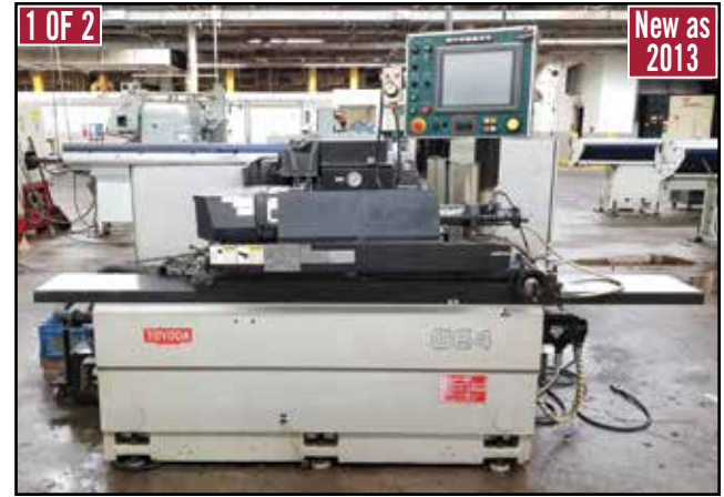
(2) TOYODA GE4P-50CNC Hyd. Universal Cylindrical OD CNC Grinders

INSPECTION: Day Prior to Auction from 9AM-4PM