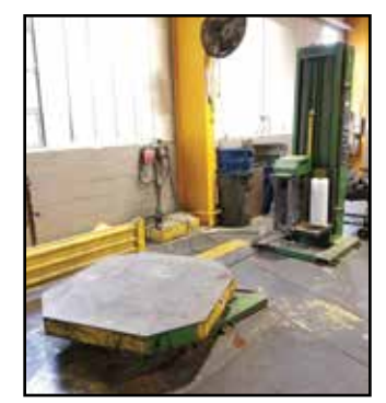
HIGHLIGHT Synergy 2.2.5 Rotary Stretch Wrapper