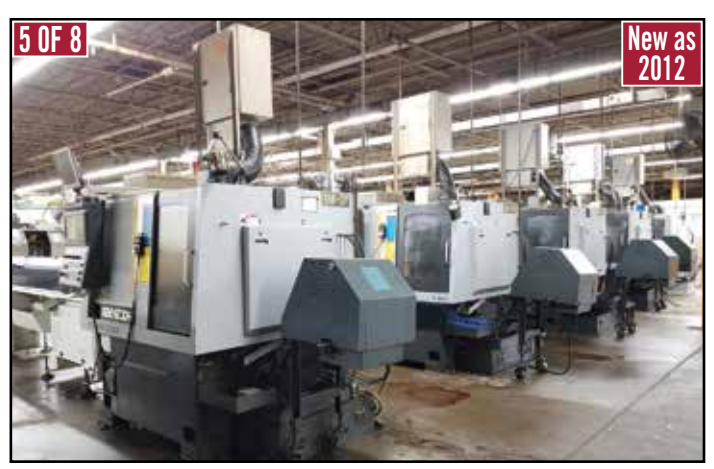
(8) GANESH Swiss Type CNC Turning Centers