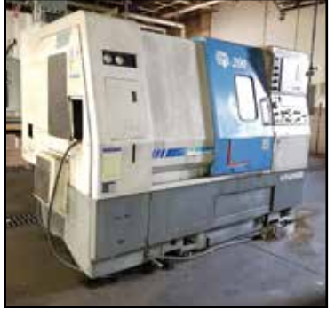
HYUNDAI HIT-200 CNC Turning Center