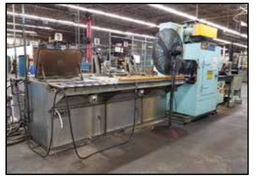
LEWIS/ACME Fab Parts Washer System