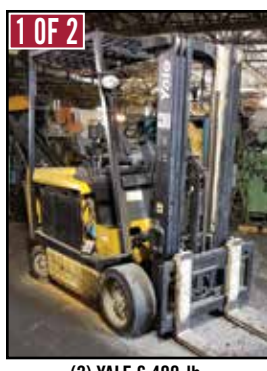
(2) YALE 6,400-lb. & 5,000-lb. Forklifts