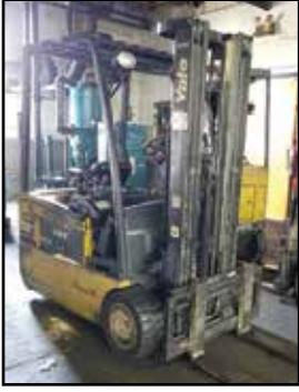
YALE 3,650-lb. Forklift