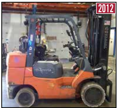
TOYOTA 7FGCU35 8,000-lb. Forklift