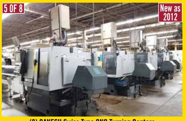
(8) GANESH Swiss Type CNC Turning Centers

INSPECTION: Day Prior to Auction from 9AM-4PM