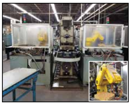
PROMESS 52-Station Automated Assembly System