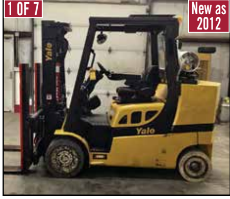
(7) YALE & TOYOTA Forklifts to 12,000-lb. Capacity