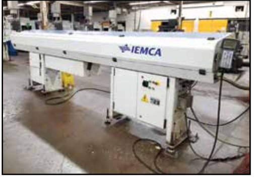
IEMCA Bar Feeds