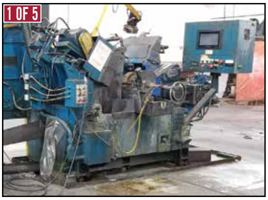
(5) CINCINNATI & MICRON CNC Centerless Grinders