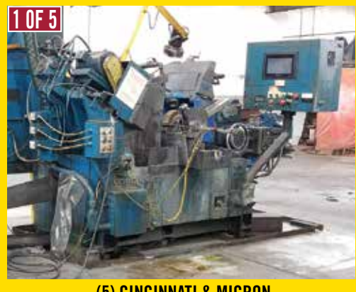
(5) CINCINNATI & MICRON CNC Centerless Grinders