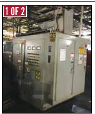
(2) TOCCO Induction Hardeners