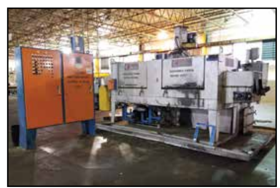
CK CONCEPTS Pass-Through Parts Washer

2-139973-12, CNC Control, Dual Troyke Power Chucks, 40" x 16" Table THIELENHAUS Microfinish Hone, Model SF125-H8A, Super Macro Finish Grind/Hone, (7) Adj. Heads, Performance Feeders, Hydraulic 6-Spindle Hone w/Wash Coolant System