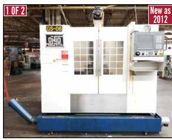
(2) OHIO BROACH CNC Vertical Shapers / Broaches