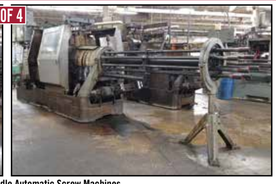
(4) ACME-GRIDLEY 8-Spindle Automatic Screw Machines