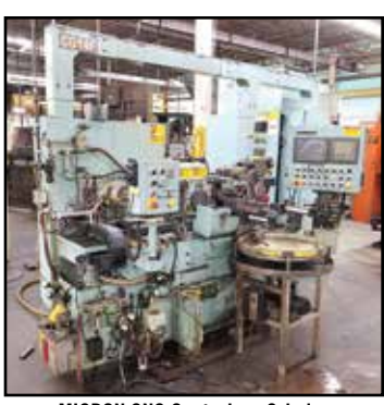
MICRON CNC Centerless Grinder