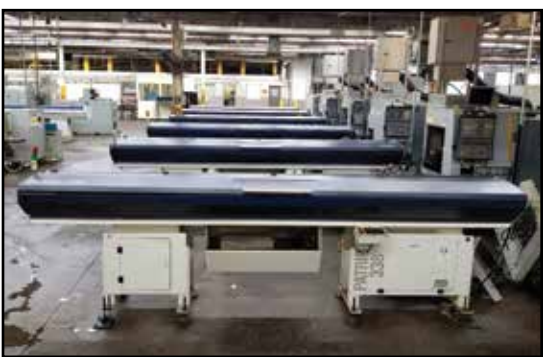
(5) EDGE Patriot Bar Feeds