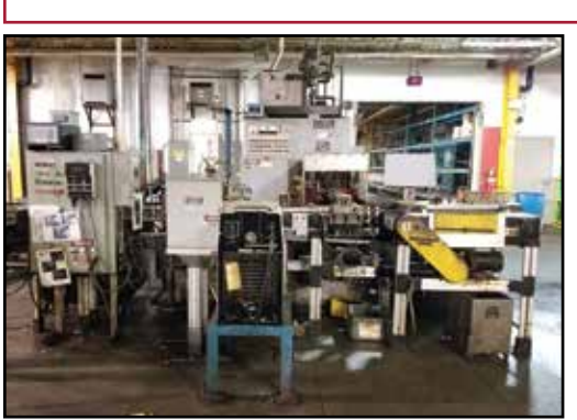
Welding & Assembly Cell