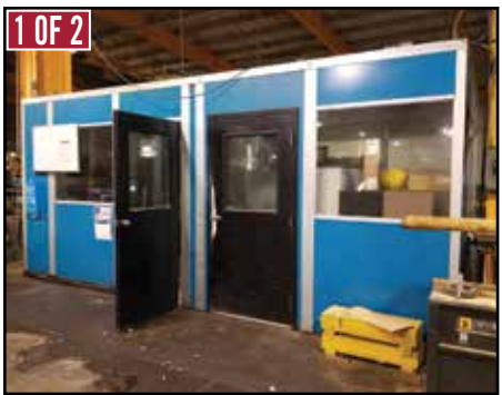
(2) 10' x 20' Modular Buildings