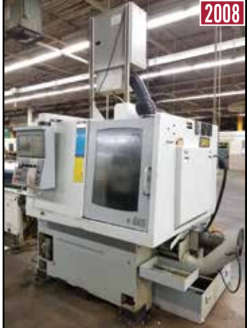
GANESH Cyclone 32 4-Axis CNC Lathes