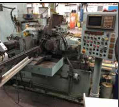
MICRON MD-600III-4W CNC Centerless Grinder