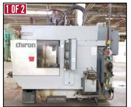
(2) CHIRON DZ 12 W Vertical Machining Centers