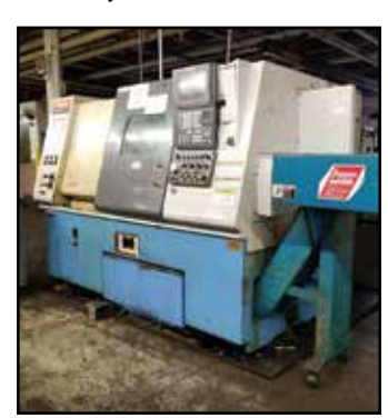
MAZAK Quick Turn 250-HP-UNIV CNC Turning Center