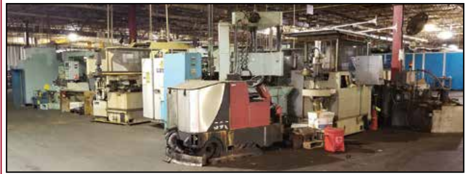
Large Scrap Opportunity