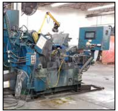
CINCINNATI 220-8 CNC Centerless Grinder