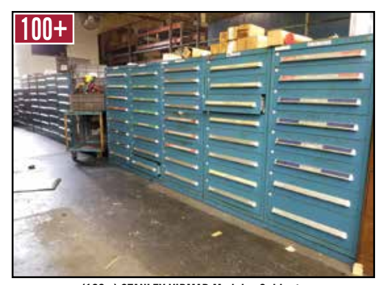
(100+) STANLEY VIDMAR Modular Cabinets w/Machine Parts & Accessories