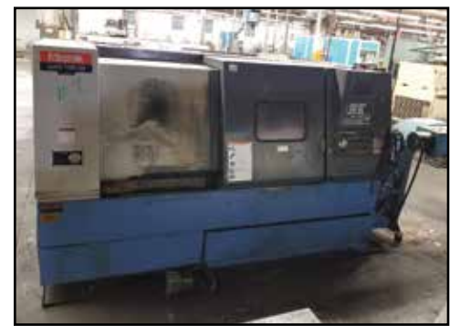
MAZAK QT300 CNC Turning Center