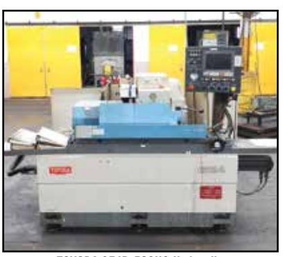
TOYODA GE4P-50CNC Hydraulic Universal Cylindrical OD CNC Grinder