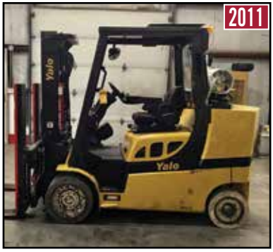
YALE GLC120VX 12,000-lb. Forklift