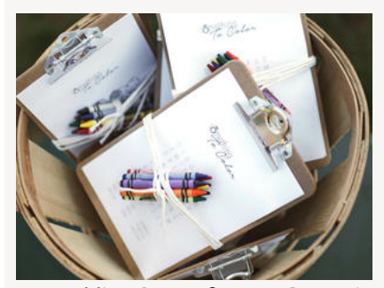
26 Wedding Games for Your Reception

Want everyone to have nothing but fun at your special event? Fill it with these fun, must-play wedding games that are sure to score big with your guests.