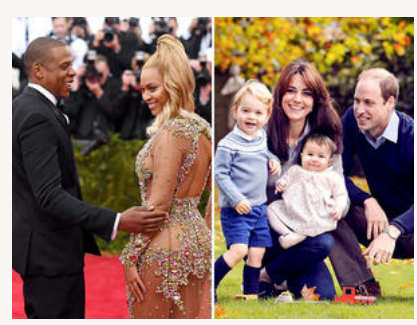
Famous Couples We Love to Love

From the pages of history books, scripts, celebrity gossip columns and more, we've rounded up the memorable matchups whose love makes us swoon