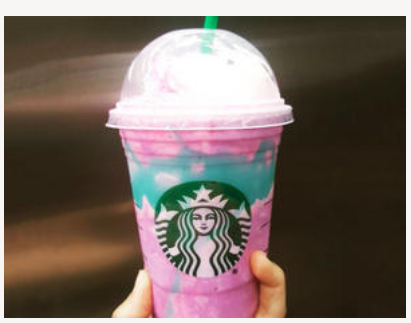
The Starbucks Unicorn Frap Will Get You Through Wedding Planning

Starbucks has the answer to your unicorn obsession (and wedding prep stress)—put a straw in it.