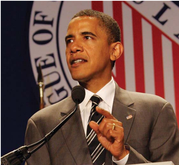
President Barack Obama speaks at the 2010 convention.