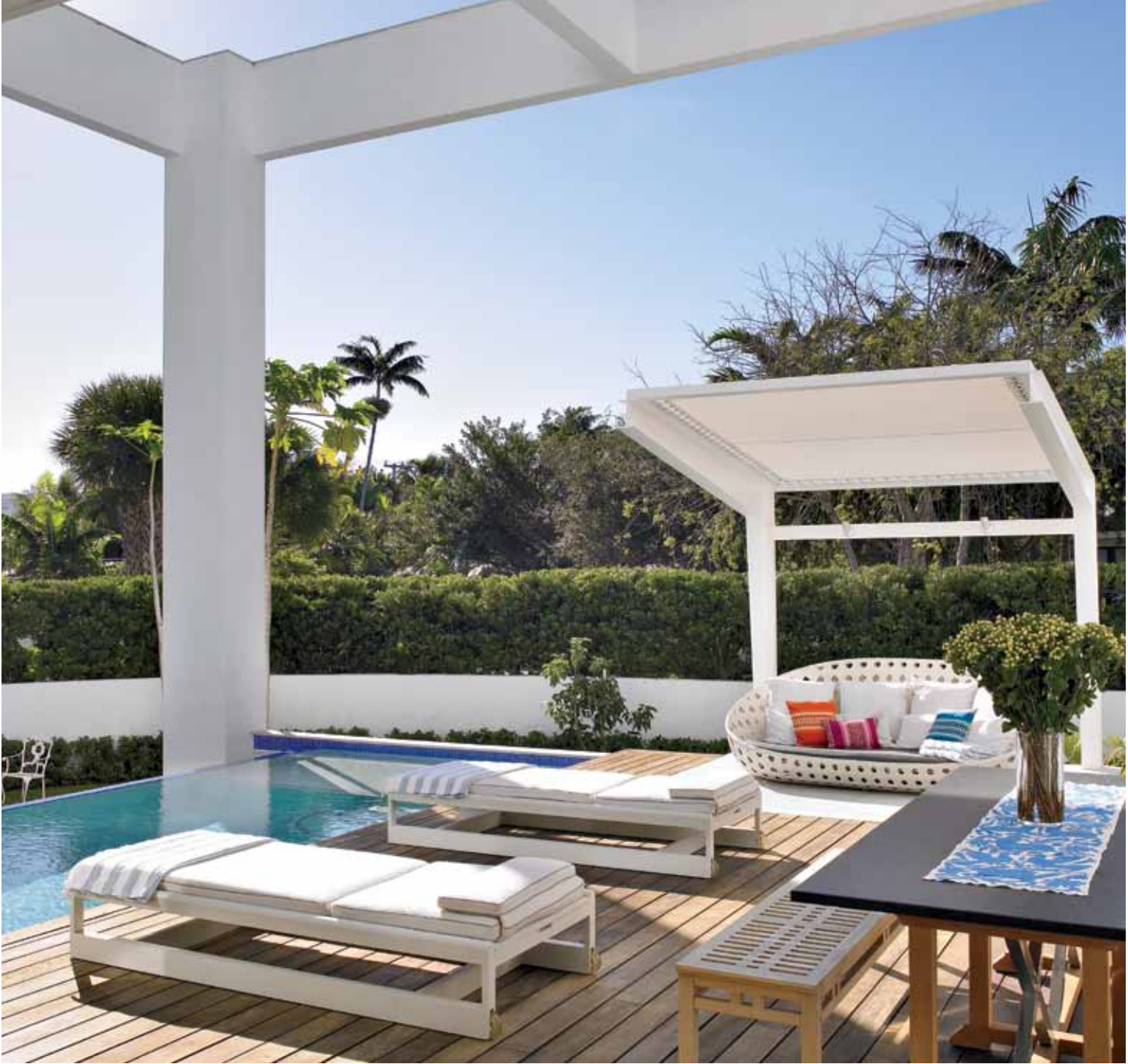
Opposite: Between B&B Italia's Canasta sofa, Great Lakes chaises by Sutherland, and a bench from Judith Norman—paired with a dining table also by Sutherland—the family has plenty of spots for relaxation.

“THE DESIGN TEAM KNEW WHAT WE WANTED EVEN BETTER THAN WE DID.”