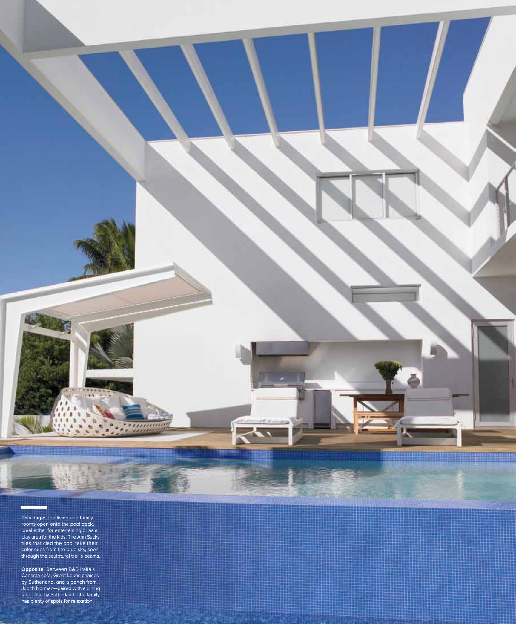
This page: The living and family rooms open onto the pool deck, ideal either for entertaining or as a play area for the kids. The Ann Sacks tiles that clad the pool take their color cues from the blue sky, seen through the sculptural trellis beams.